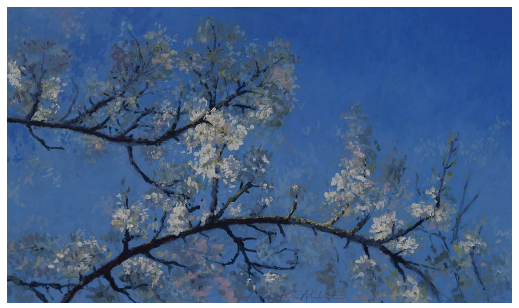
BLOSSOM BLUE SKY 40 X 65 cm