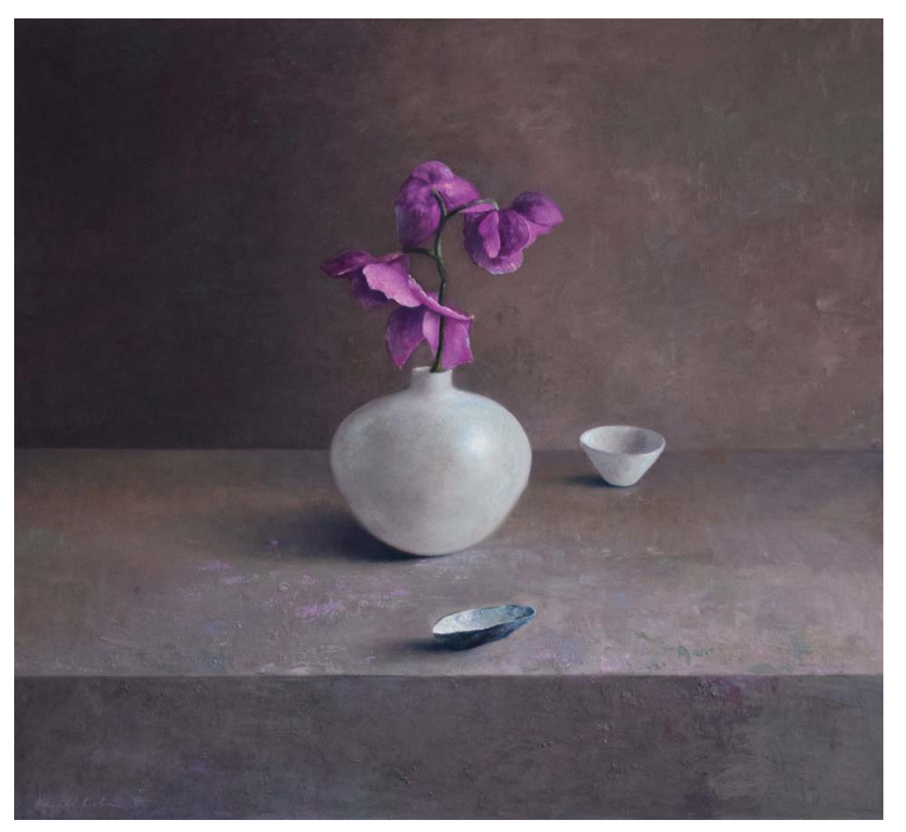
PINK ORCHID 80 X 85 cm