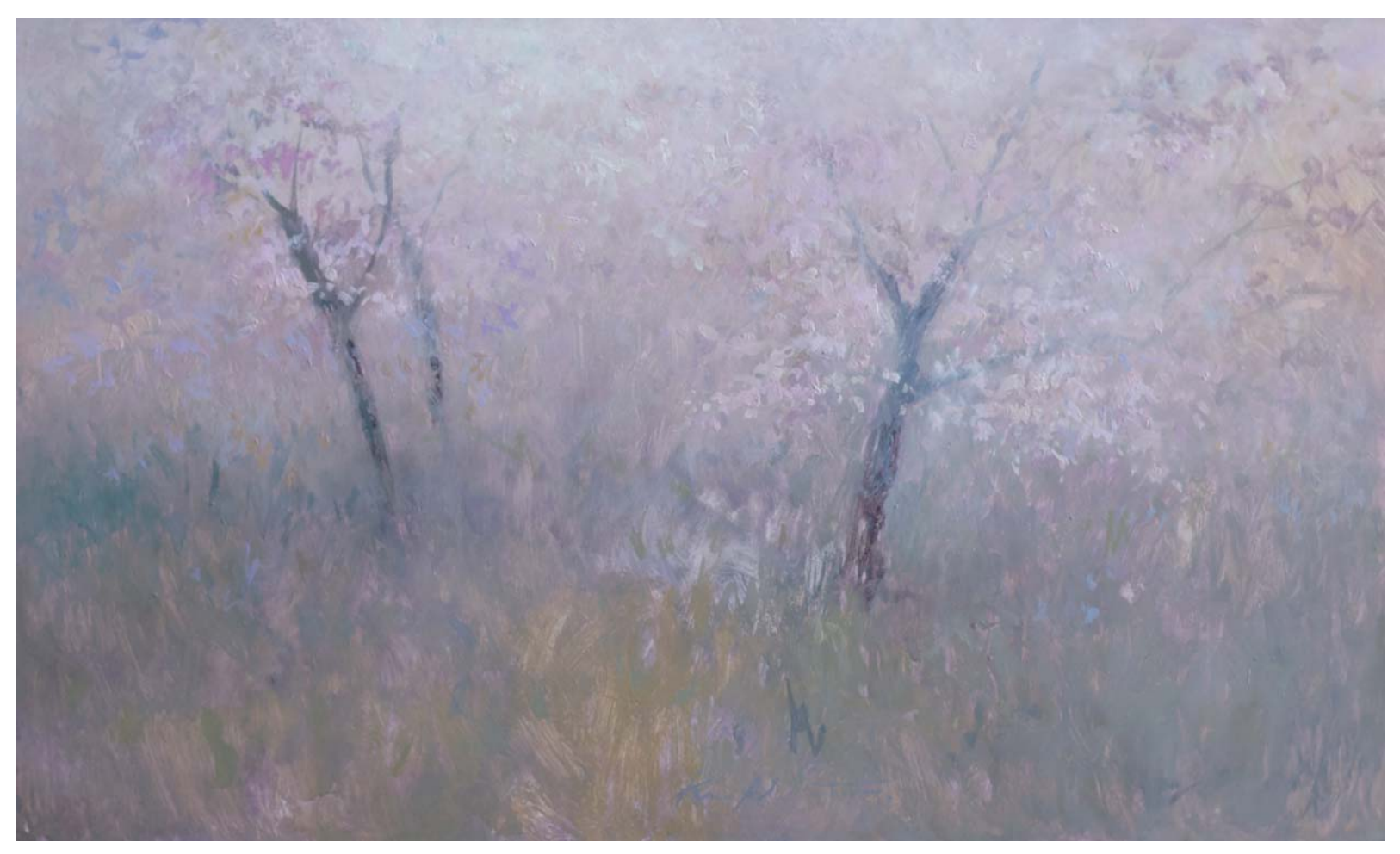
BLOSSOMTREES 40 X 65 cm