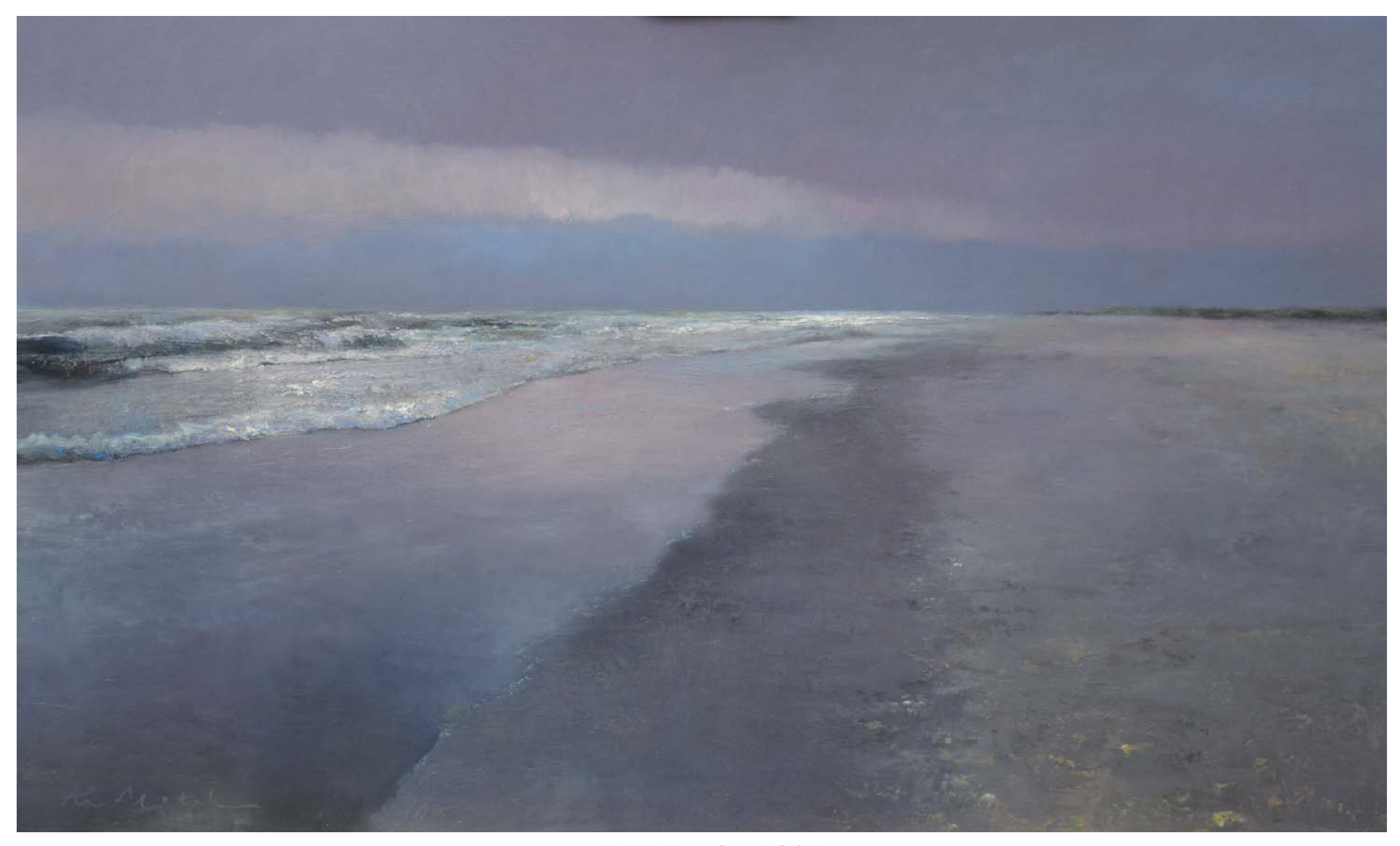
IN THE EVENING, LILAC SEA 40 X 66 cm