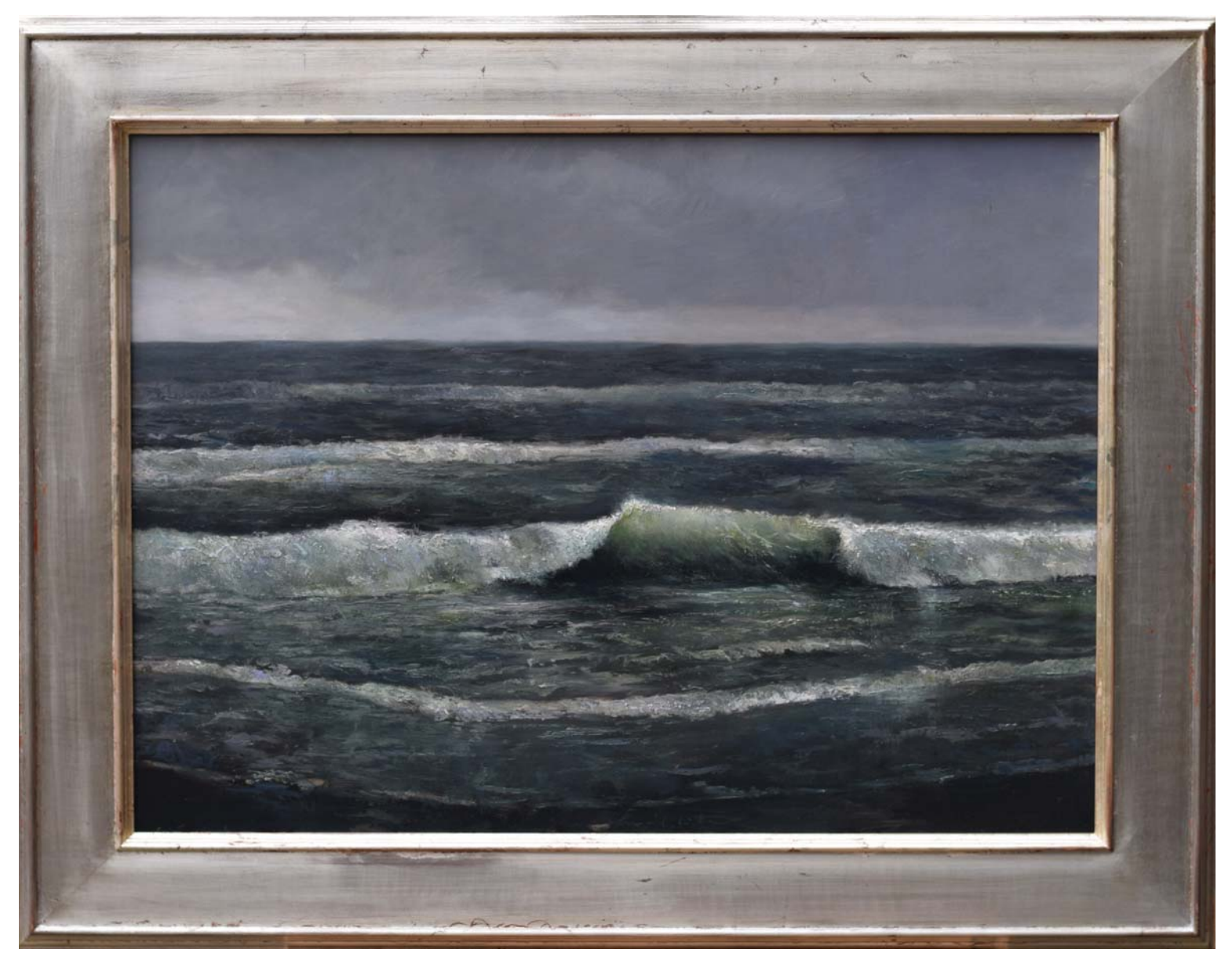
SEETHE SEA WAVE 60 X 80 cm