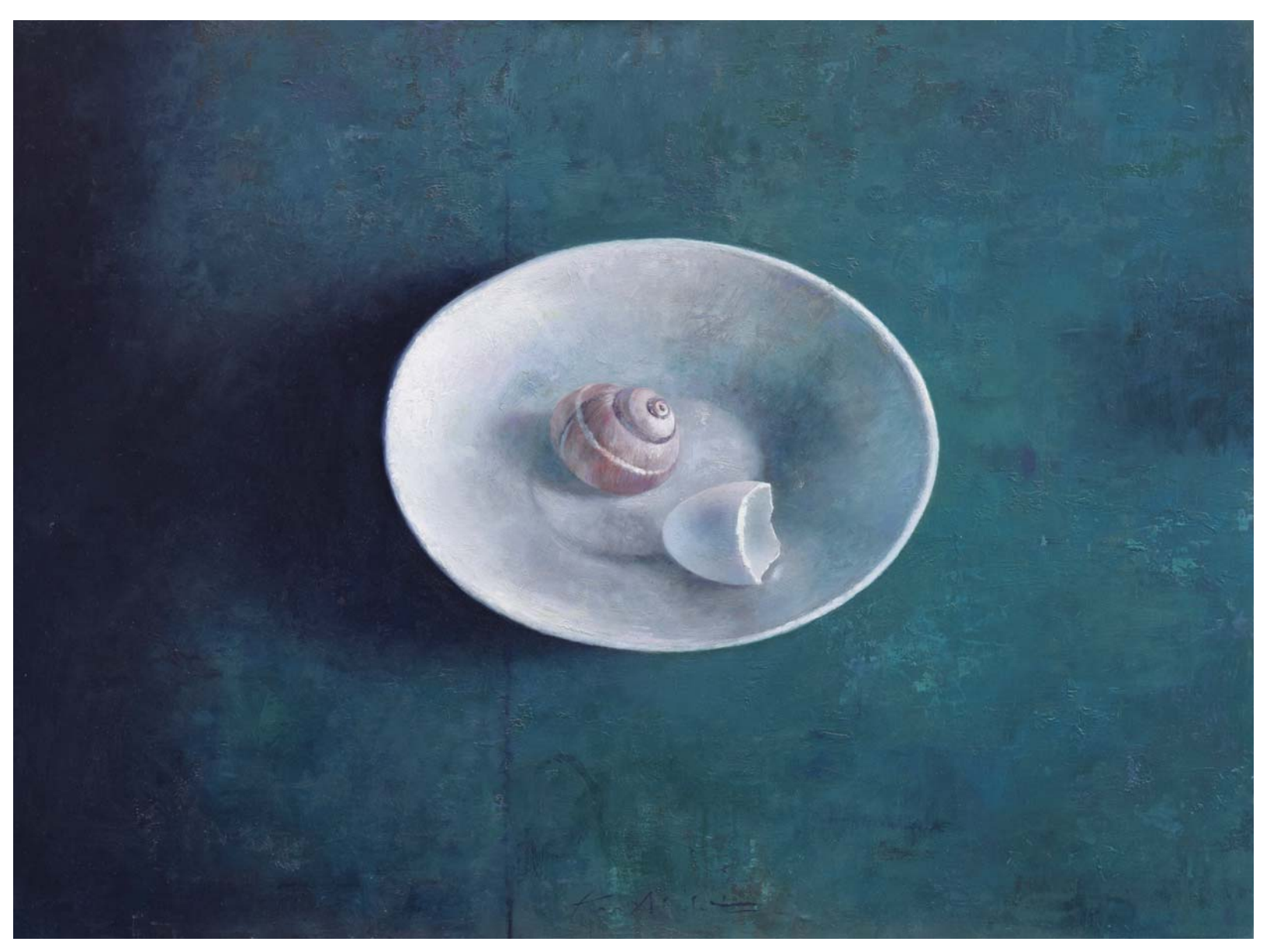
EMERALD 60 X 80 cm