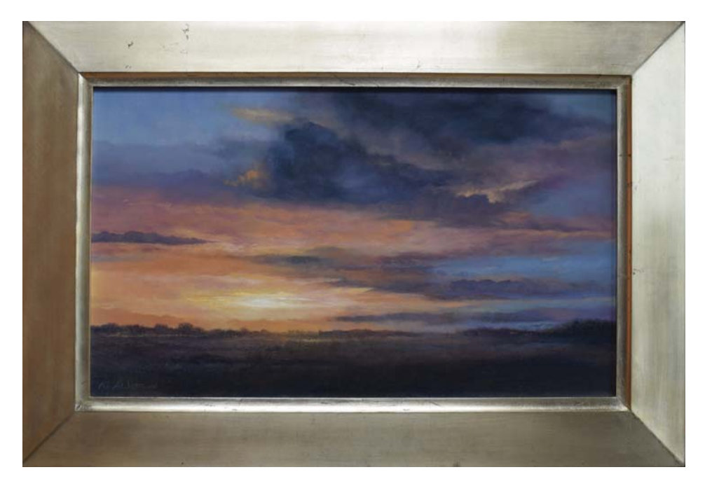
SUMMER EVENING 40 X 65 cm