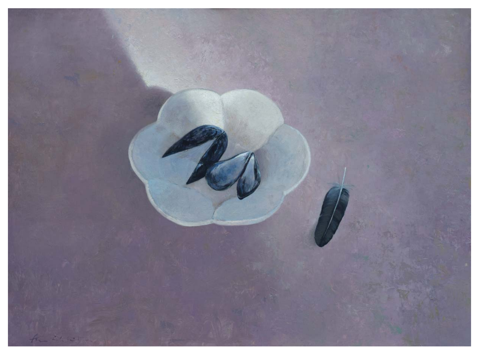
MUSSELS WITH FEATHER 60 X 80 cm