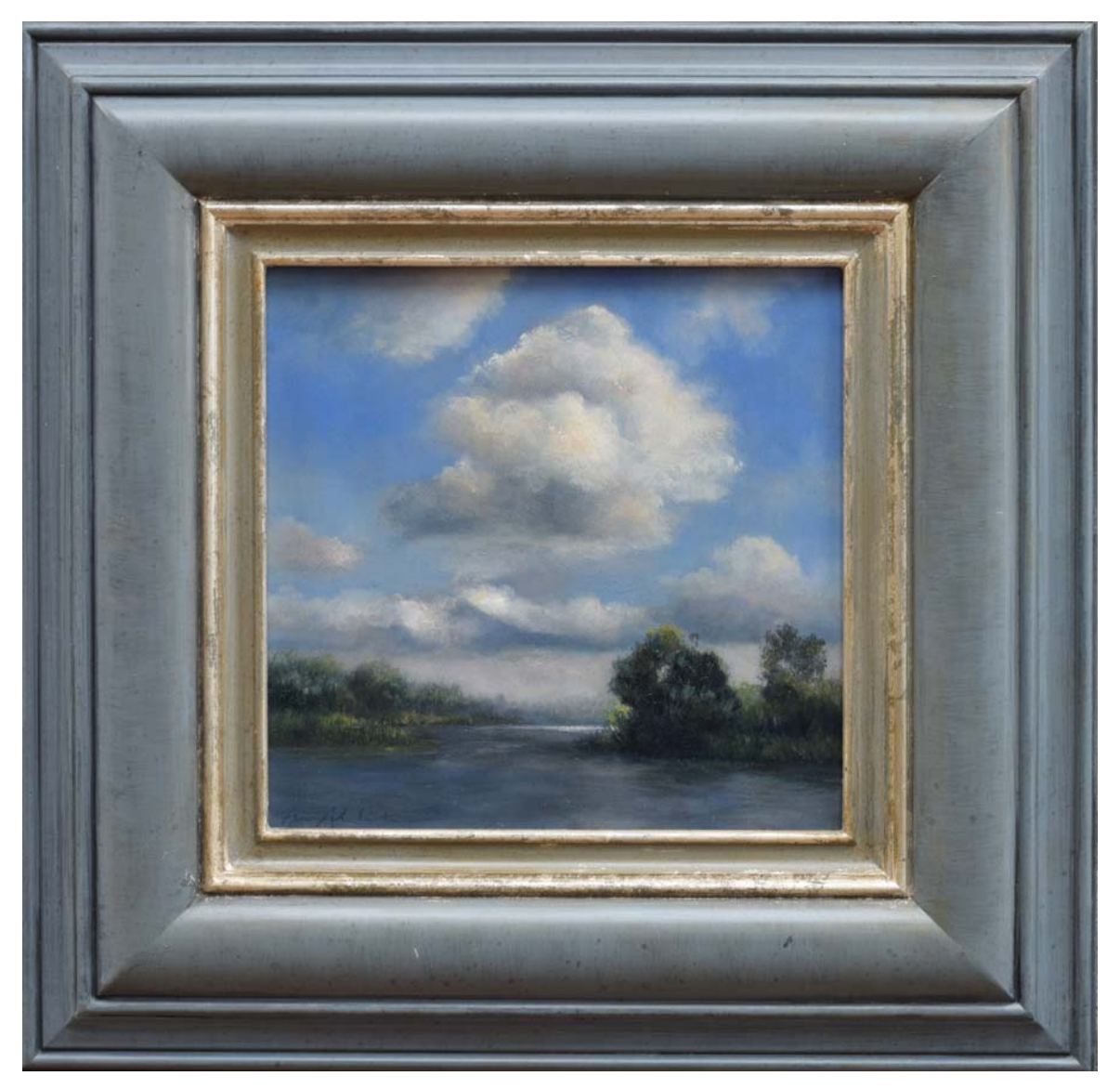
BIESBOSCH HOLLAND 24 X 24 cm