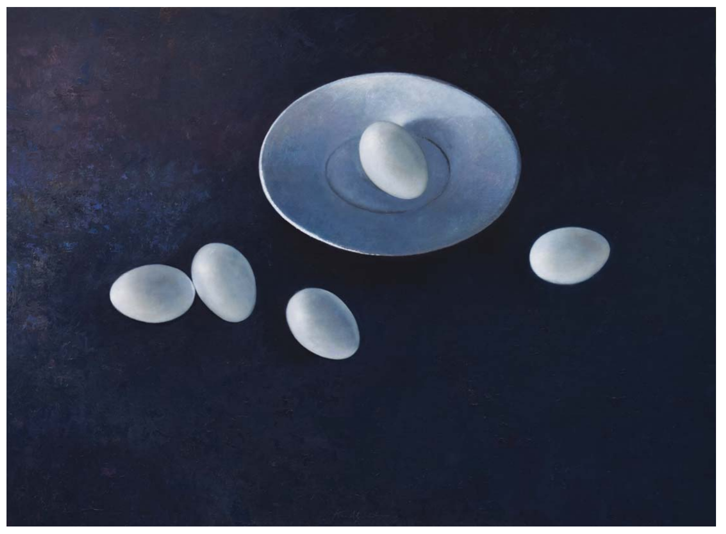
BLACK AND WHITE GRAPHIC 90 X 120 cm