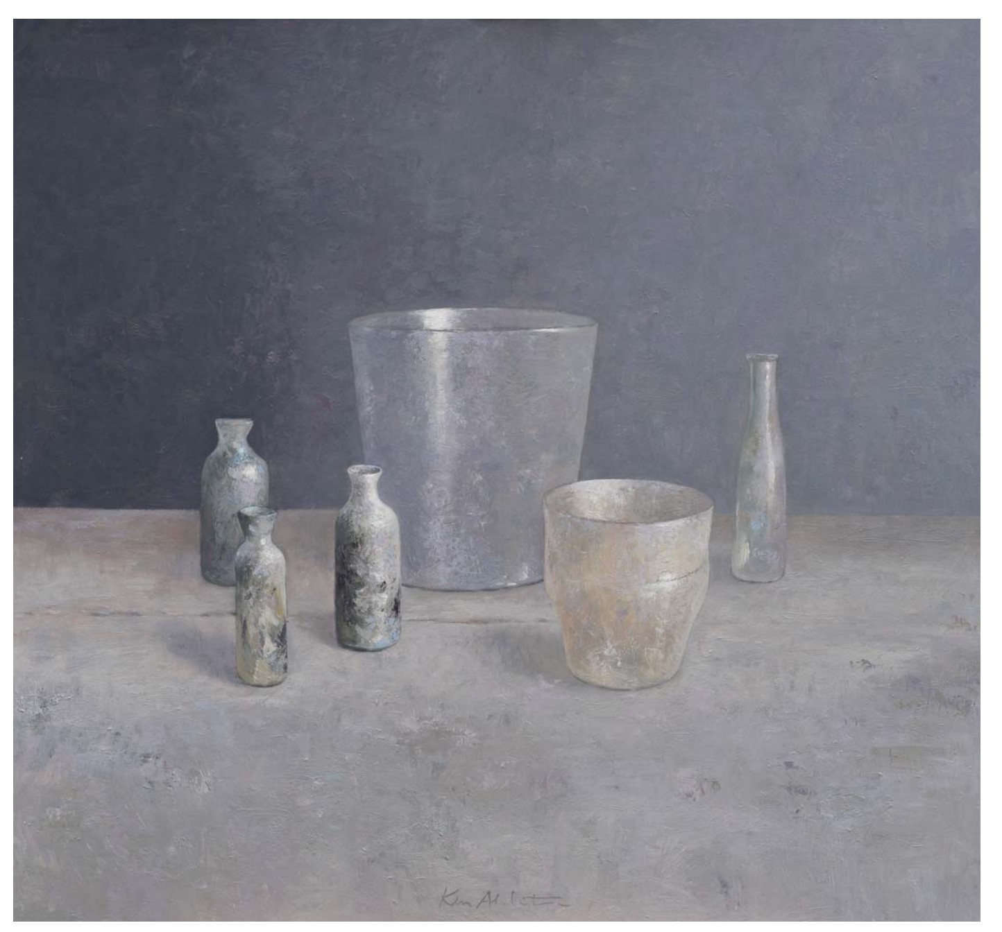
SYRIAN MEDIEVAL AND MODERN GLASS 80 \times 85 \text{ cm}