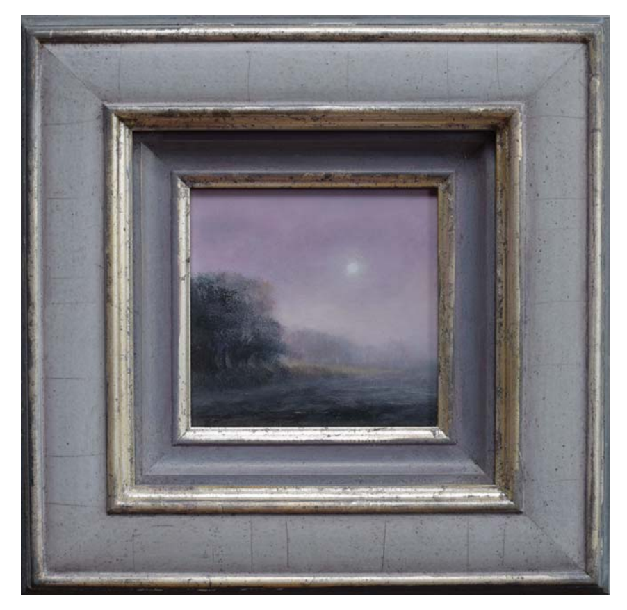
MORNING SUN 12 X 12 cm