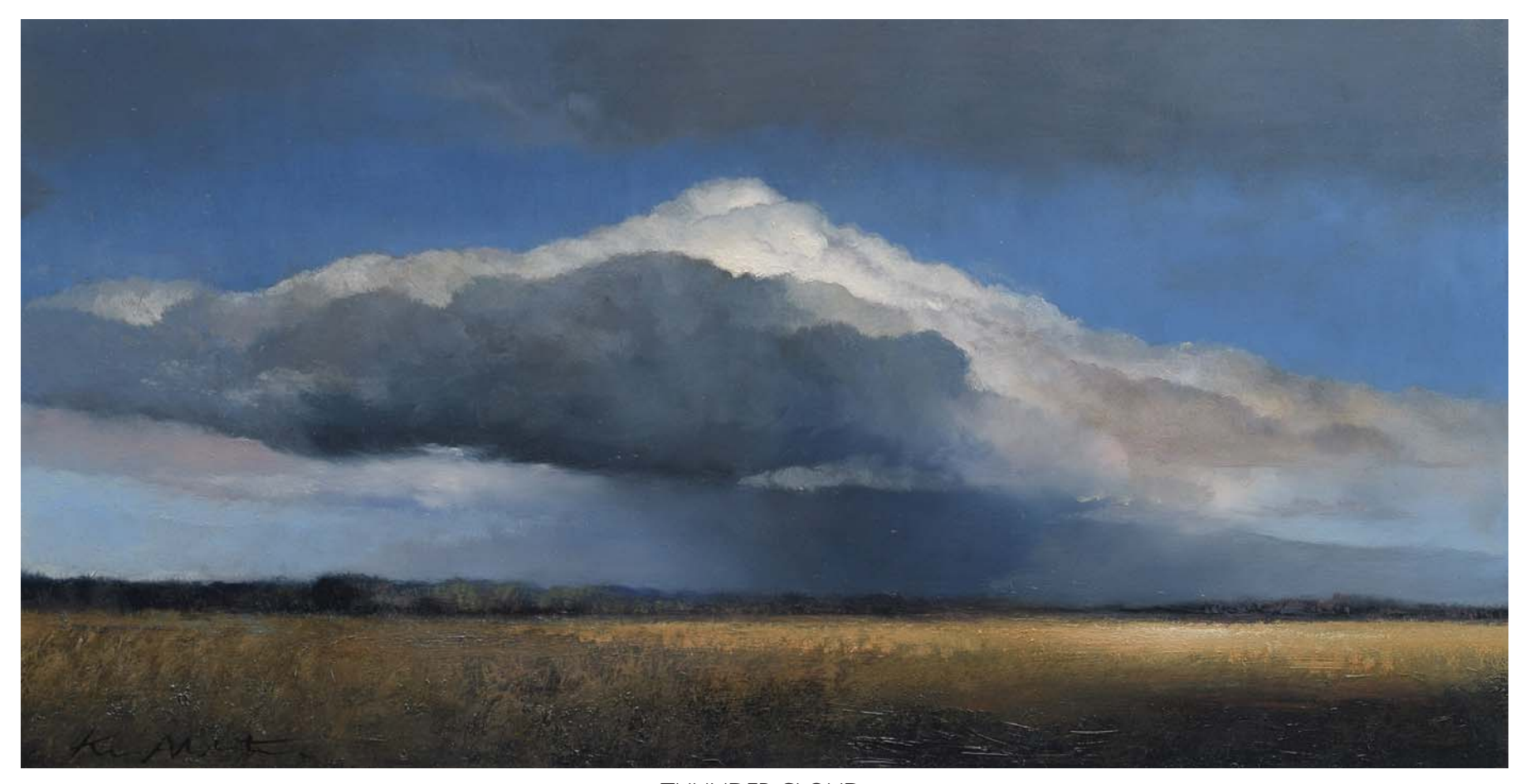
THUNDER CLOUD 21 X 40 cm