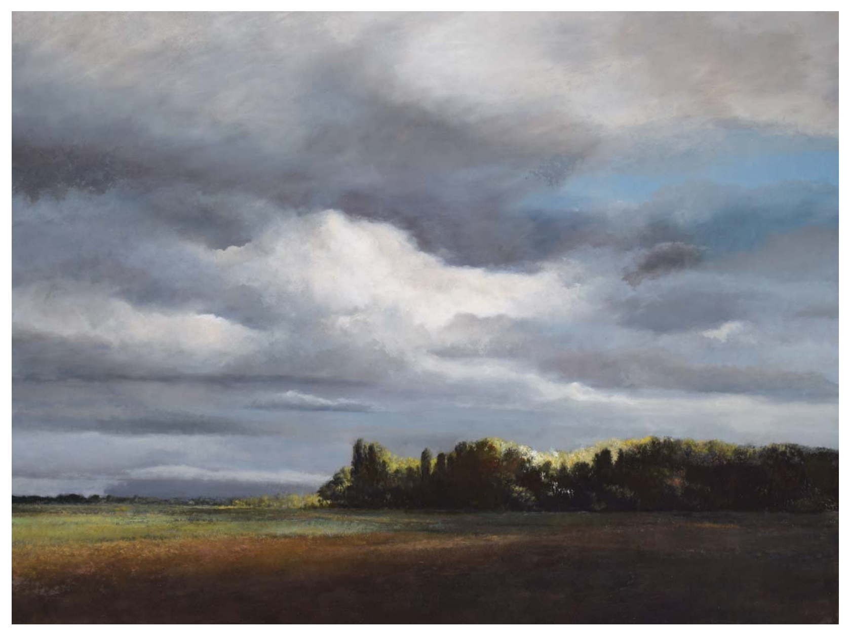
POLDER LANDSCAPE, HOLLAND 92 X 120 cm