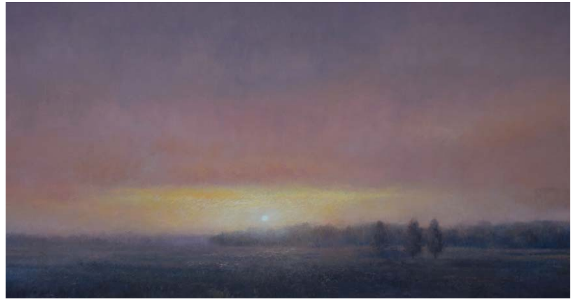
RED MORNING 40 X 70 cm