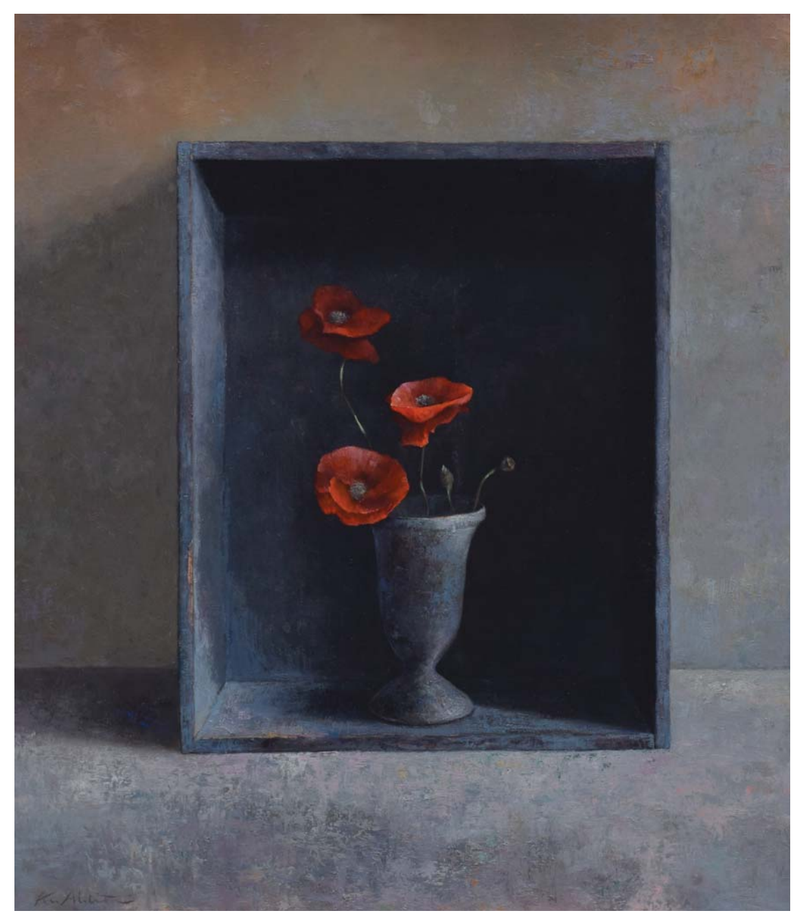
POPPIES 95 X 82 cm