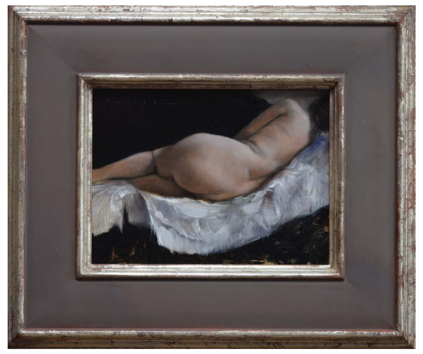
RECLINING NUDE 22 X 35 cm