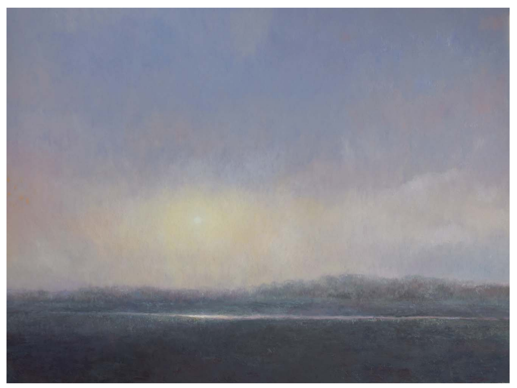
HAZY MORNING, LILAC 92 X 120 cm