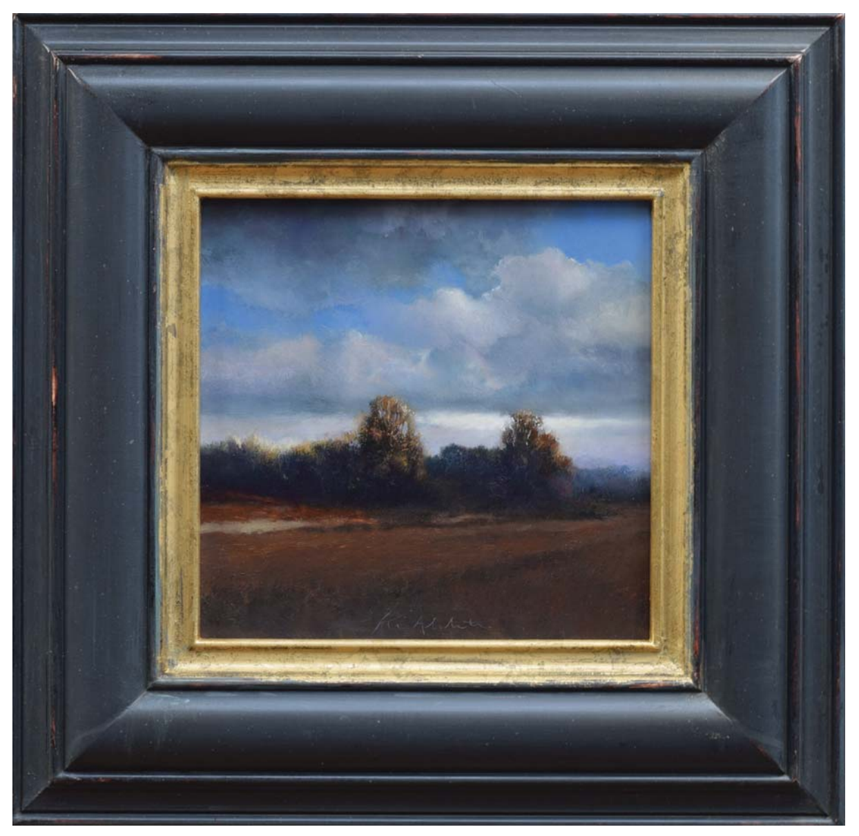
THETWO OAKS 24 X 24 cm