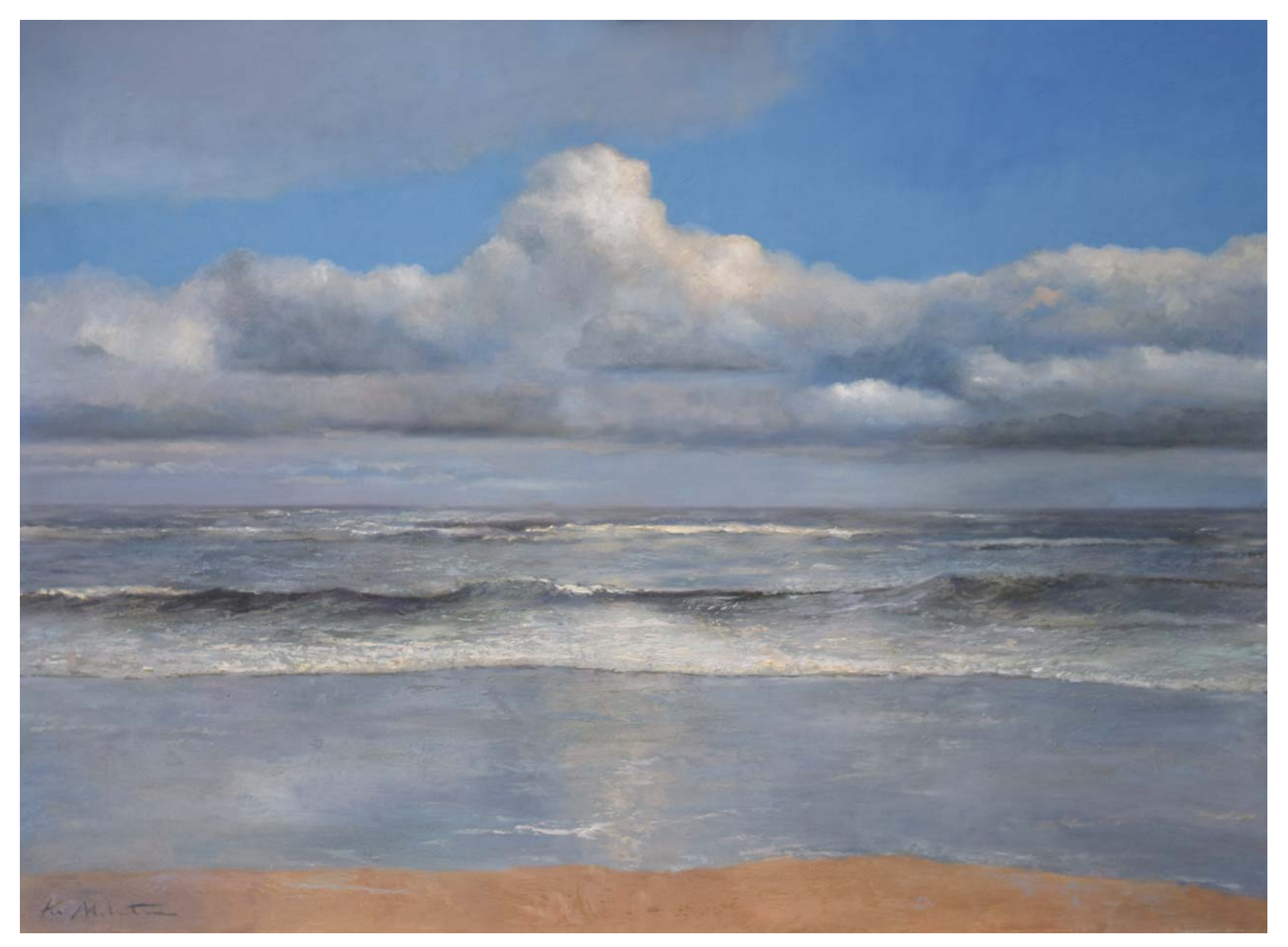
CALM SEA 60 X 80 cm