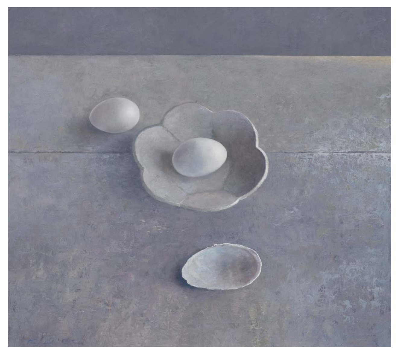
STILL LIFE WITH TWO EGGS 80 X 85 cm