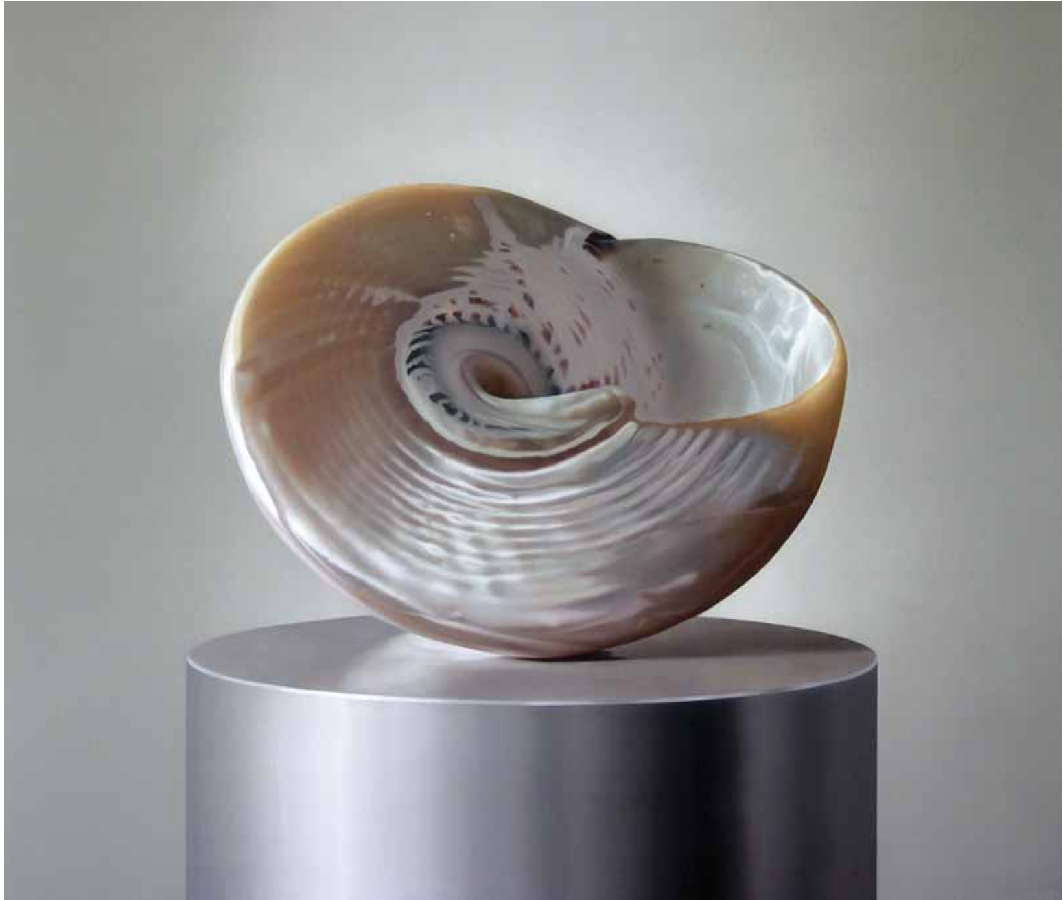
MATRIX 91 X 101 cm