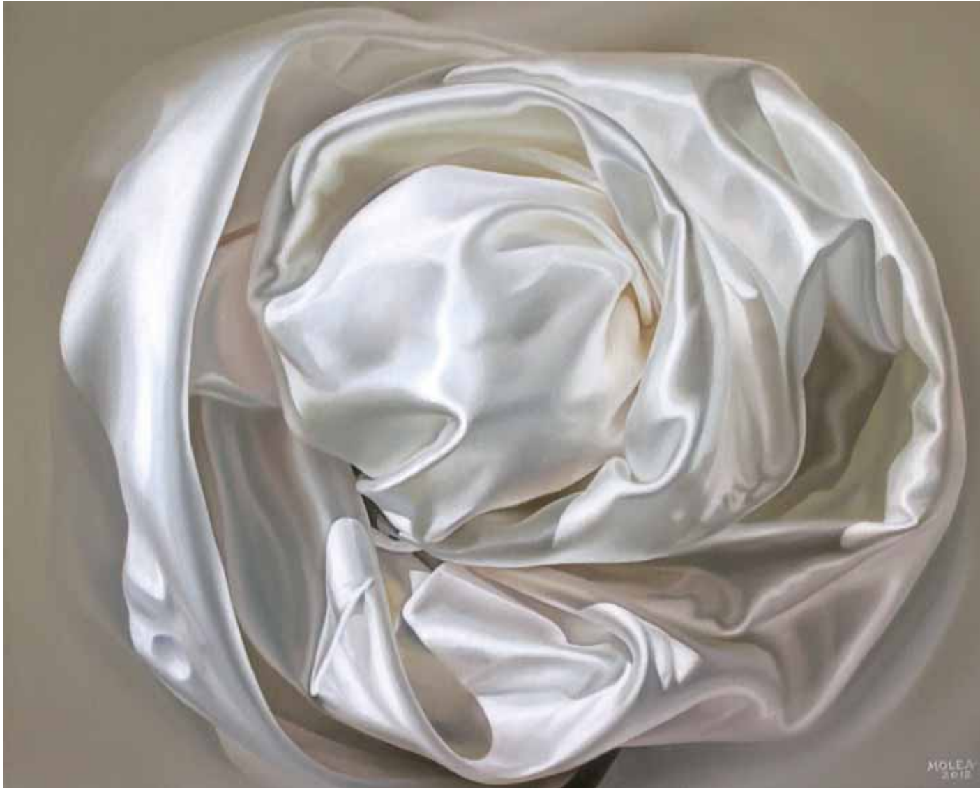
BEGINNING 40 X 50 cm