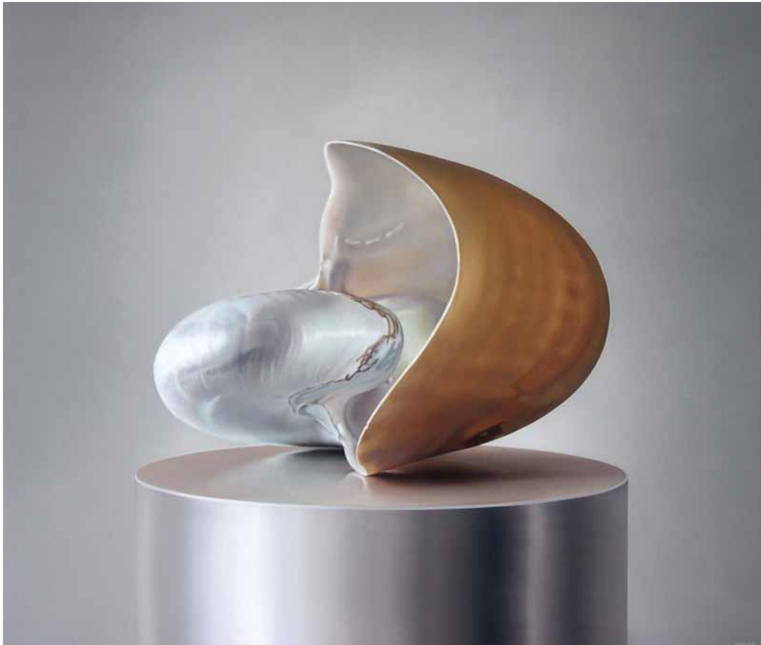
CORNUCOPIA 91 X 101 cm