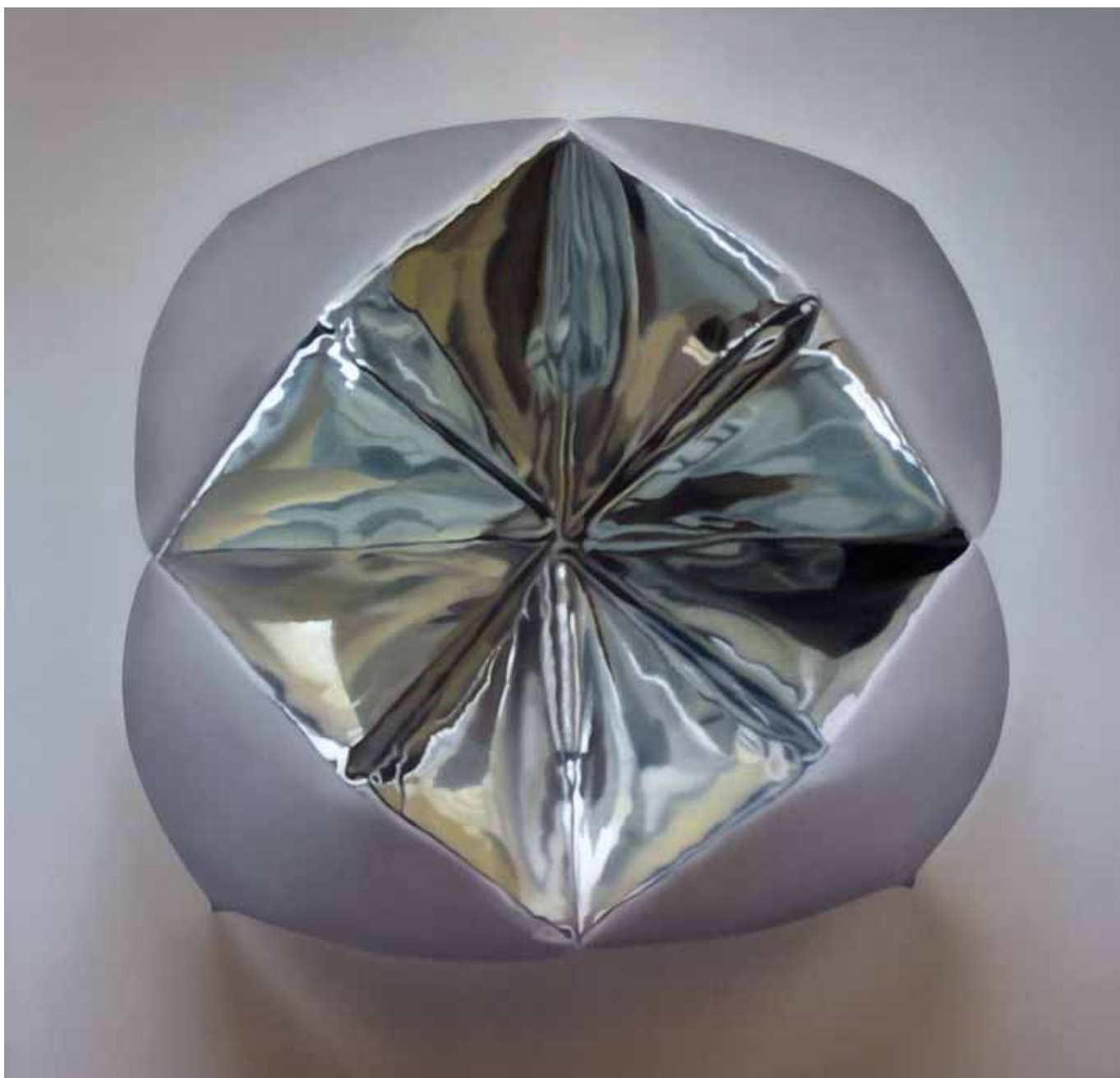
YANG 76 X 76 cm