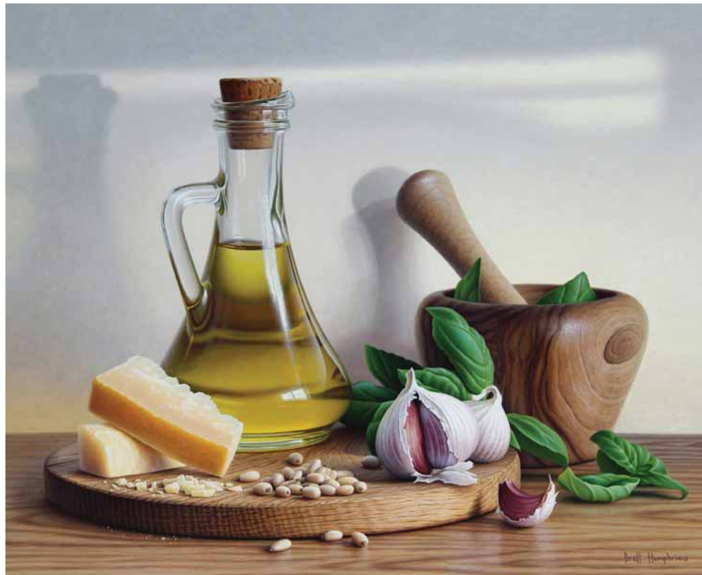
PESTO 27 X 36 cm Acrylic on Board