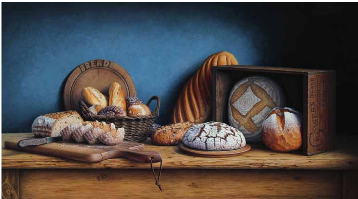
THE ARTISAN BAKER 38 X 70 cm Acrylic on Board

Front Cover: A L'olivier 30 X 27 cm Acrylic on Board