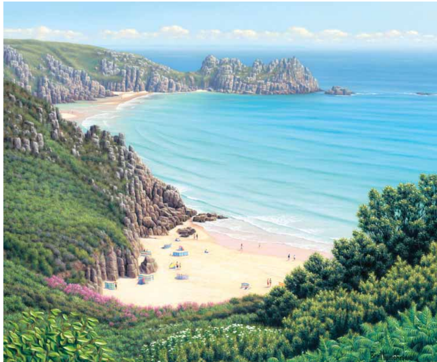
PORTHCURNO 50 X 60 cm Oil on Canvas

Front Cover: A L'olivier 30 X 27 cm Acrylic on Board