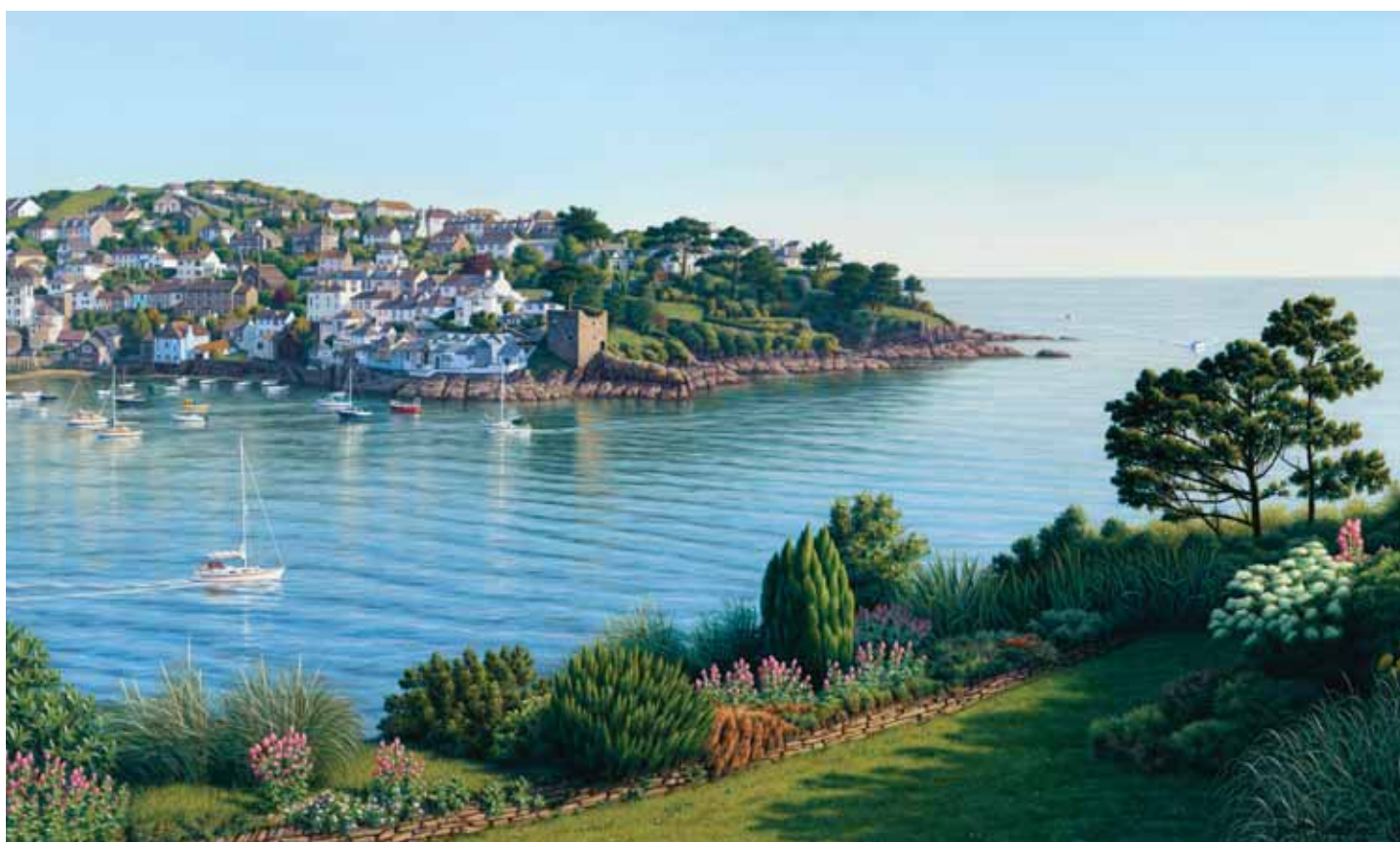
POLRUAN 35 X 60 cm Acrylic on Board