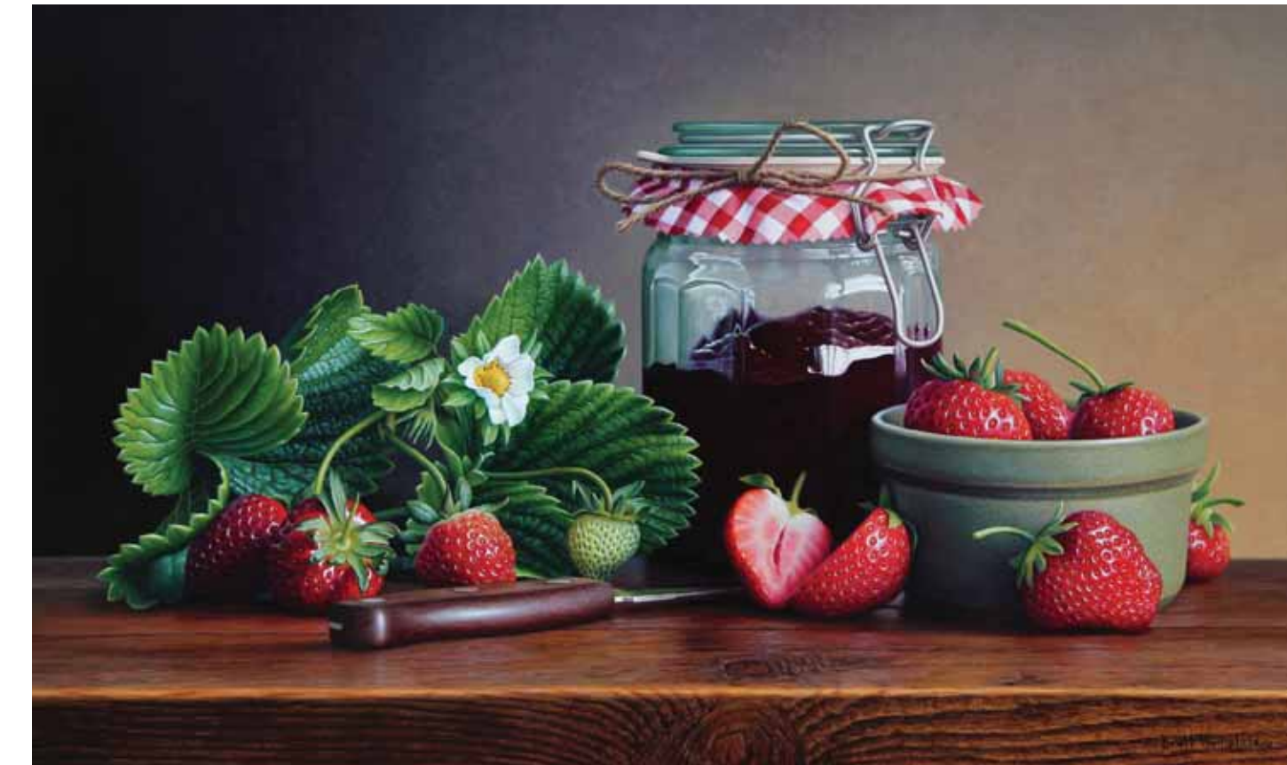
STRAWBERRY PRESERVE 26 X 40 cm Acrylic on Board

His modern approach to still life painting has resulted in some colourful compositions. The interesting subjects he has chosen to paint invite a much closer look at his exquisitely executed paintings.