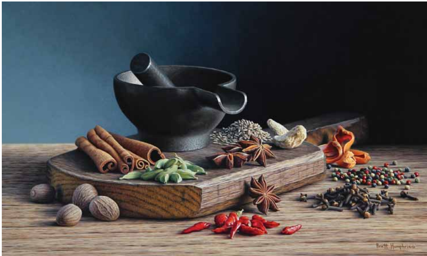
WHOLE SPICES 23 X 38 cm Acrylic on Board