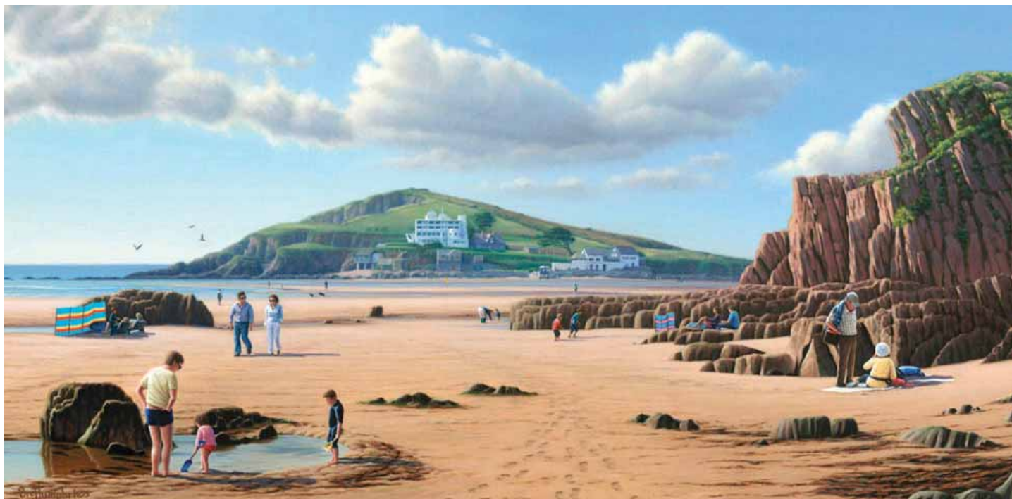
BURGH ISLAND 50 X 100 cm Oil on Canvas