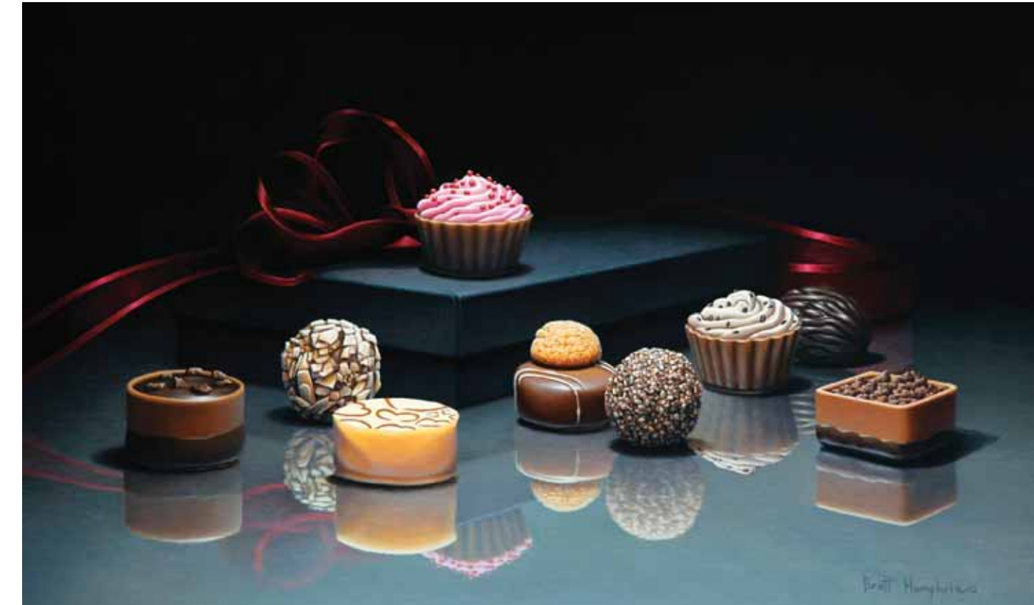
CHOCOLATES 18 X 30 cm Acrylic on Board