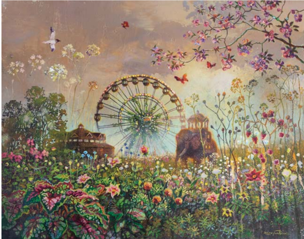
The Elephant Hotel, 73 x 92cm