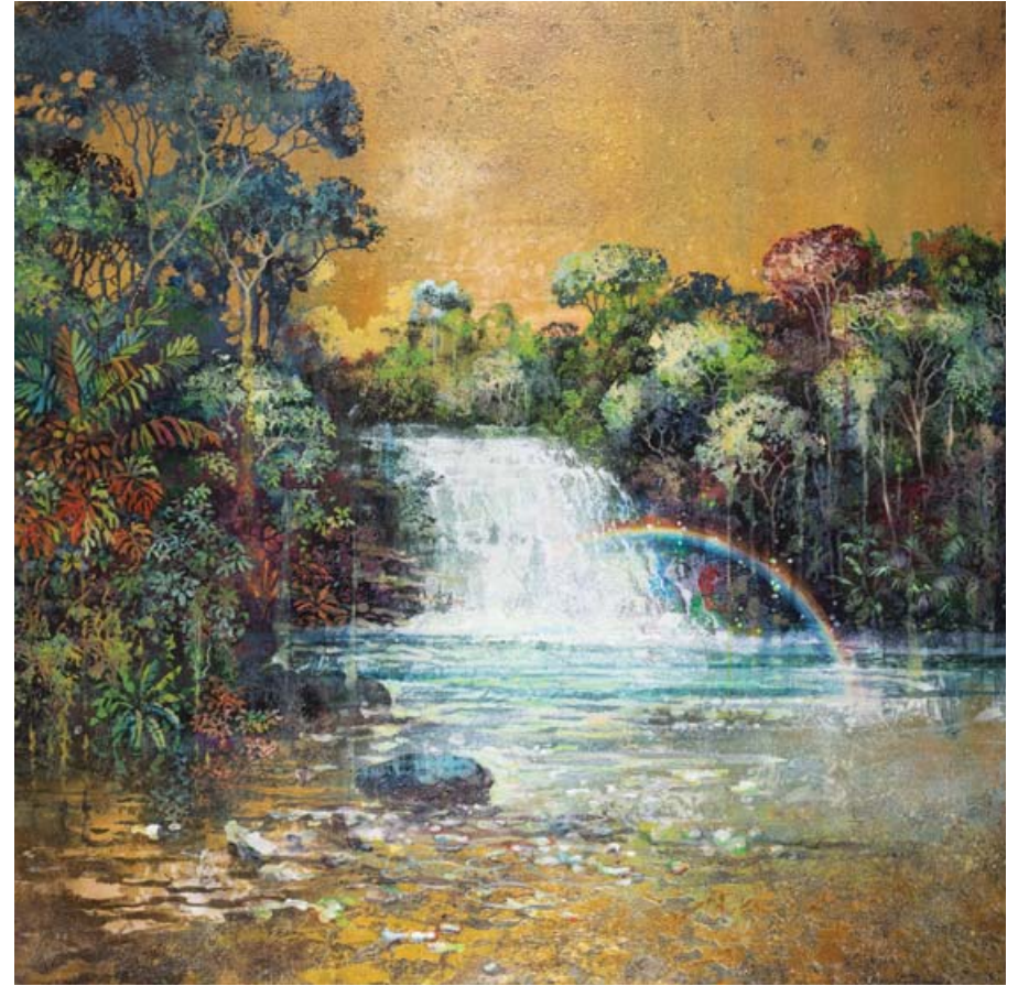
De Sel et d'Or, 100 x 100cm