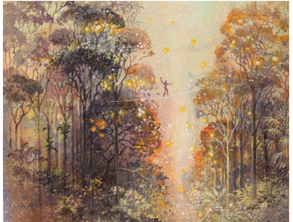
A New Equilibrium, 33 x 41cm,