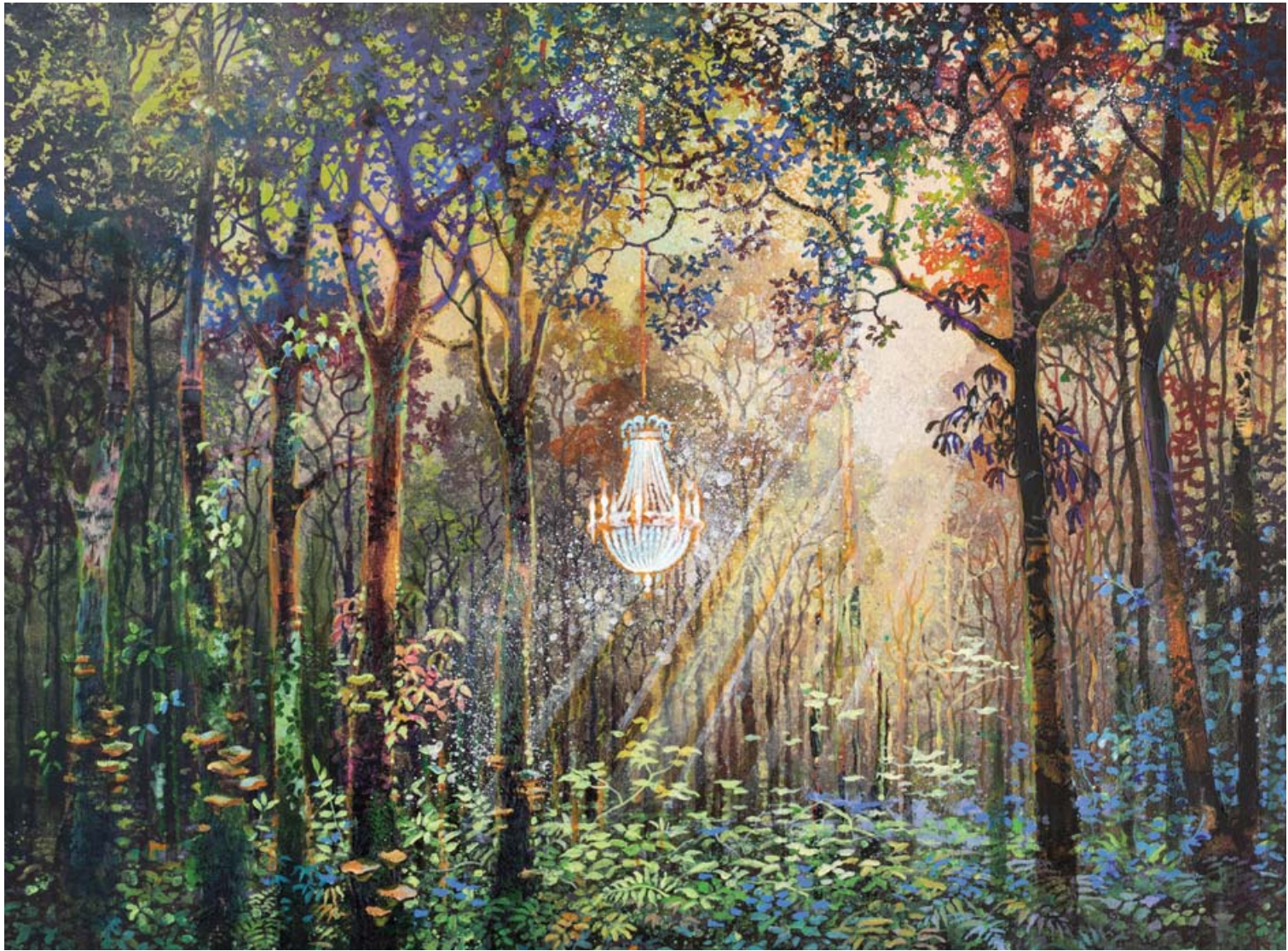
Ball Opening, 73 x 92cm