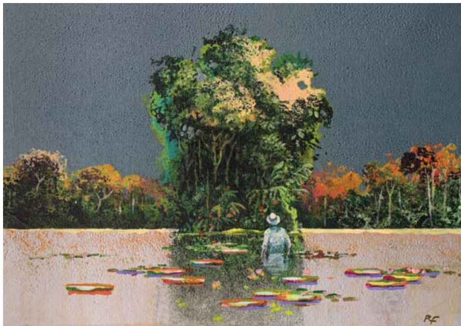
Mermaid's Song, 27 x 35cm