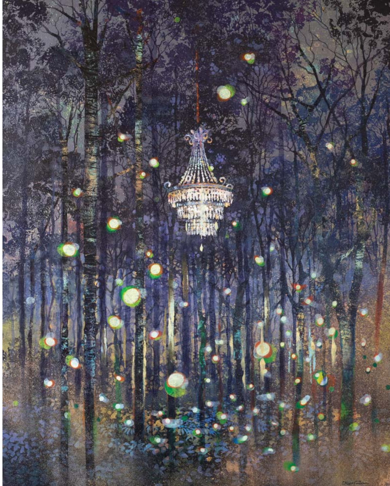
The Ball, 146 x 114cm