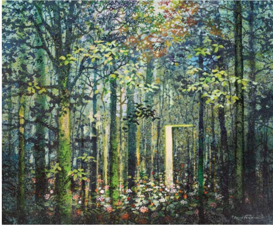
Behind the Forest, 54 x 65cm