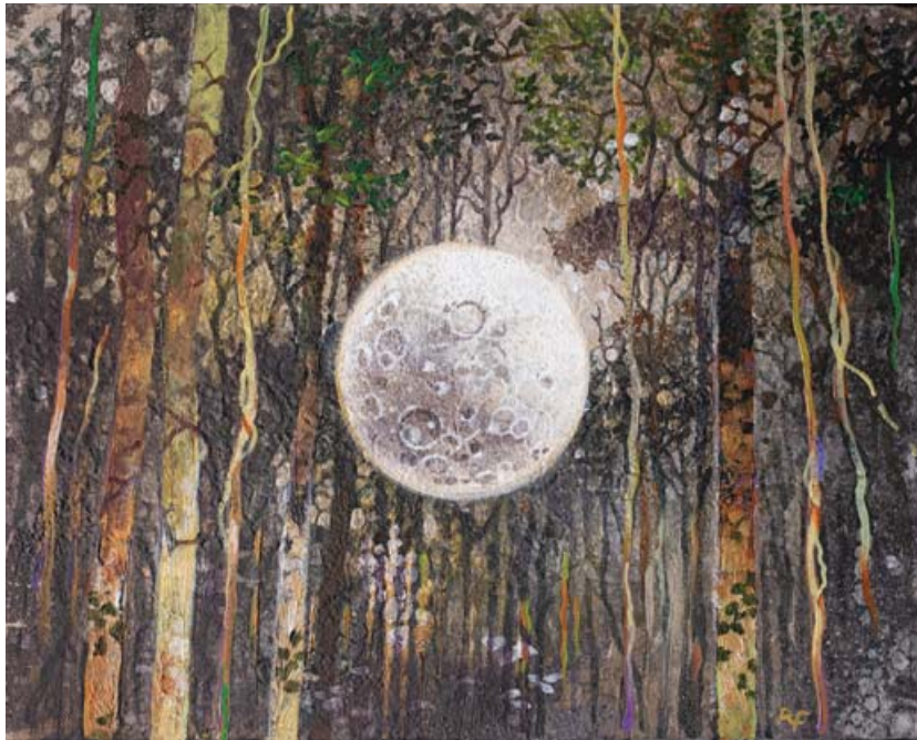
Moon Walk, 27 x 35cm