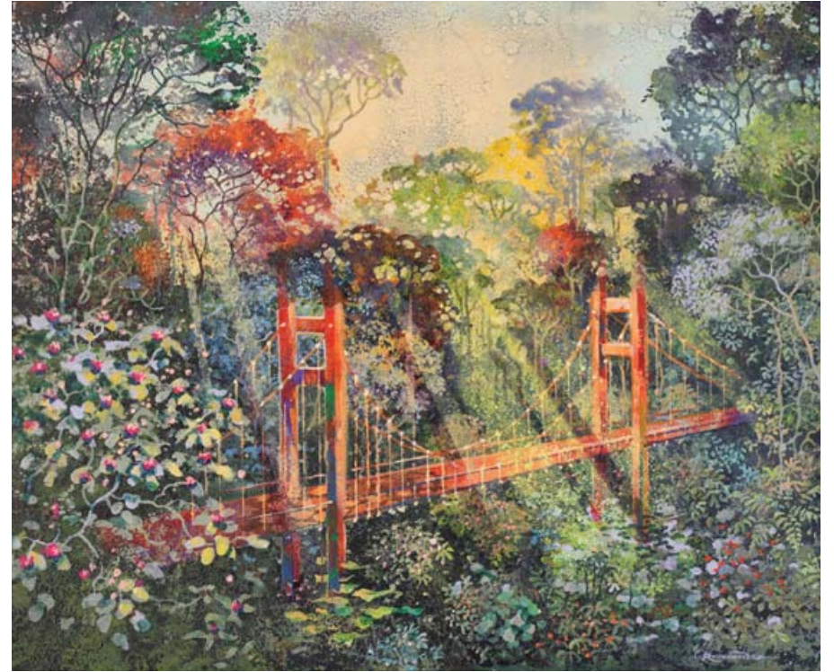
Future Interior, 54 x 65cm