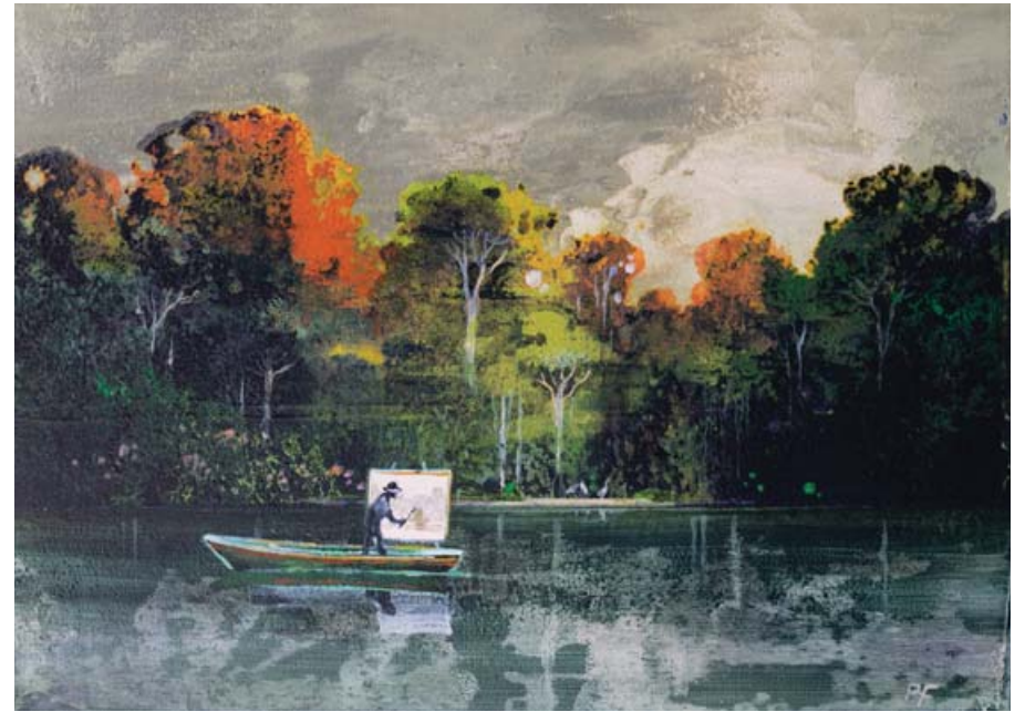
P. Gauguin, 27 x 35cm