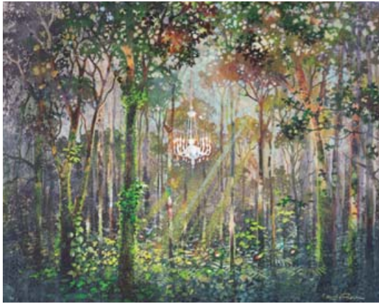
Dance Hall, 54 x 65cm