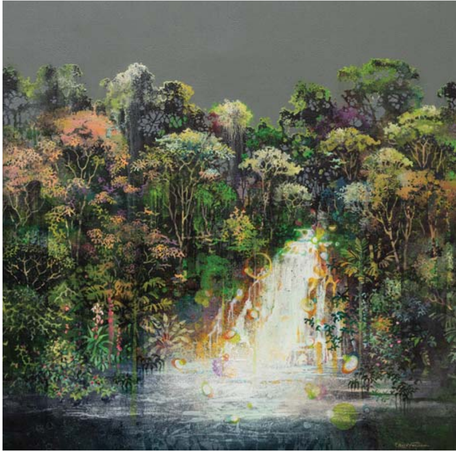
In Praise of Other Legends, 100 x 100cm