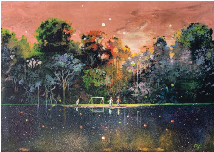
World Cup, 27 x 35cm