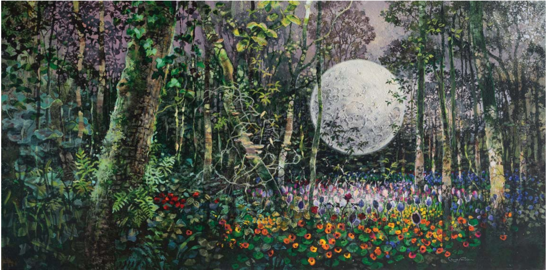
Against all Odds, 96 x 195cm