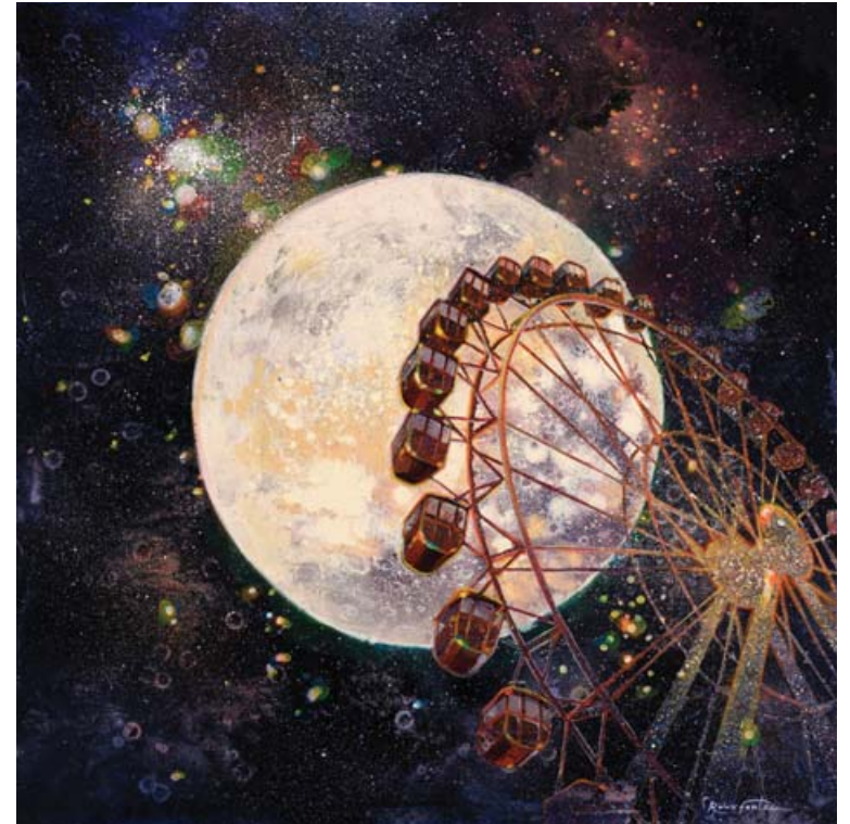
Cosmology, 60 x 60cm