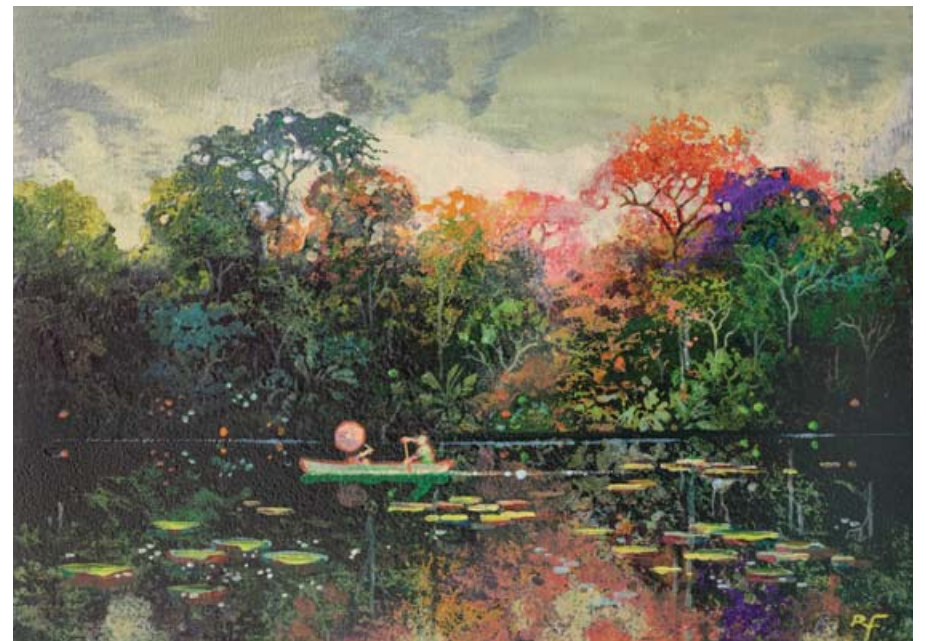
Cabin Fever, 27 x 35cm