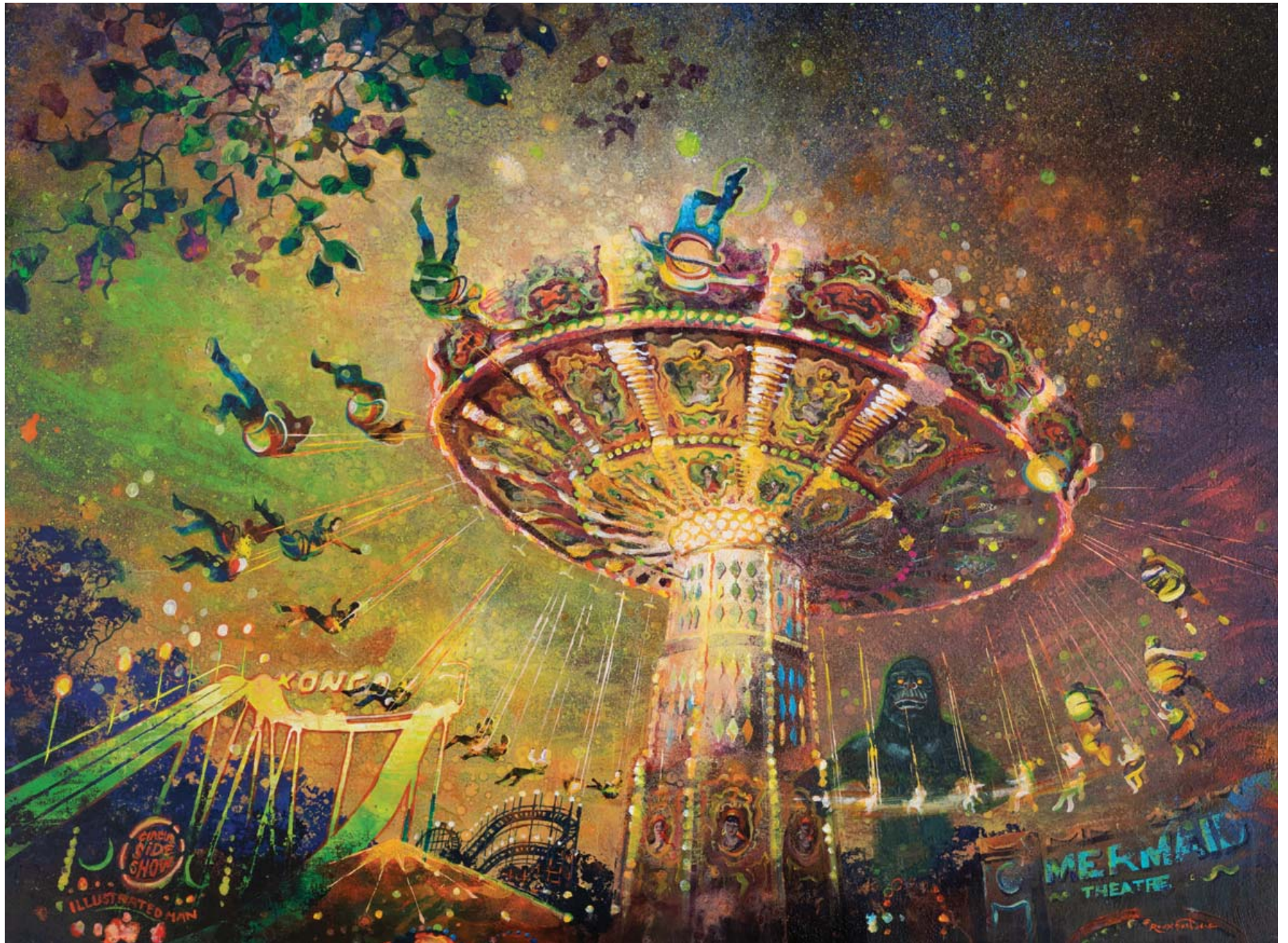
Will 'o' the Wisp, 97 x 130cm