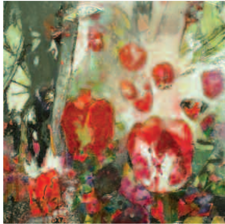
THE SOUND OF TEARS 30 x 30cm Mixed Media on Canvas