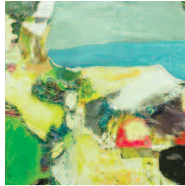
SEASIDE DAYDREAM 30 x 30cm Mixed Media on Canvas