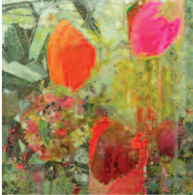
SETTING SUNS 100 x 100cm Mixed Media on Canvas