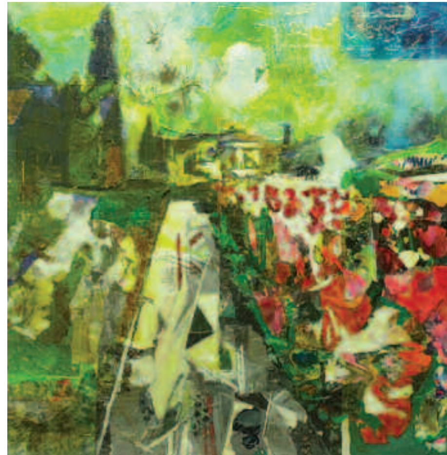
ERIC SATIE GARDENS 100 x 100cm Mixed Media on Canvas