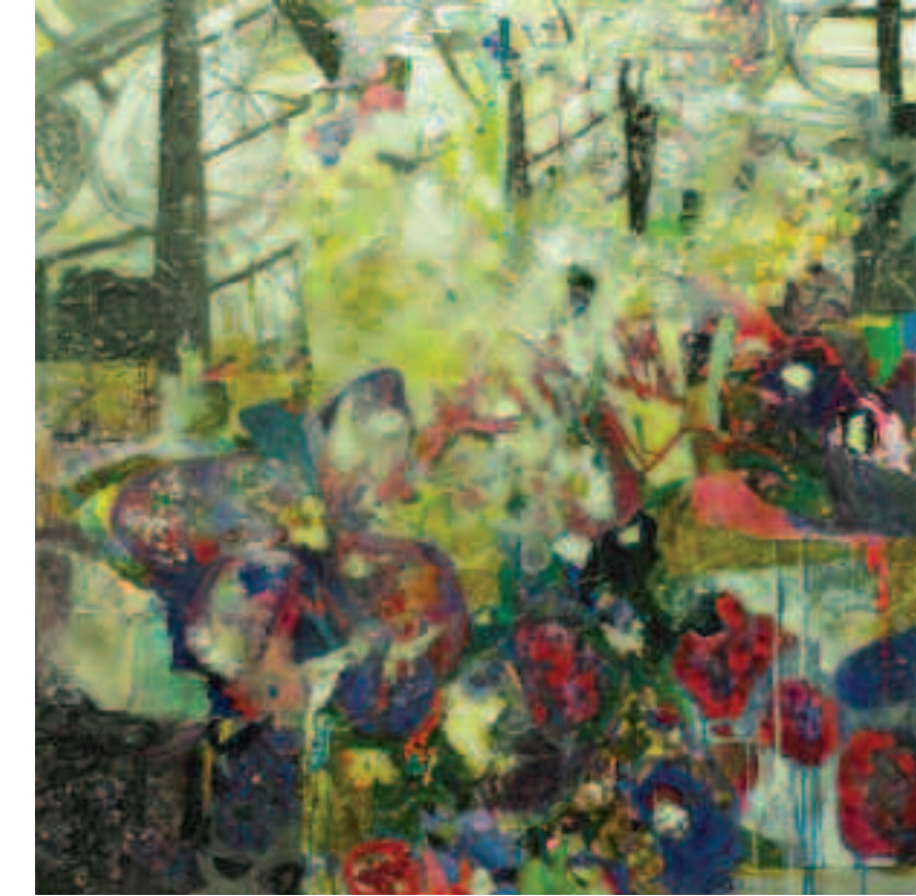
JEMIMA BLOOMS 100 x 100cm Mixed Media on Canvas