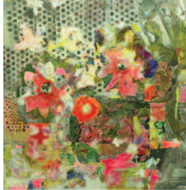
THE FORTNIGHT AFTER VALENTINE'S DAY 100 x 100cm Mixed Media on Canvas

Front Cover: Metropolis Curve 166 x 166cm Mixed Media on Canvas