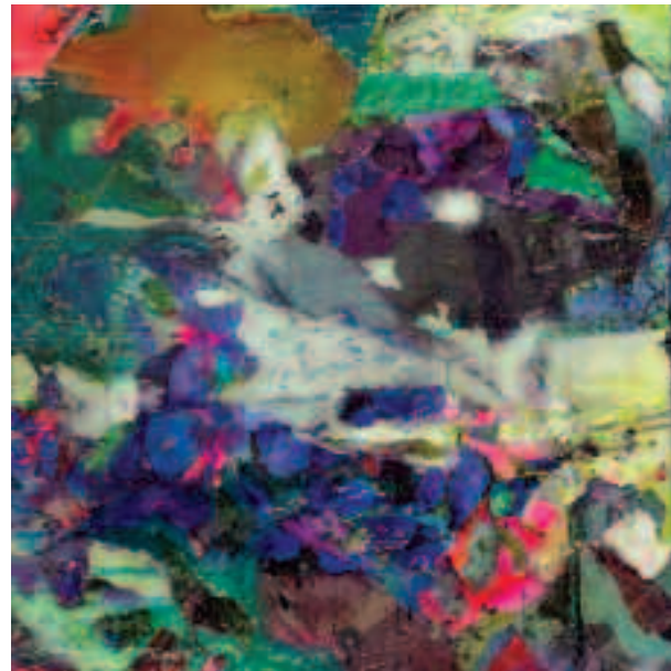
SWEET SCENTED TERRAIN 30 x 30cm Mixed Media on Canvas