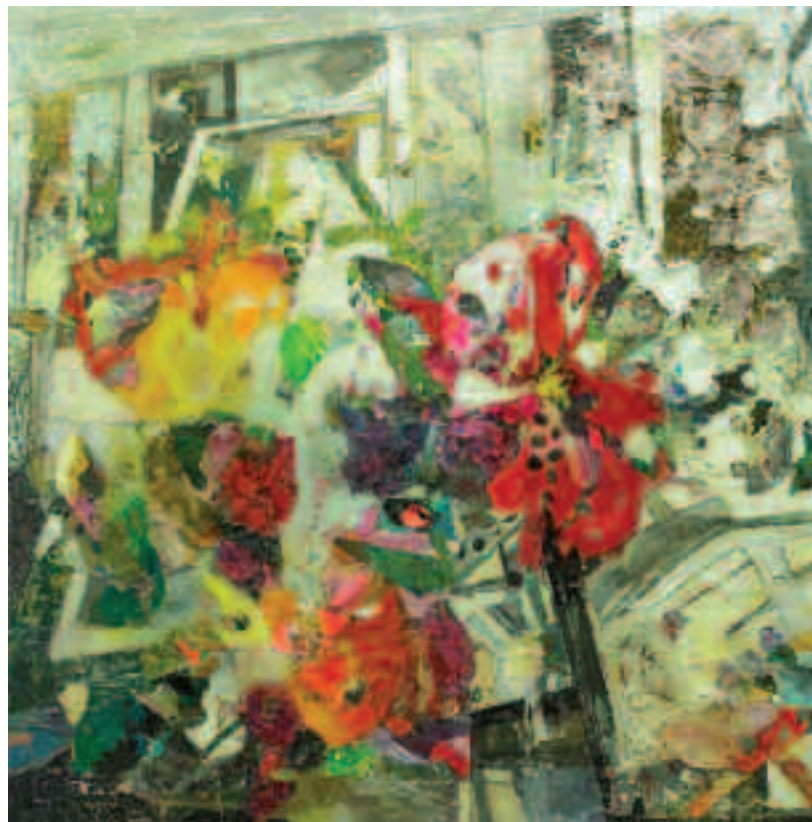
OPTICAL WAVELENGTHS 100 x 100cm Mixed Media on Canvas

Front Cover: Metropolis Curve 166 x 166cm Mixed Media on Canvas