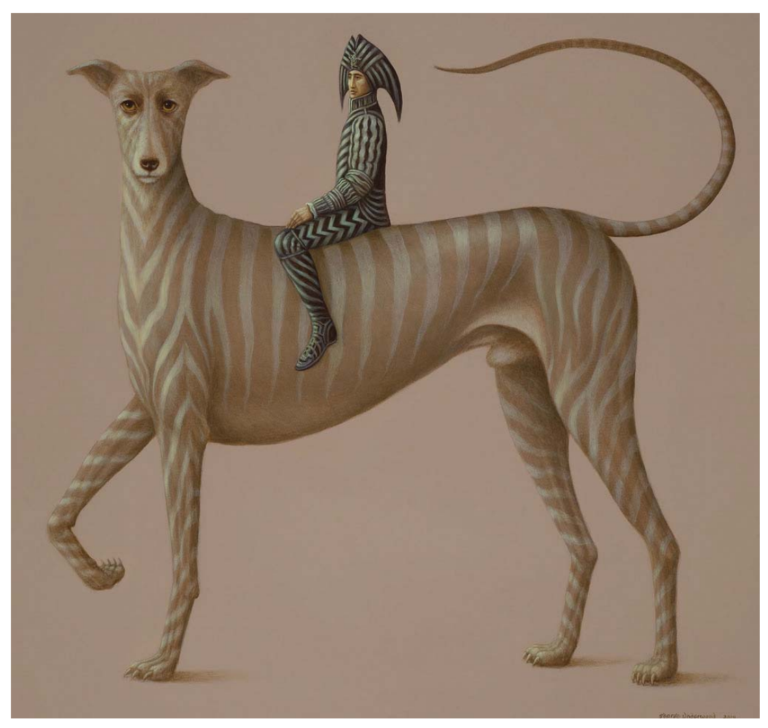
Going Out, 95 x 100cm