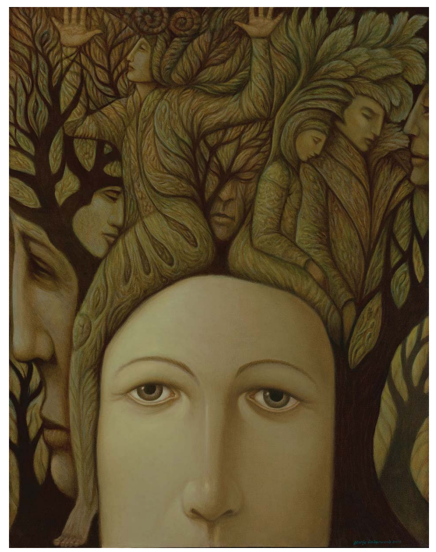
All the World is Green, 92 x 117cm