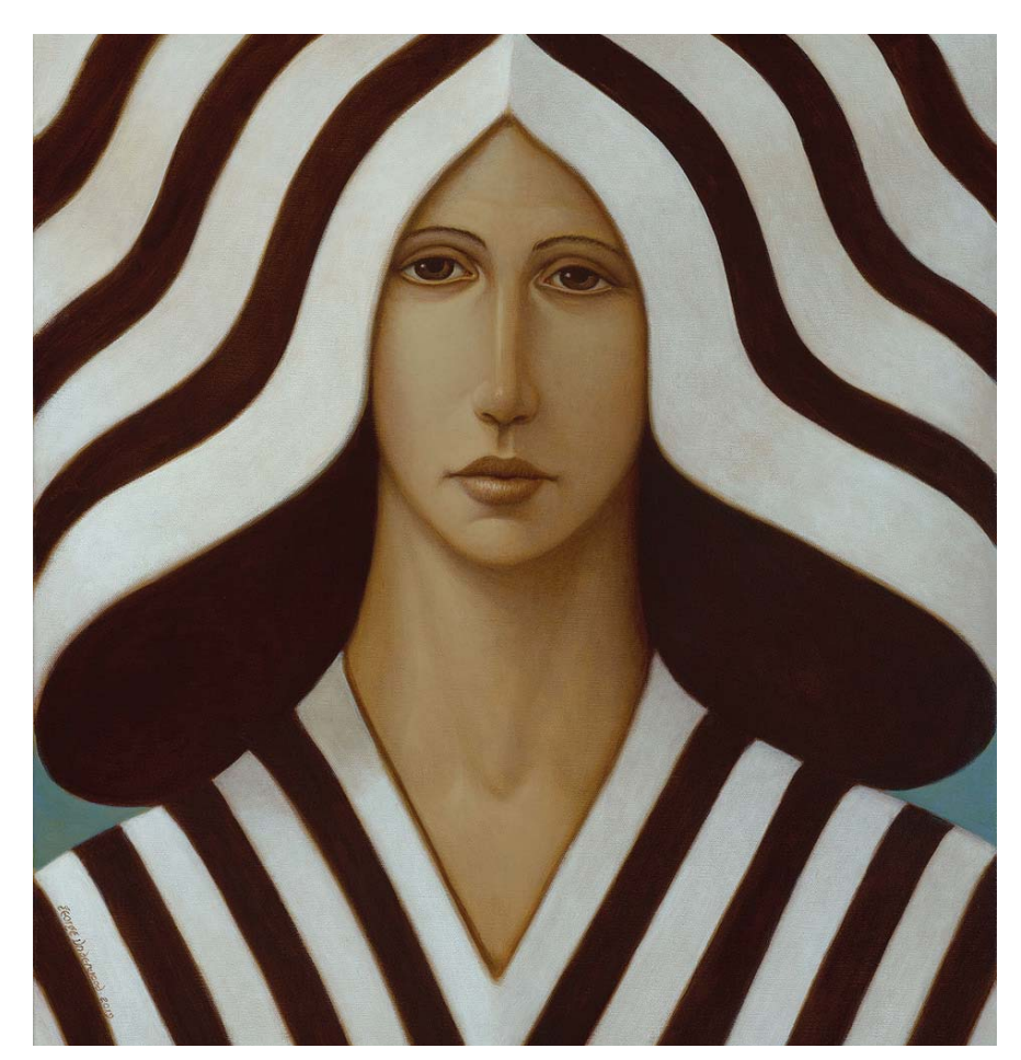
In Stripes, 66 x 61cm