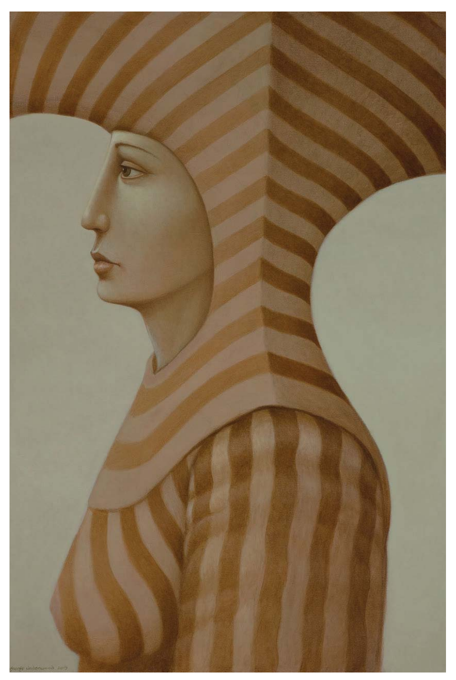
Prime, 122 x 81cm