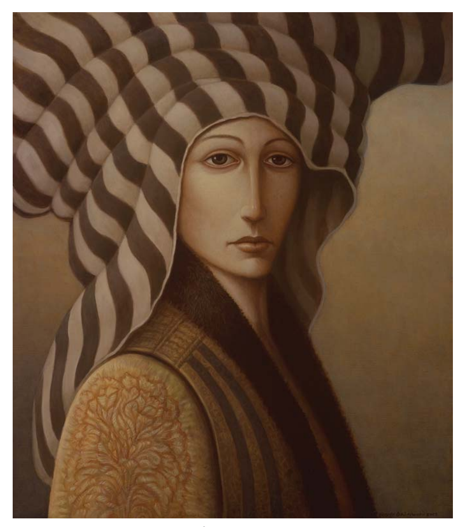
Chieftain, 76 x 66cm