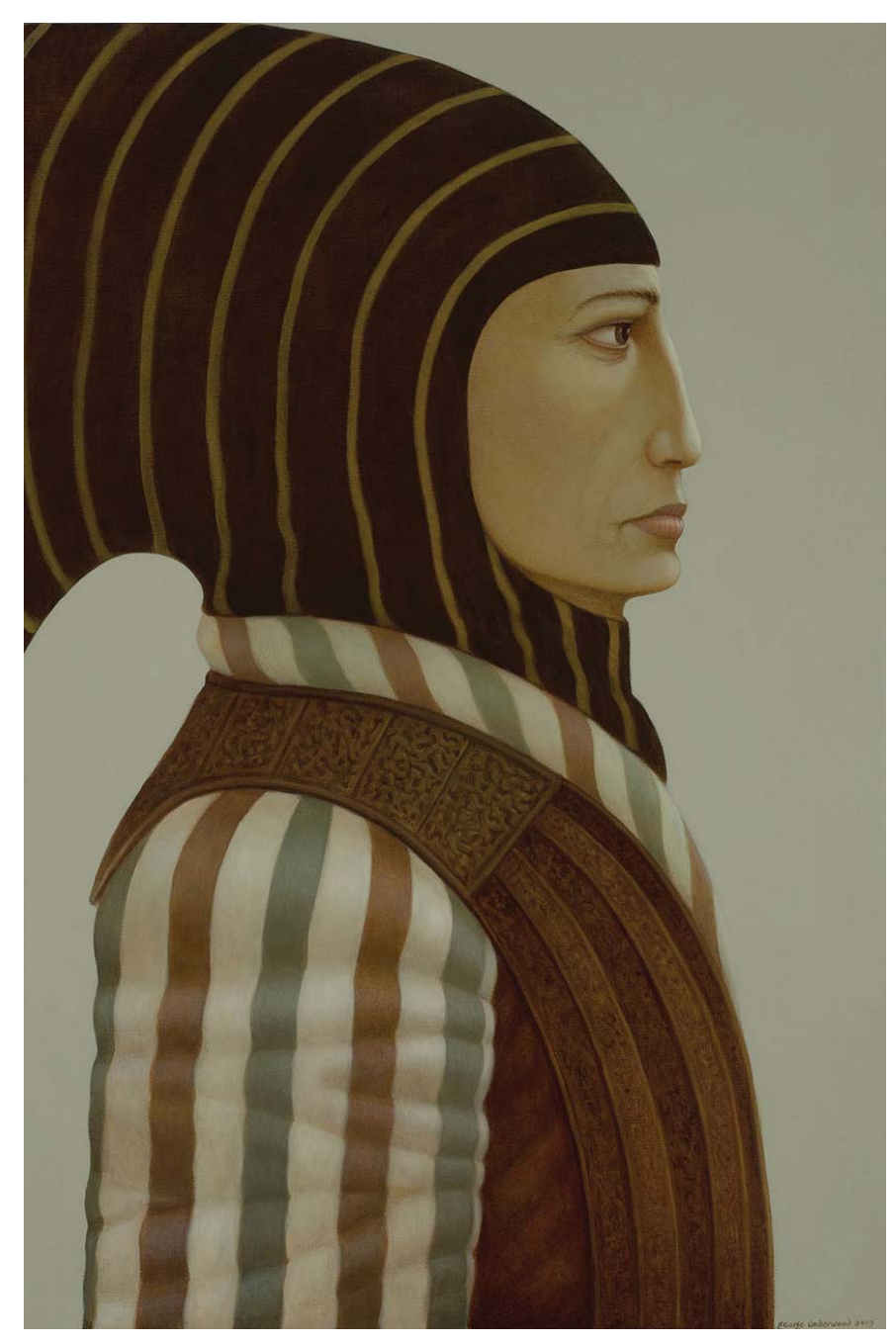
Noble, 122 x 81cm