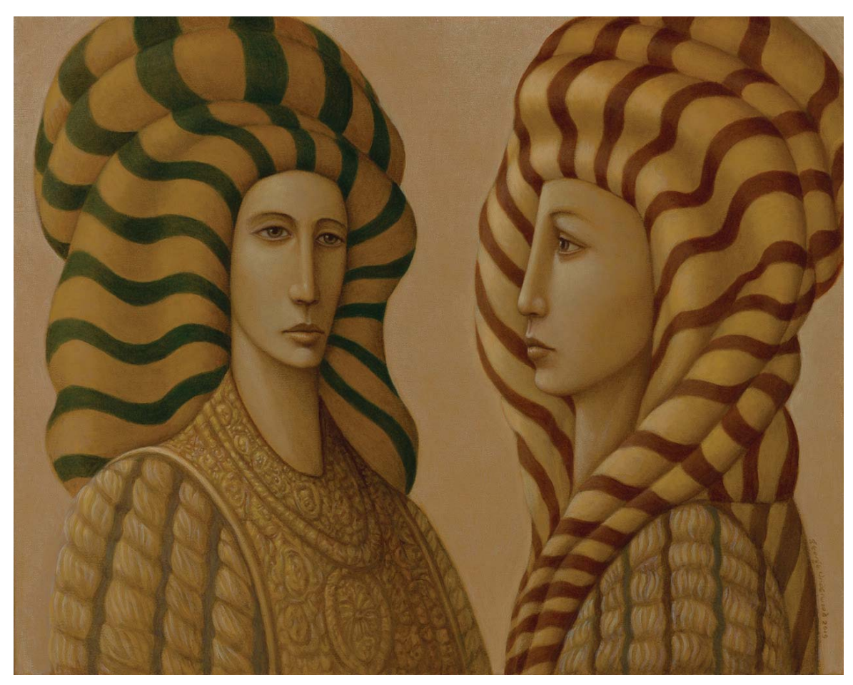
Go with the Flow, 61 \times 76 \text{cm}