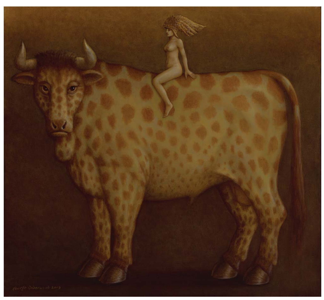
Bully for You, 61 x 66cm