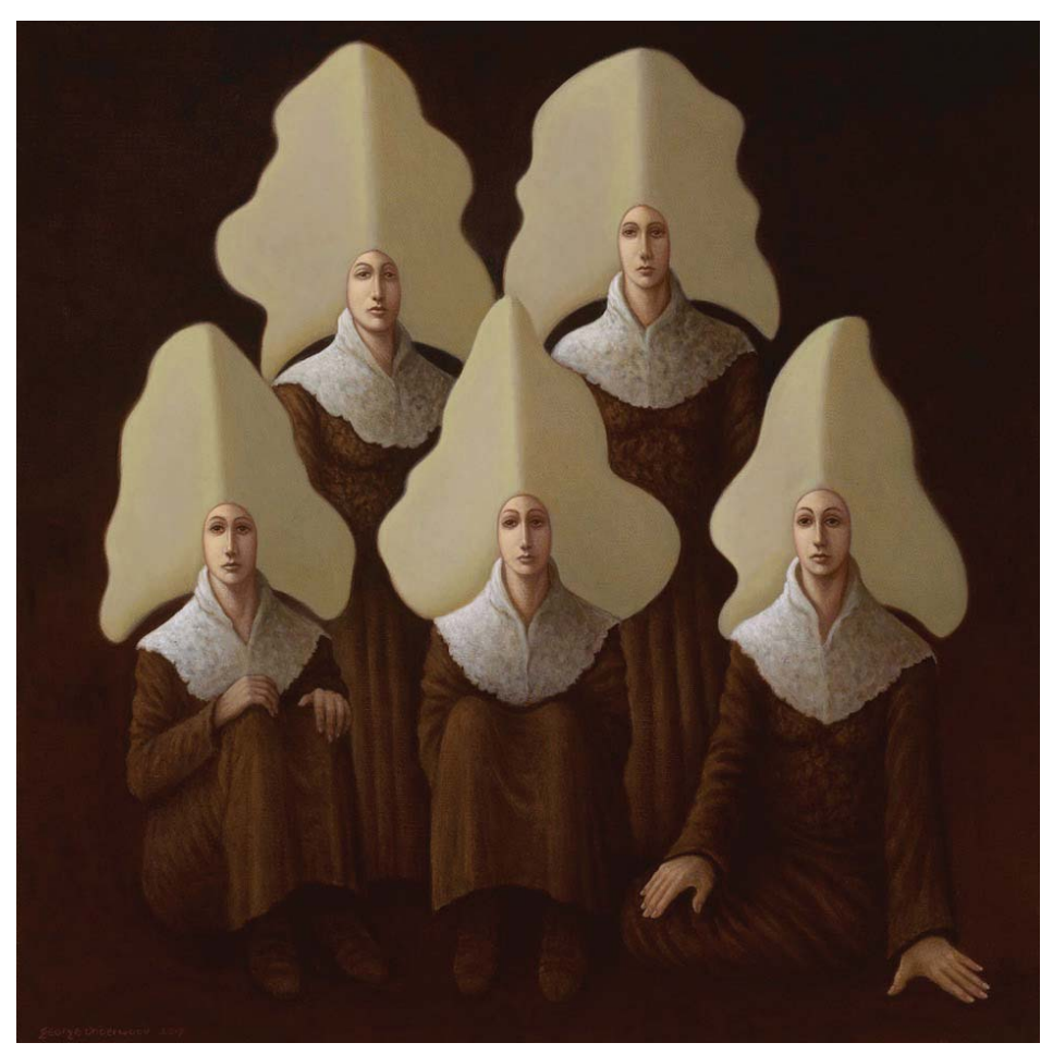
The Ensemble, 70 x 70cm