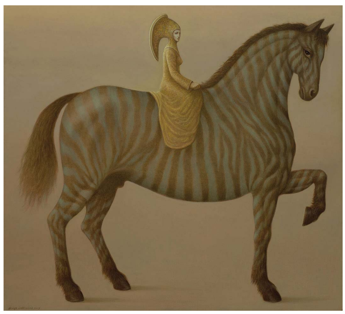
The Lady Rides, 97 x 107cm