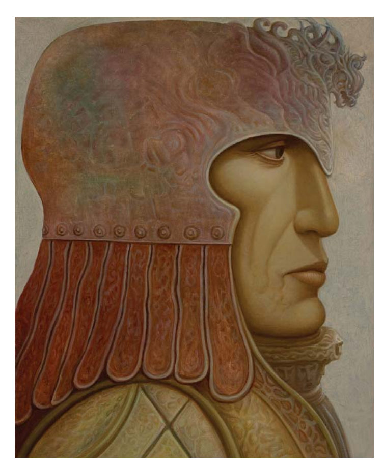
Warrior 7, 89 x 115cm