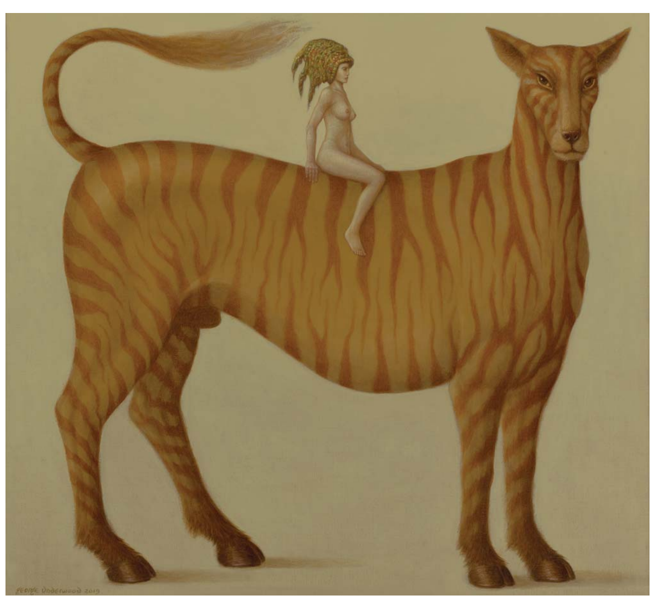
Hybrid Ride, 61 x 66cm