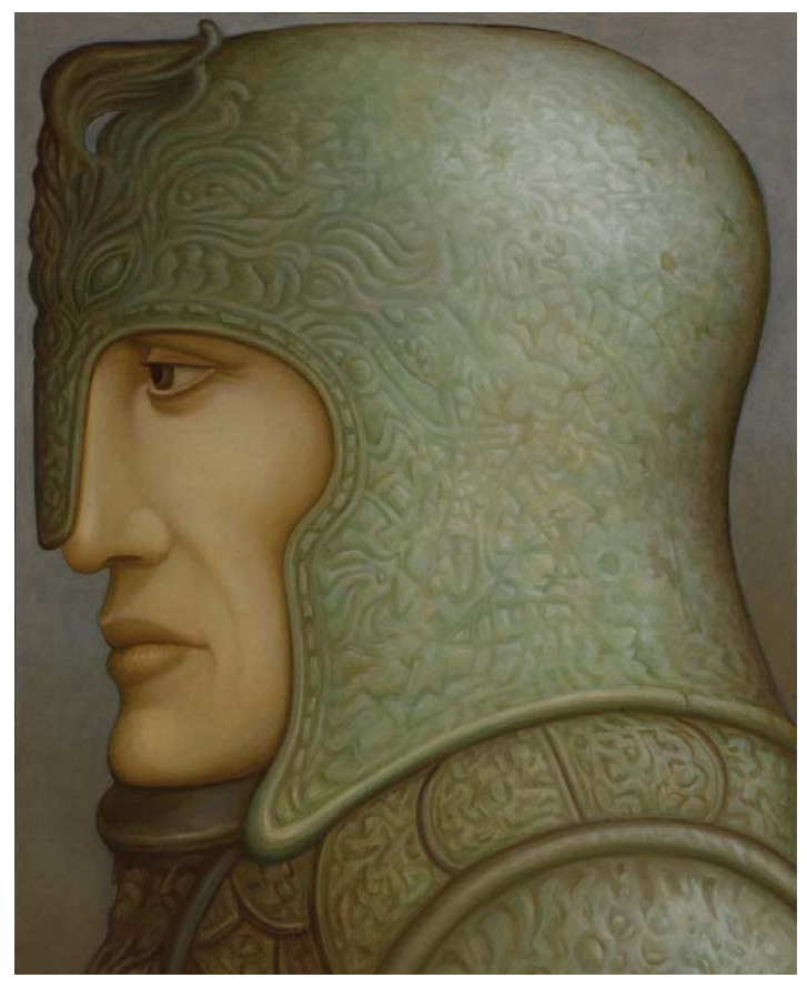
Warrior 8, 89 x 115cm