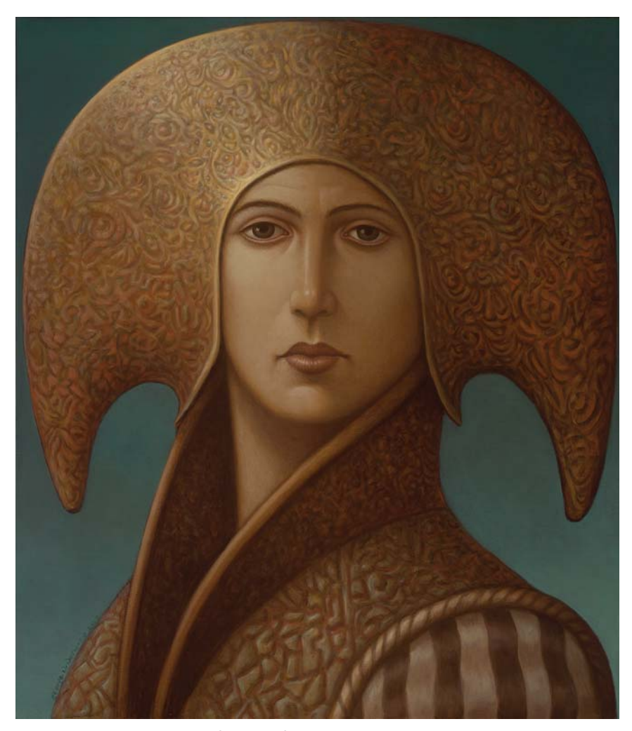
Show us the Way, 76 x 66cm