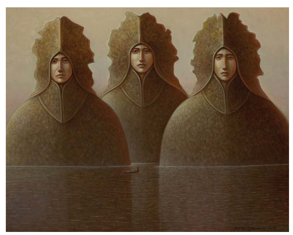
The Boatman's Dream, 61 x 76cm