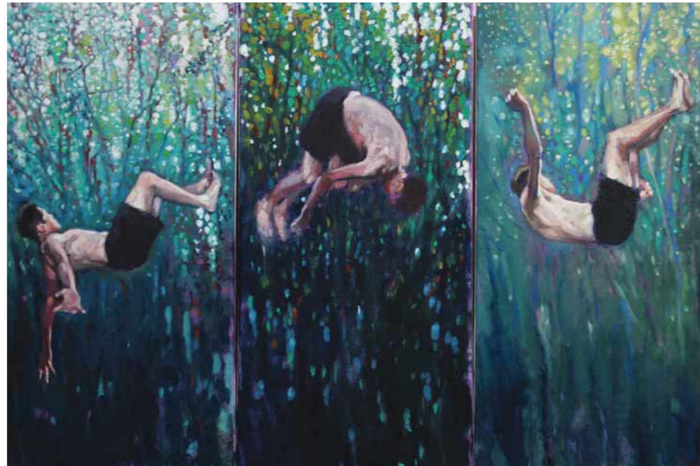
FREEFALL I, II & III 60 x 90 cm