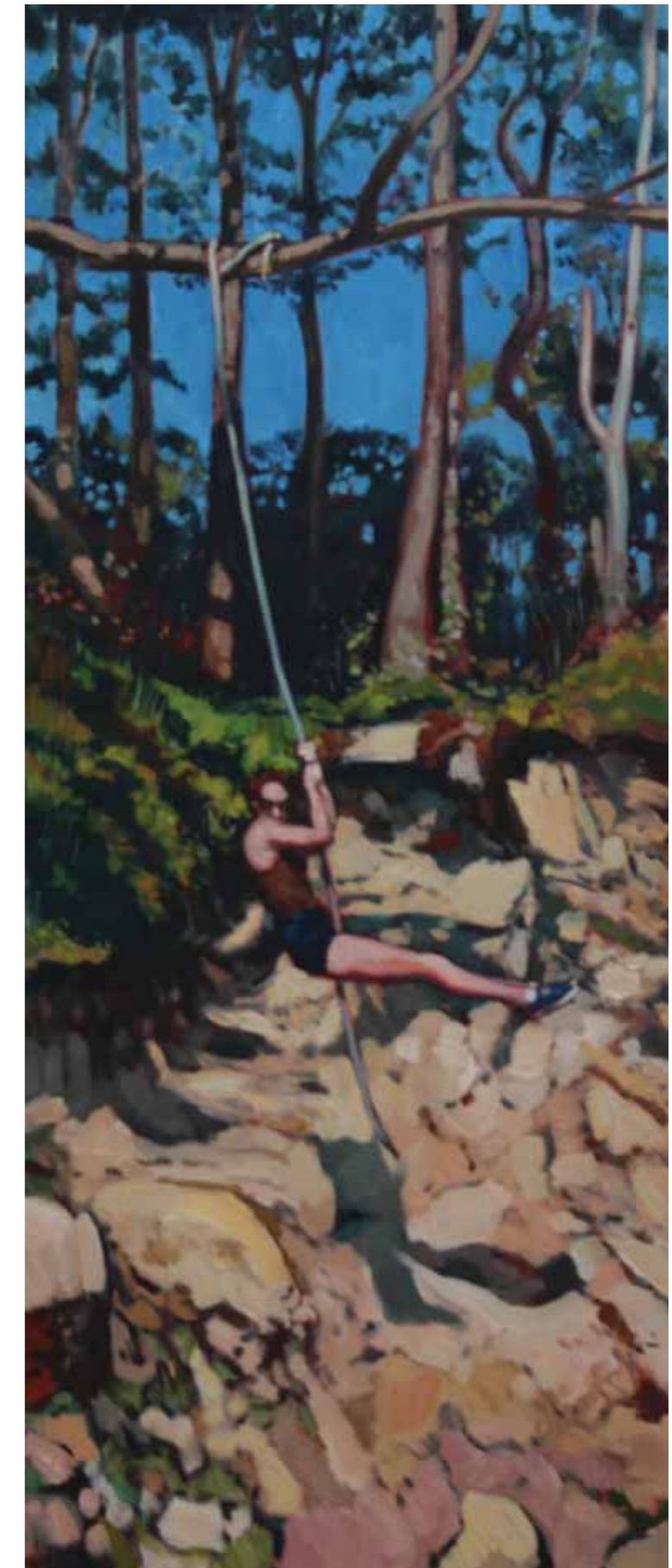
SWINGING RAYBANS 120 x 50 cm

These breathtaking landscapes, full of atmospheric light and colour, confidently celebrate our relationship with the environment and its mystery and ambivalence. Catto Gallery are proud to welcome Haydn back for his third show.