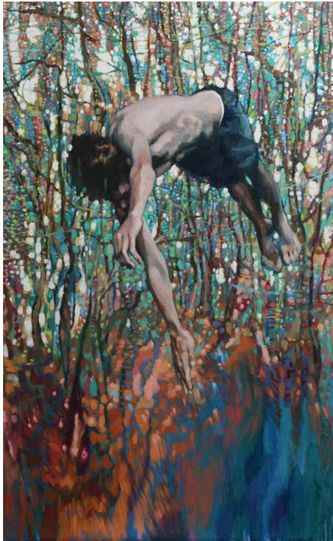
INTO THE BIRL 142 x 90 cm