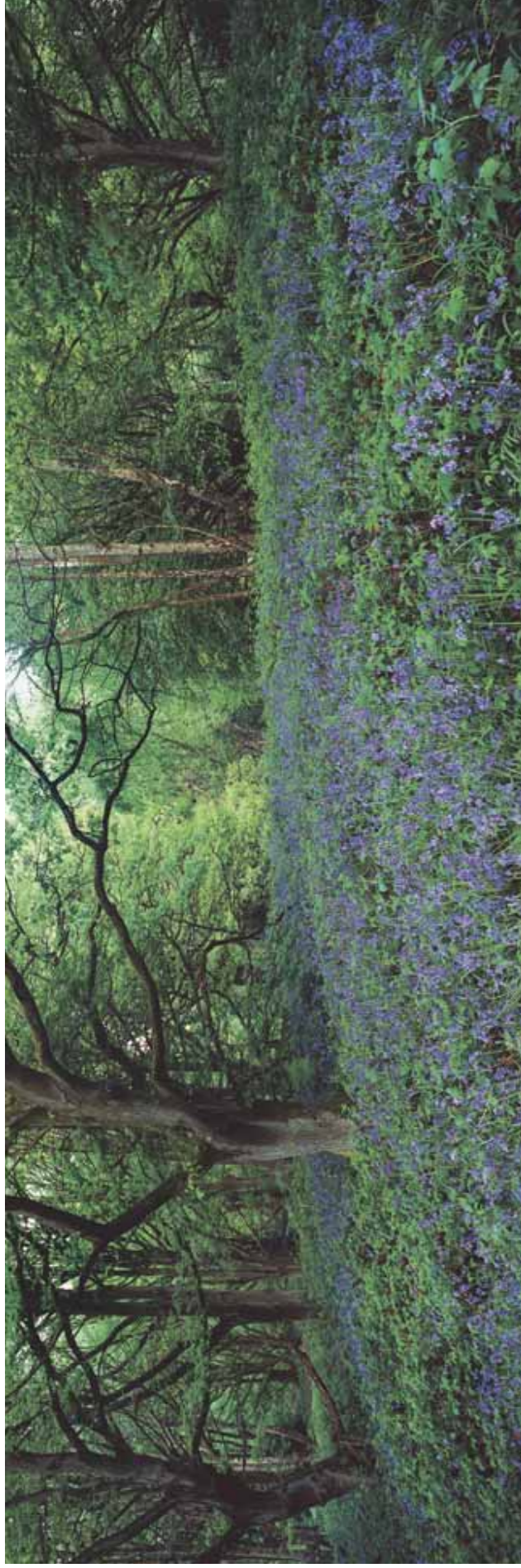
HIDDEN BLUEBELLS 40 x 120cm, Edition of 75