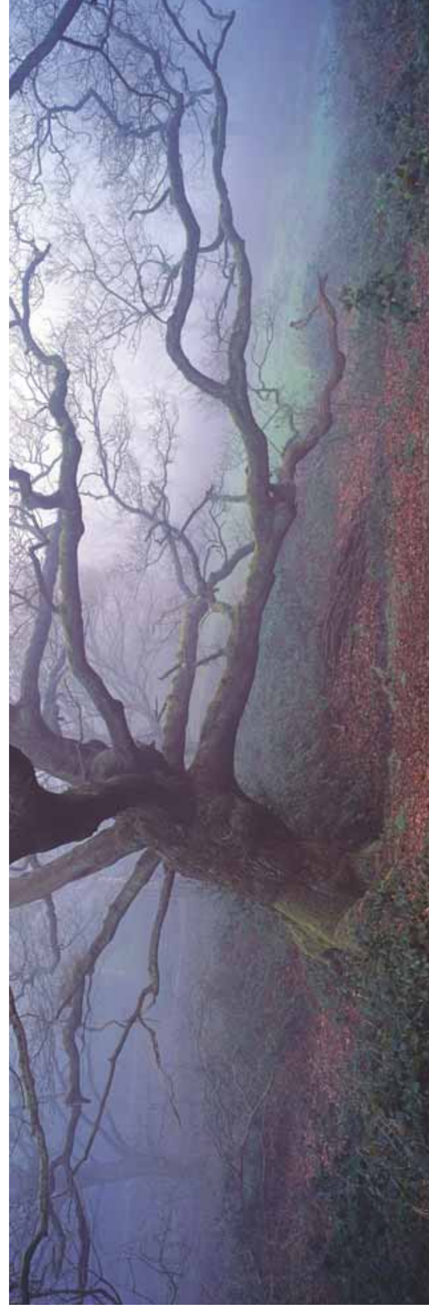
ANCIENT OAK 51 x 153cm, Edition of 75

Front Cover: Beech Tree Stand, 40 x 57cm, Edition of 75