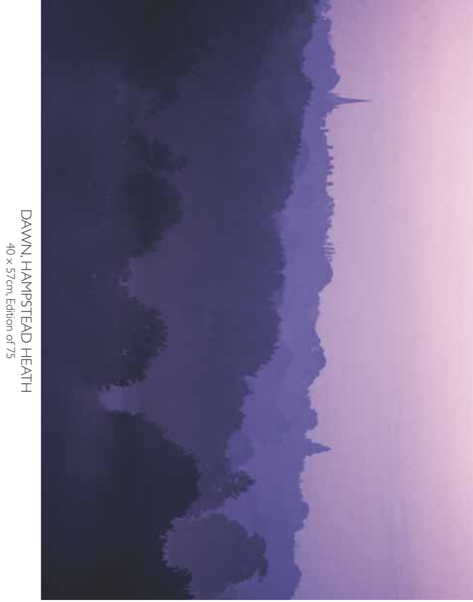
DAWN, HAMPSTEAD HEATH

100 Heath Street • Hampstead • London NW3 1DP CATTO GALLERY