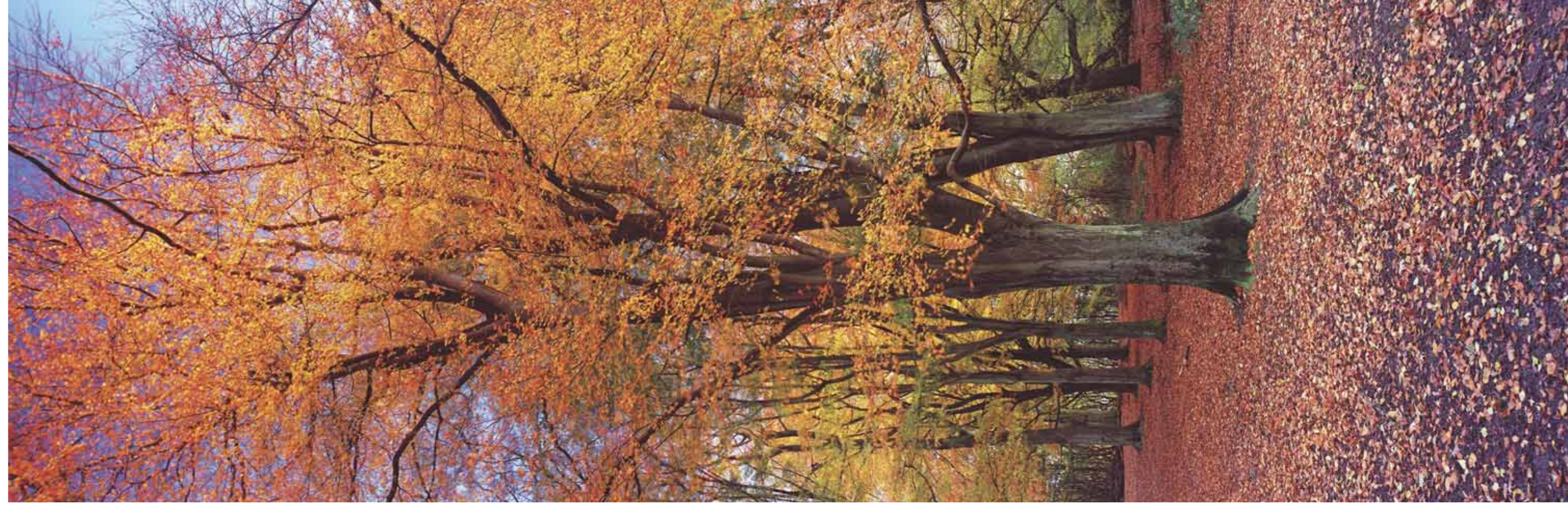
AUTUMN BEECH 153 x 51cm, Edition of 75

Front Cover: Beech Tree Stand, 40 x 57cm, Edition of 75