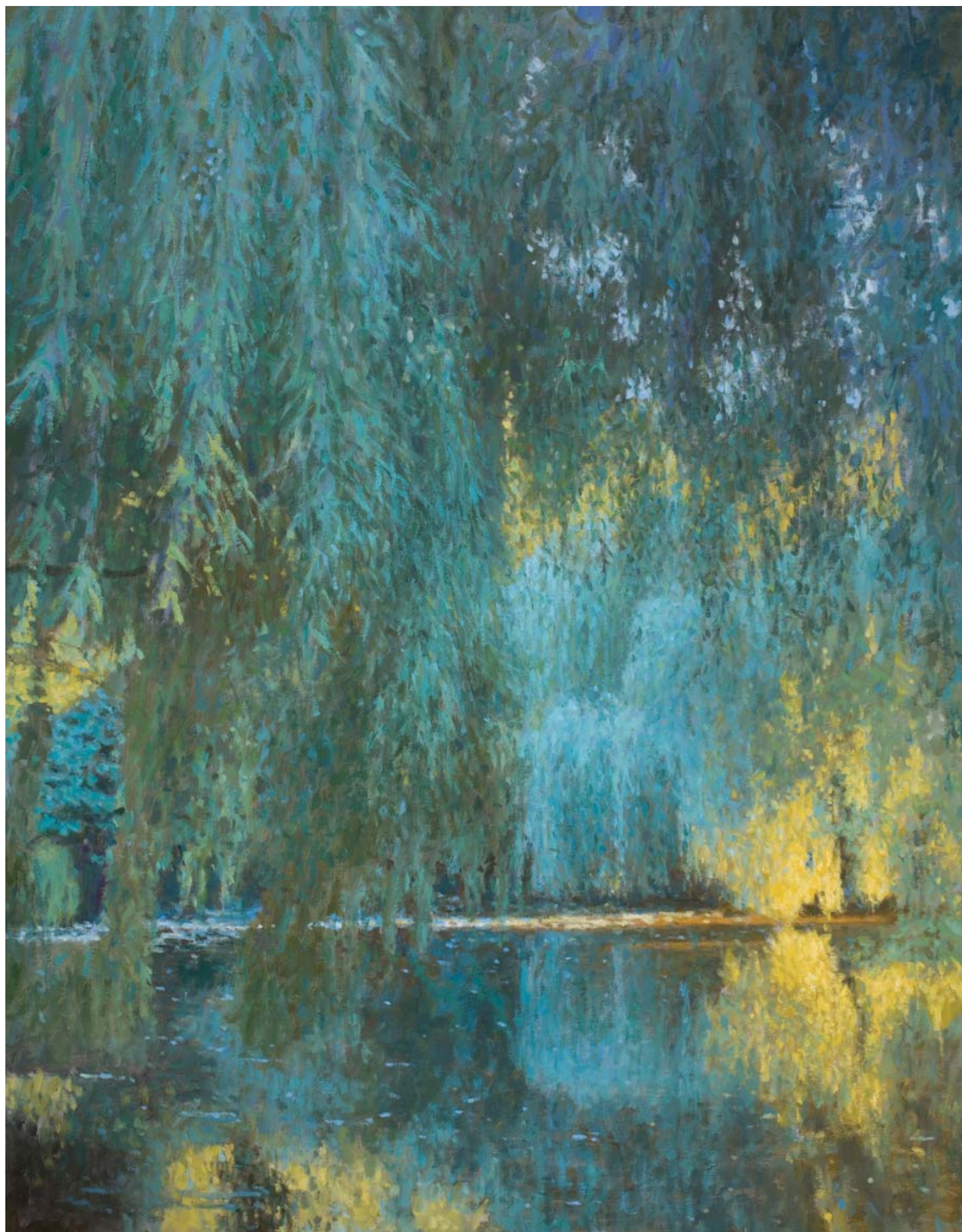
Willow Reflections, 121 x 93cm, Oil on Canvas