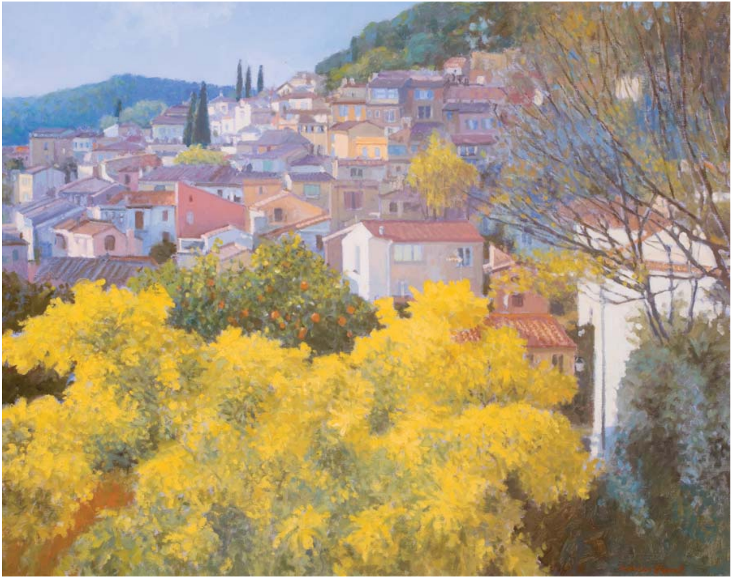
Mimosa, Alpes-Cote-d'Azur 76 x 94cm, Oil on Canvas