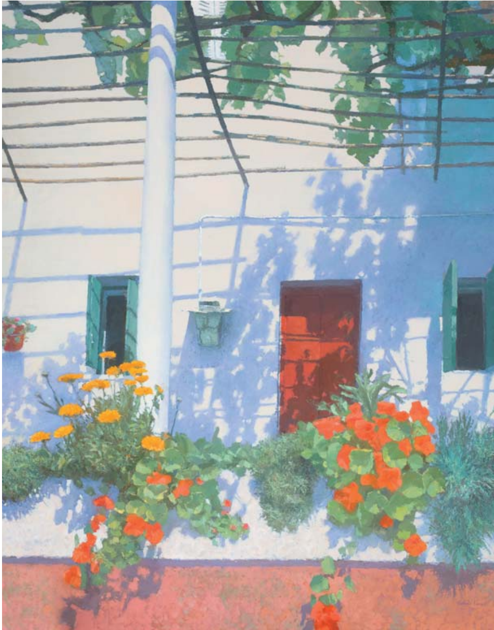
Nasturtiums under the Vines, 121 x 96cm, Oil on Canvas