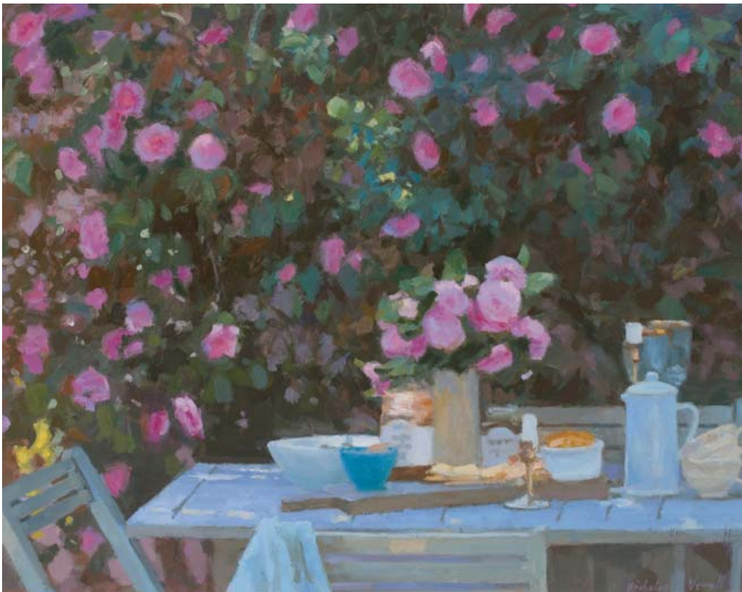
The Rose Garden, Evening, 38 x 50cm, Oil on Panel