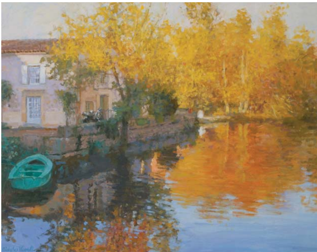
Autumn by the Lake, 50 x 62cm, Oil on Panel