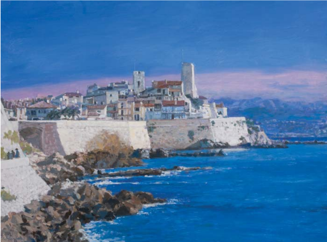
Antibes Old Town, 60 x 80cm, Oil on Panel