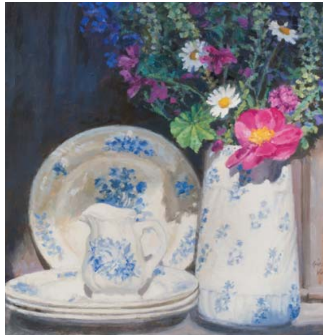
Still Life with Creamware, 40 x 39cm, Oil on Panel