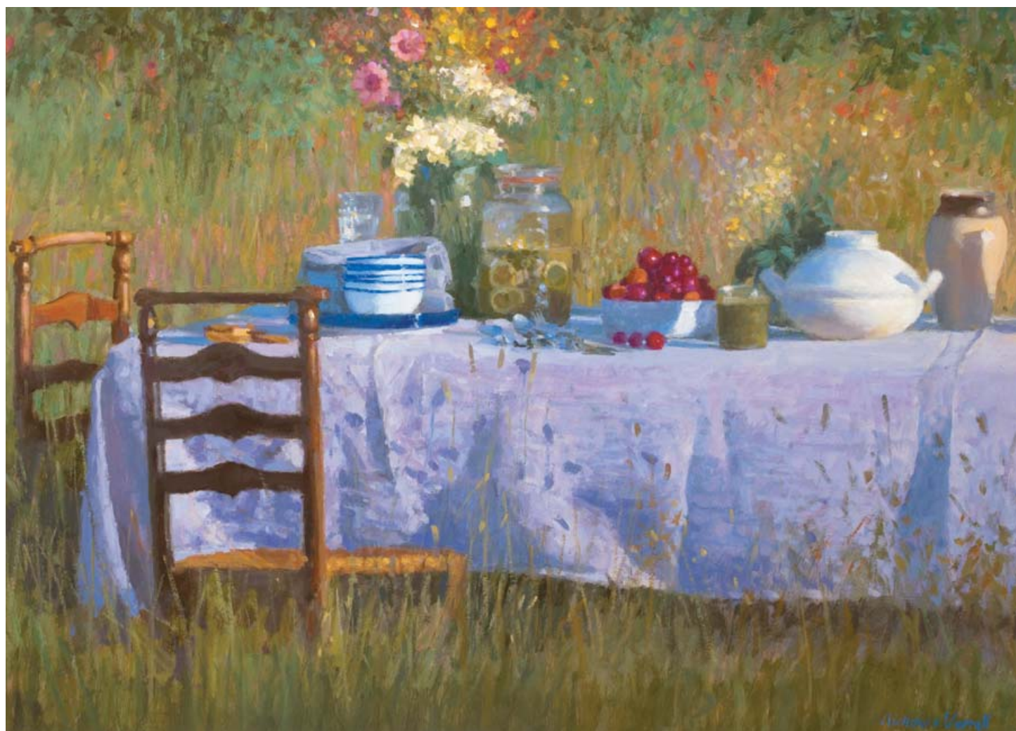
Summer in the Meadow, 49 x 69cm, Oil on Panel