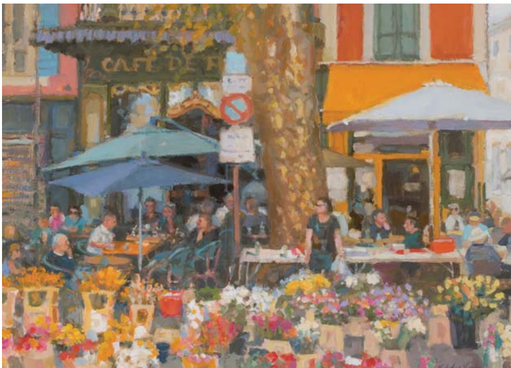
The Flower Seller, Aix-en-Provence, 35 x 50cm, Oil on Panel