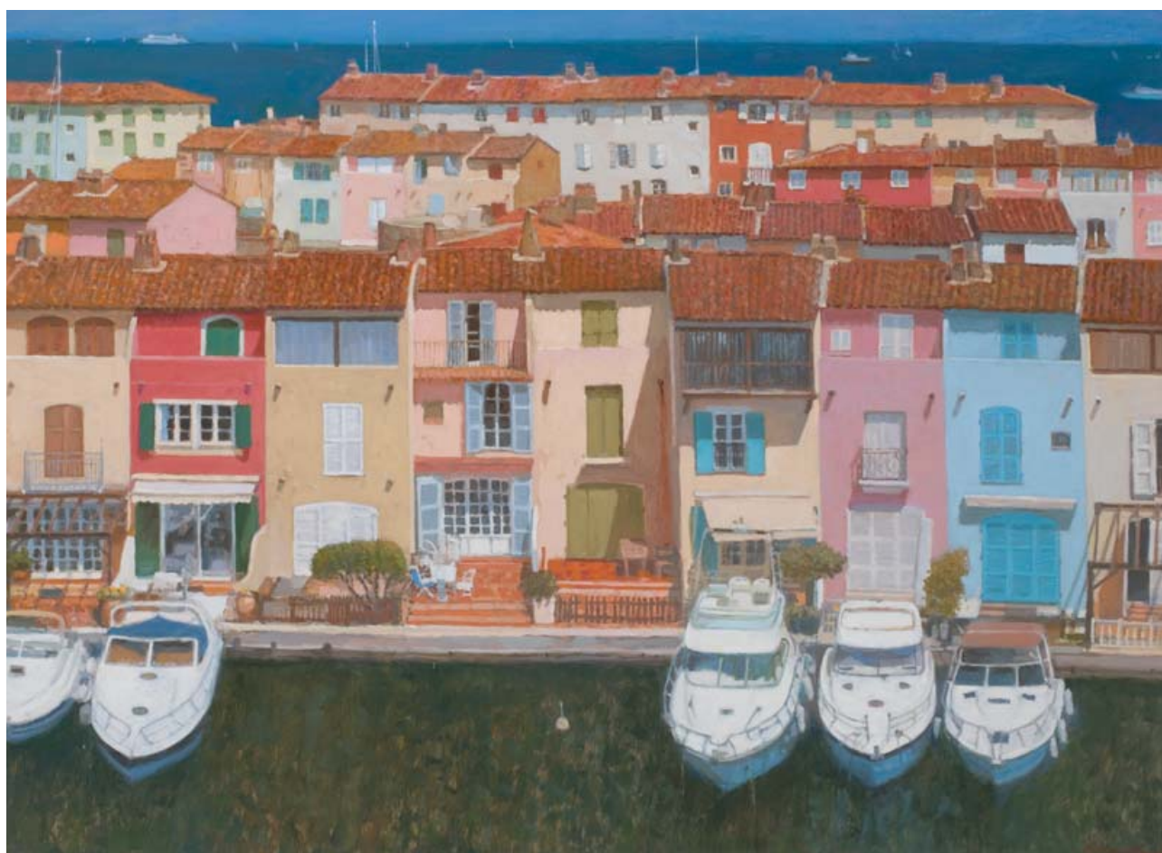
Port Grimaud, Provence, 70 x 95cm, Oil on Panel