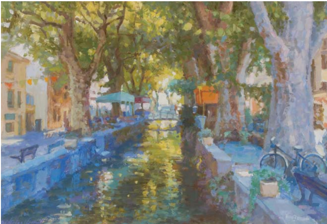
Little Venice of the Gard, 31 x 46cm, Oil on Panel