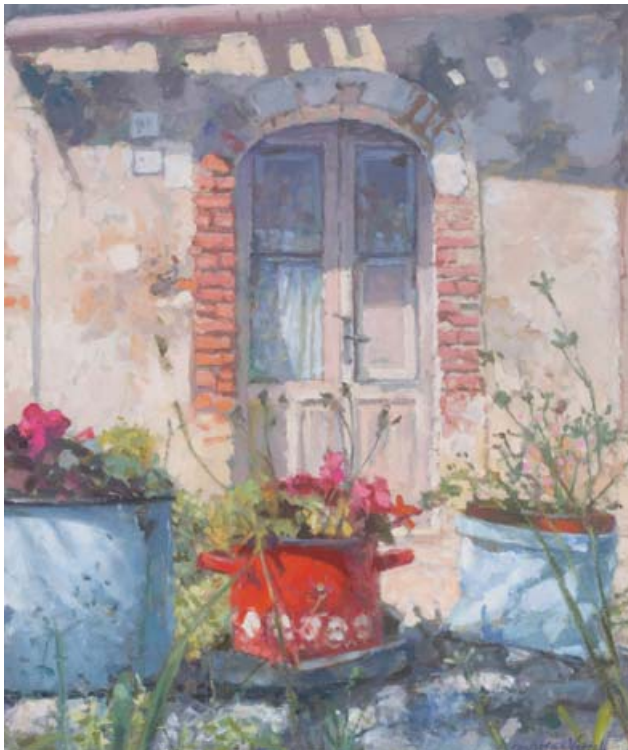
Les Beaux de-Provence, 47 x 39cm, Oil on Panel