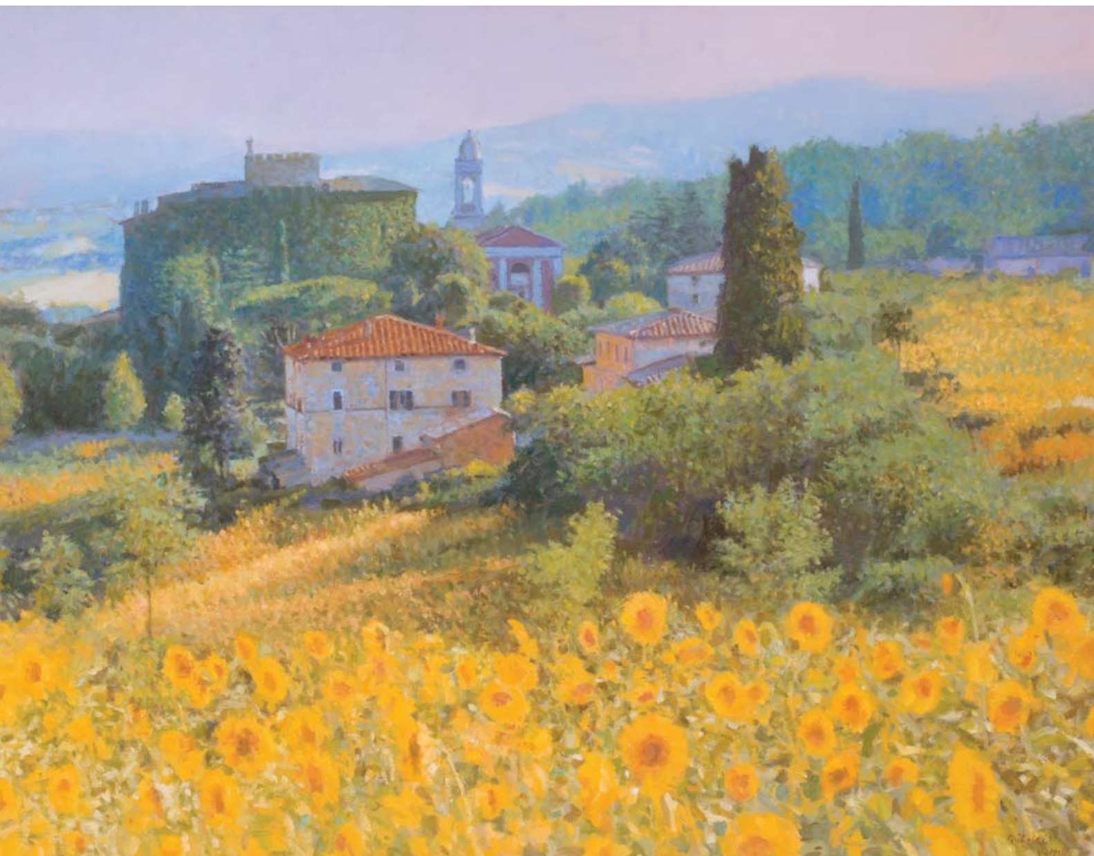
Toscana, Summer, 77 x 101cm, Oil on Canvas