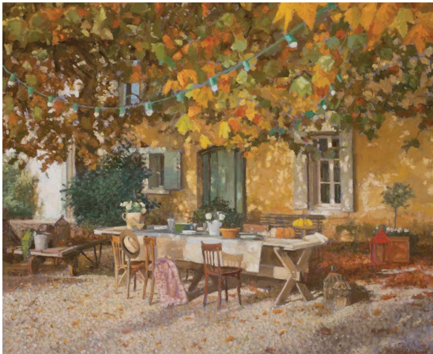
Autumn Day, Provence, 71 x 86cm, Oil on Canvas