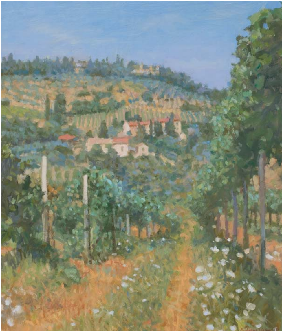
Path through the Vineyard, 44 x 36cm, Oil on Panel