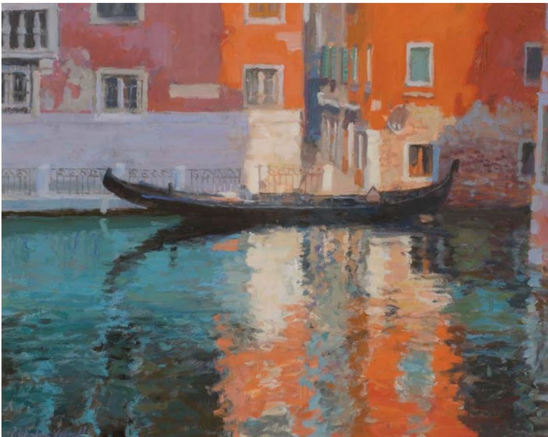
Waiting Gondola, 35 x 45cm, Oil on Panel