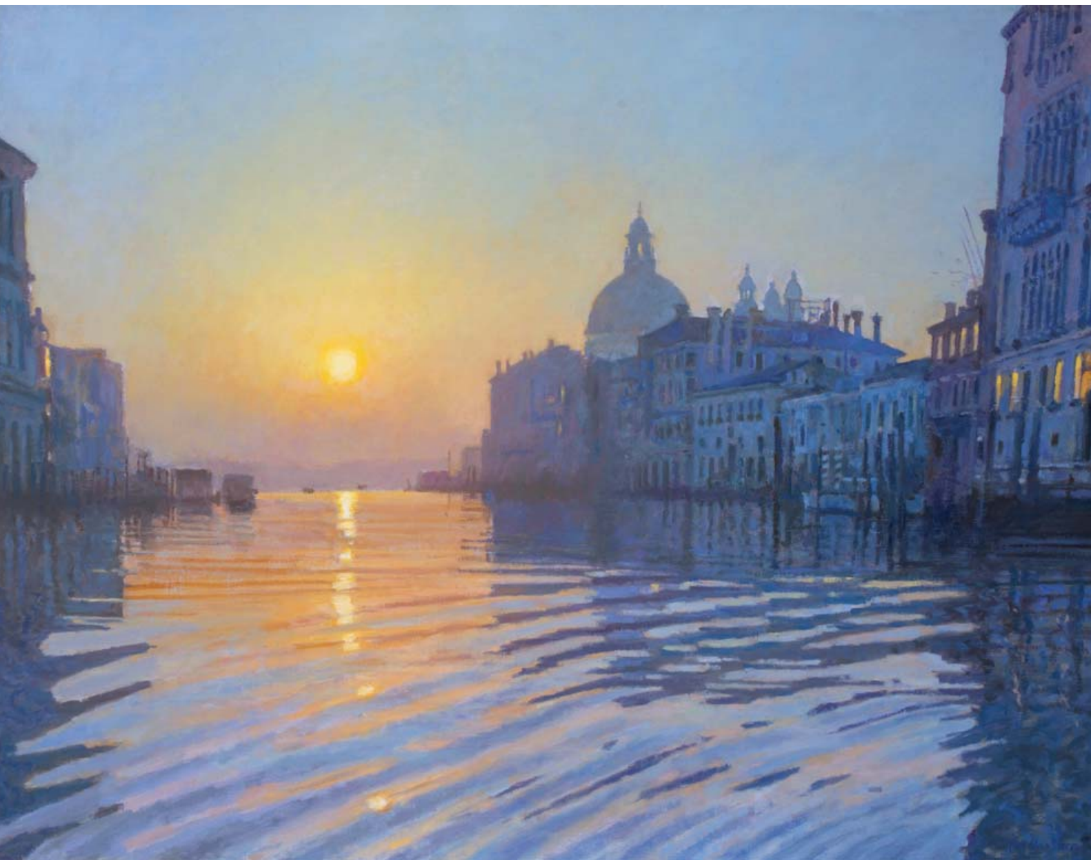
Winter Sun, Venice 79 x 101cm, Oil on Canvas