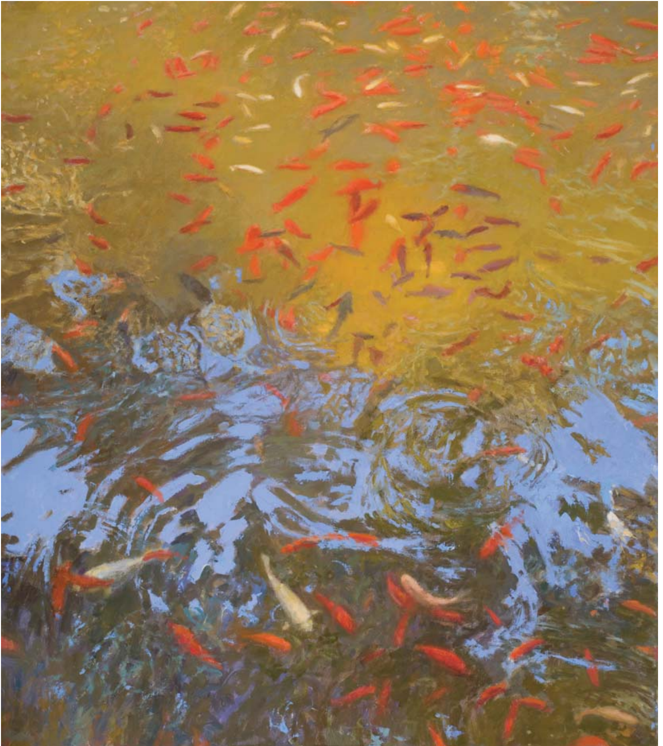
A World Beneath, 118 x 104cm, Oil on Canvas