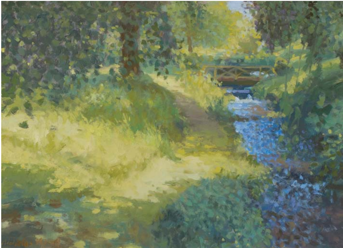
The Tillingbourne, Albury Park, 28 x 38cm, Oil on Panel