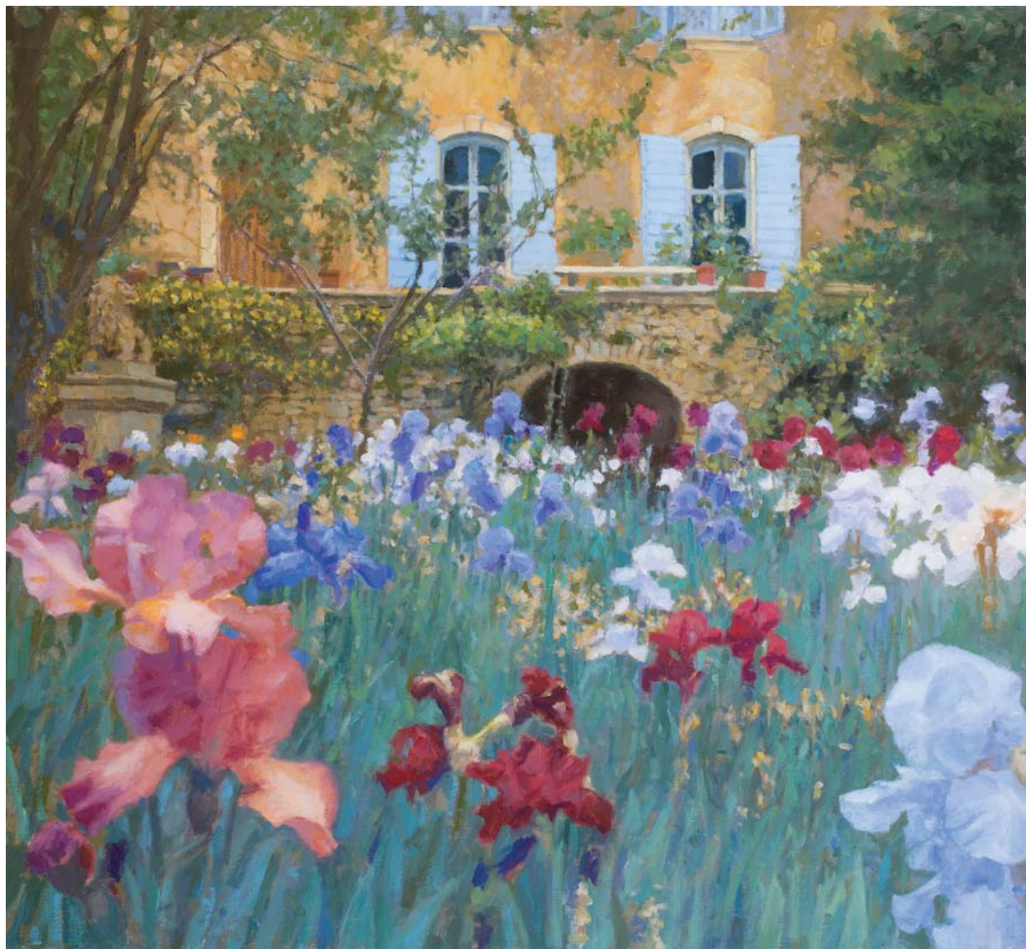
The Iris Garden 75 x 82cm, Oil on Canvas