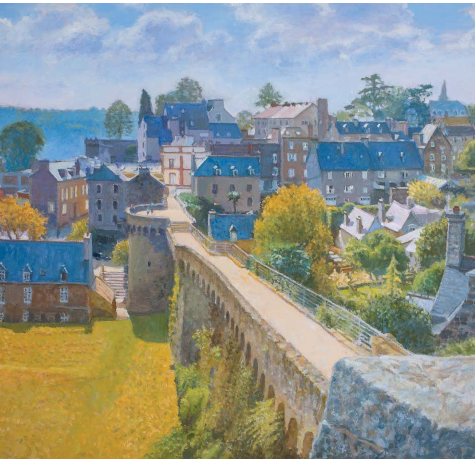
Le Rempart, Dinan, 92 x 98cm, Oil on Canvas