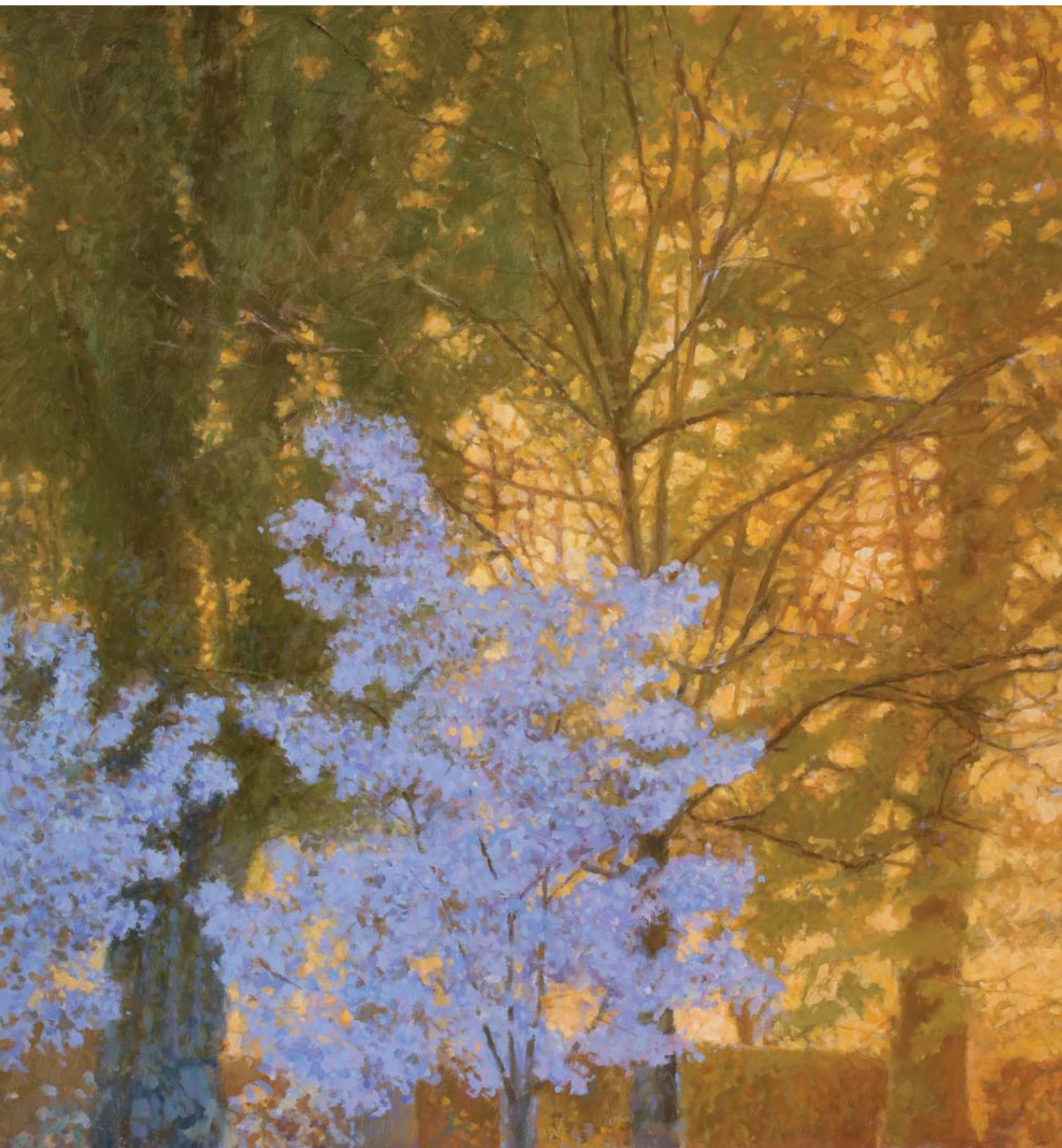
Blossom in the Woods, 106 x 101cm, Oil on Canvas