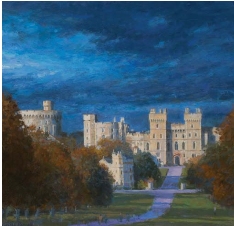
Windsor Castle, Evening 38 x 39cm, Oil on Panel