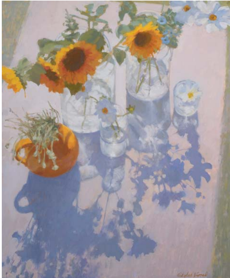
Sunflowers and Shadows, 60 x 50cm, Oil on Panel