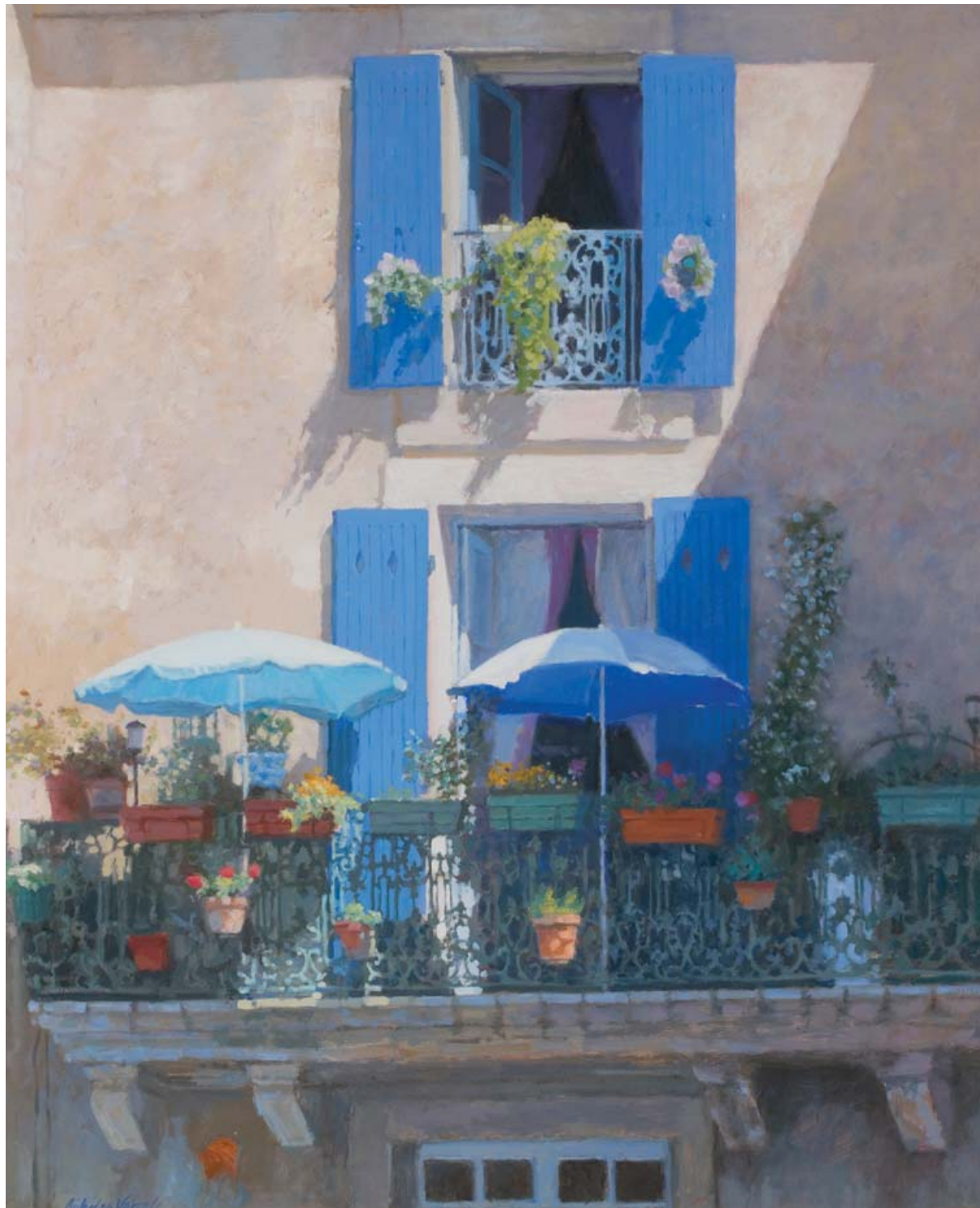
Balcony Garden, Provence, 85 x 70cm, Oil on Panel