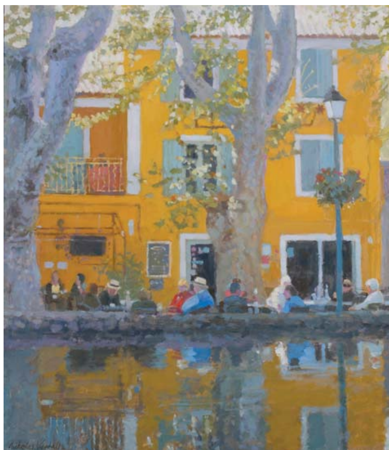
Reflections, Cucuron, 55 x 48cm, Oil on Panel