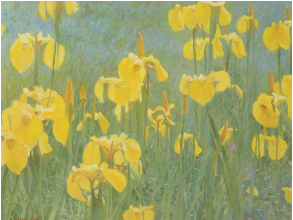
Wild Irises, Albury Park, 60 x 79cm, Oil on Panel