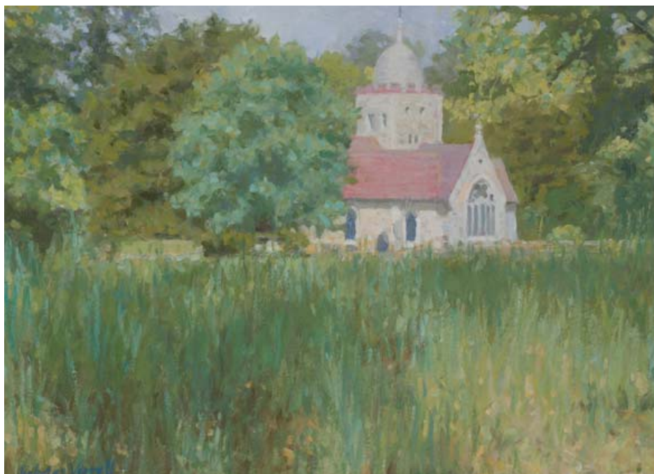
St Peter and St Paul, Albury, 28 x 39cm, Oil on Panel