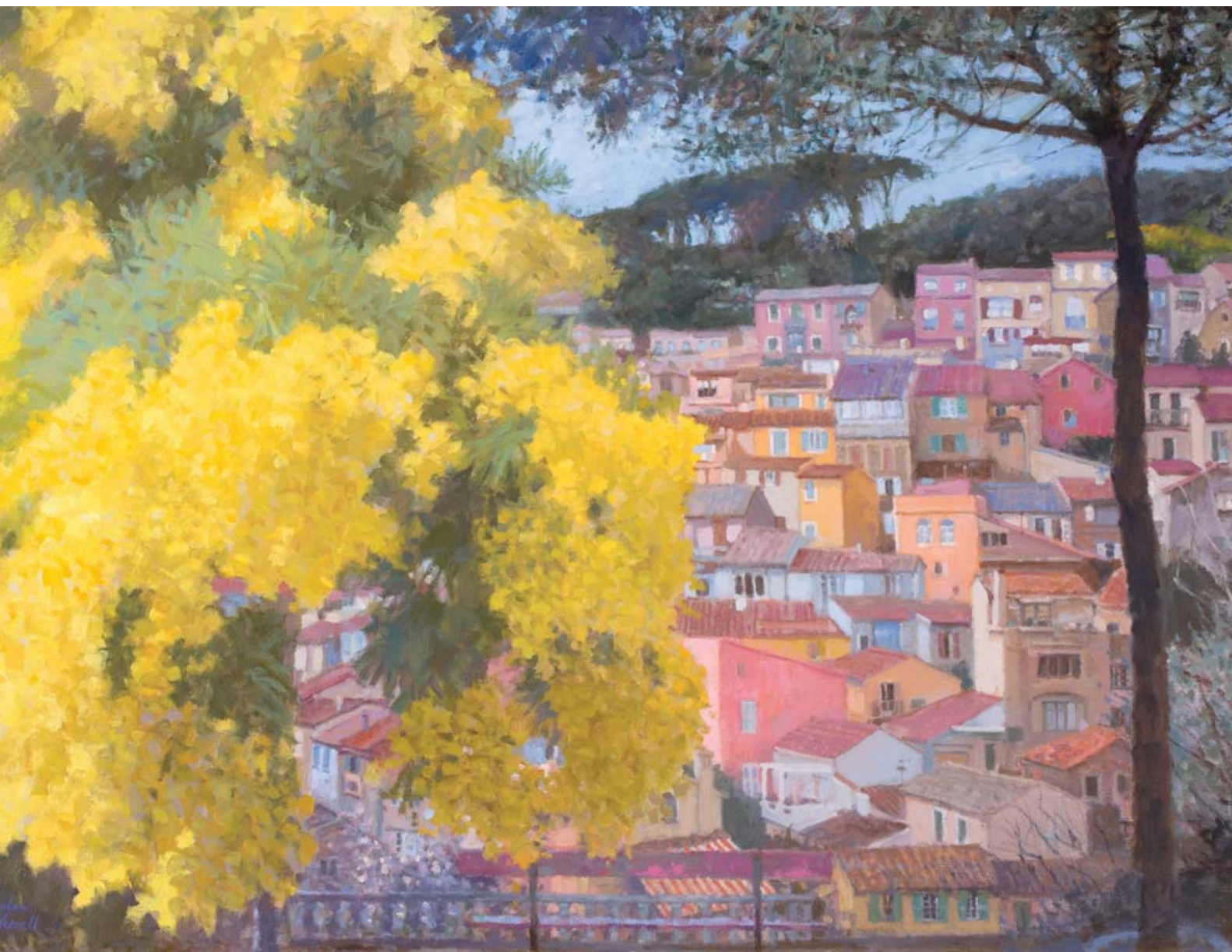
Bormes-les-Mimosas, 80 x 107cm, Oil on Canvas