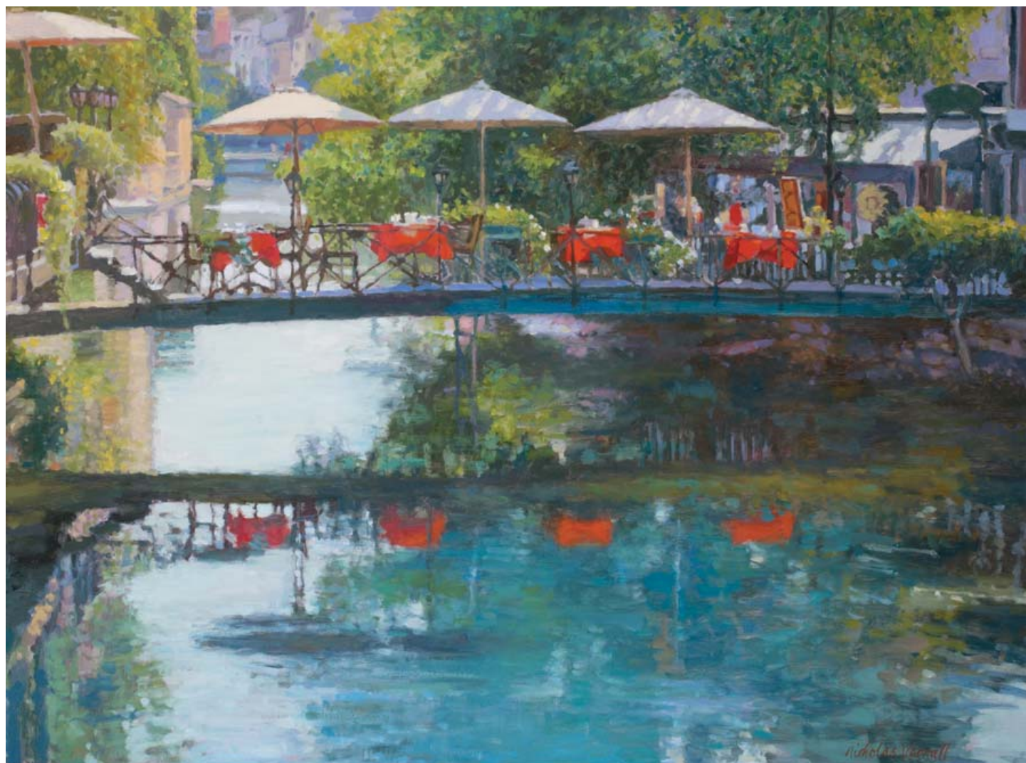
L'Isle-sur-la-Sorgue, 60 x 80cm, Oil on Panel