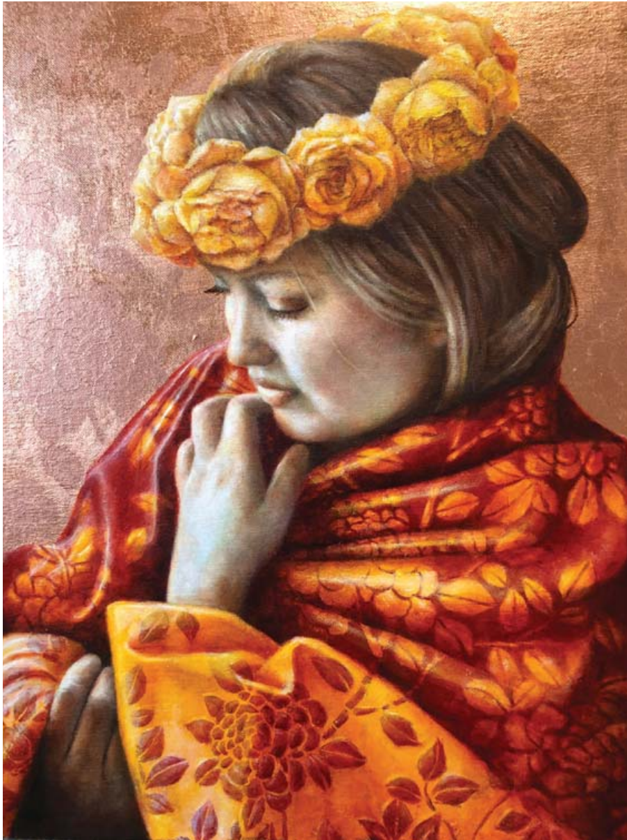
Midsummer Eve, 65 x 50cm, Oil on Metal Leaf on Canvas Board