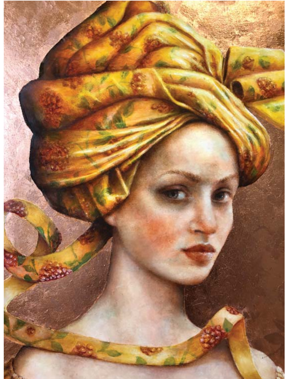
Here's come Summer 63 x 48cm, Oil on Copper Leaf on Linen