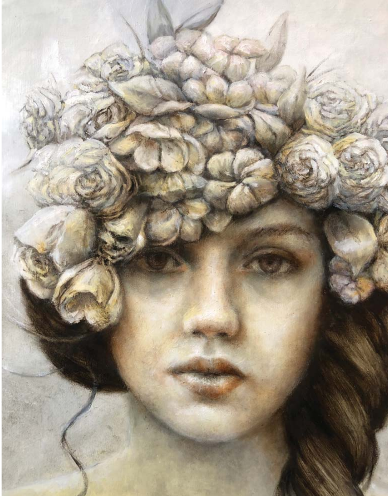
Dreaming of Winter, 38 x 33cm, Oil on Copper Leaf on Linen