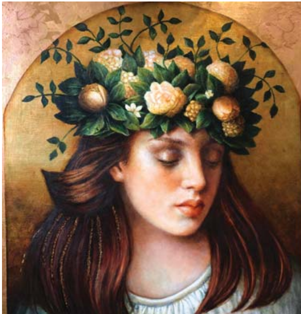
Forest Songs, 20 x 20cm, Oil on Copper Leaf on Linen

Evidently, George and Pam each belong to a particular strain of European art – one that focuses on the senses and the mind over pure logic and realism. It's a fine tradition, stretching back to the dark ages via Fuseli, Bruegel and Bosch. So we thought it would be a good idea to bring them together in one show. Here it is.