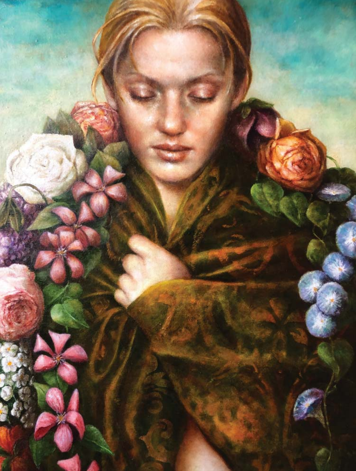
Morning Star, 65 x 50cm, Oil on Metal Leaf on Canvas Board