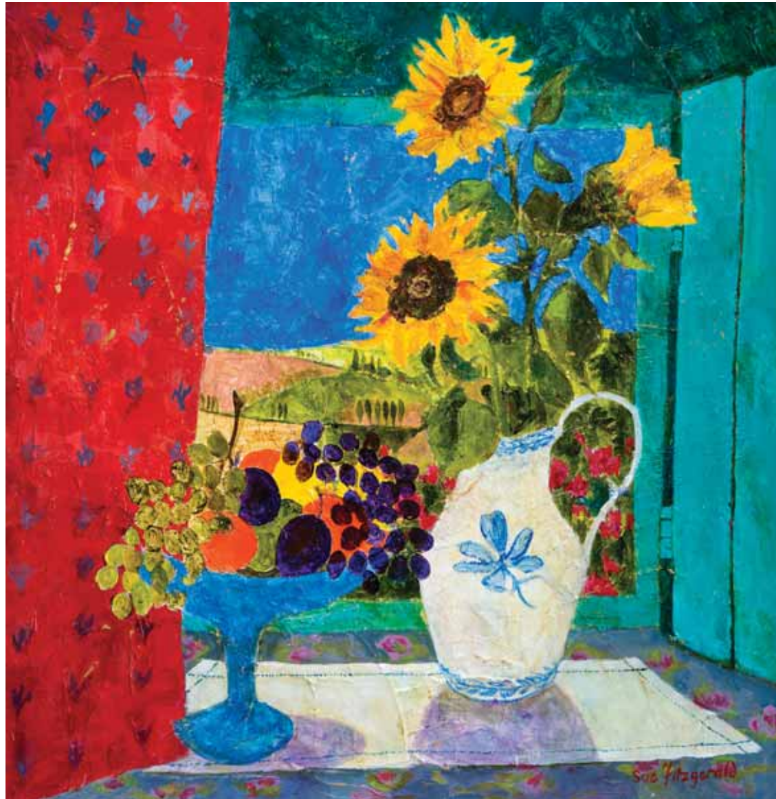
VIEW FROM THE FARMHOUSE: ST BAUZILLE DE LA SYLVE 69 X 69 cm Mixed media on canvas