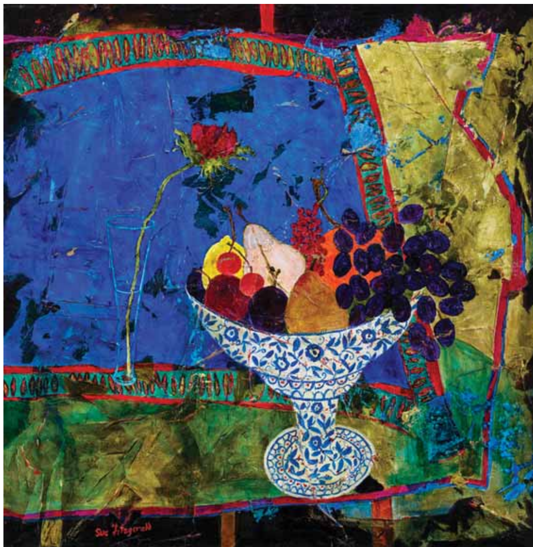
REDCURRANTS AND RAJASTAN SHAWL 59 X 59 cm Mixed media on canvas