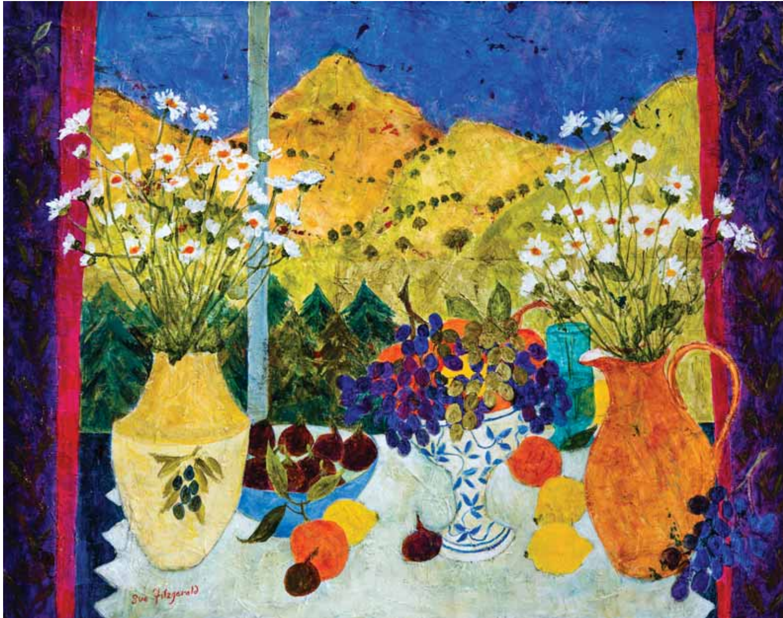
SPRING IN THE TROODOS MOUNTAINS: CYPRUS 69 X 89 cm Mixed media on canvas