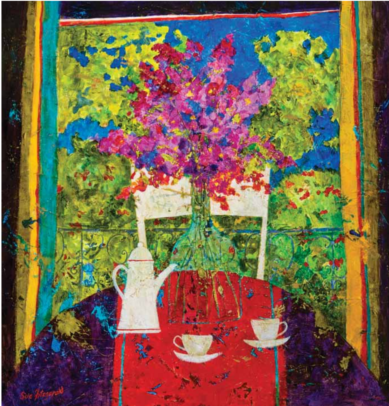
CAFÉ PICASSO: PARIS 79 X 79 cm Mixed media on canvas