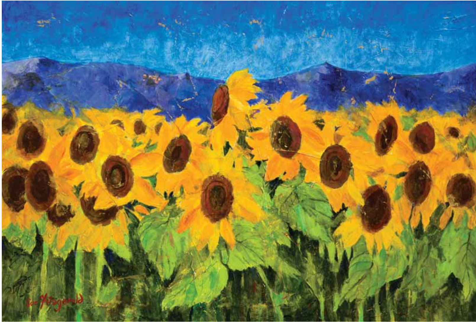
SUNFLOWERS & CEVENNES MOUNTAINS 49 X 73 cm Mixed media on canvas