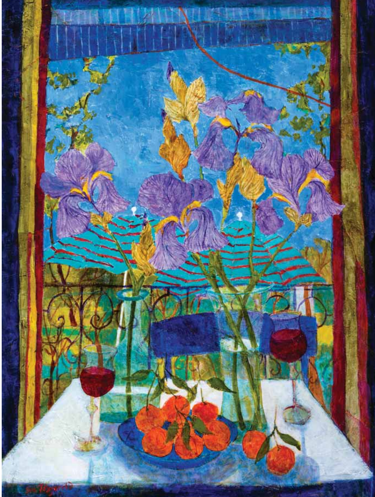
LUNCHTIME IN THE LANGUEDOC 91 X 69 cm Mixed media on canvas