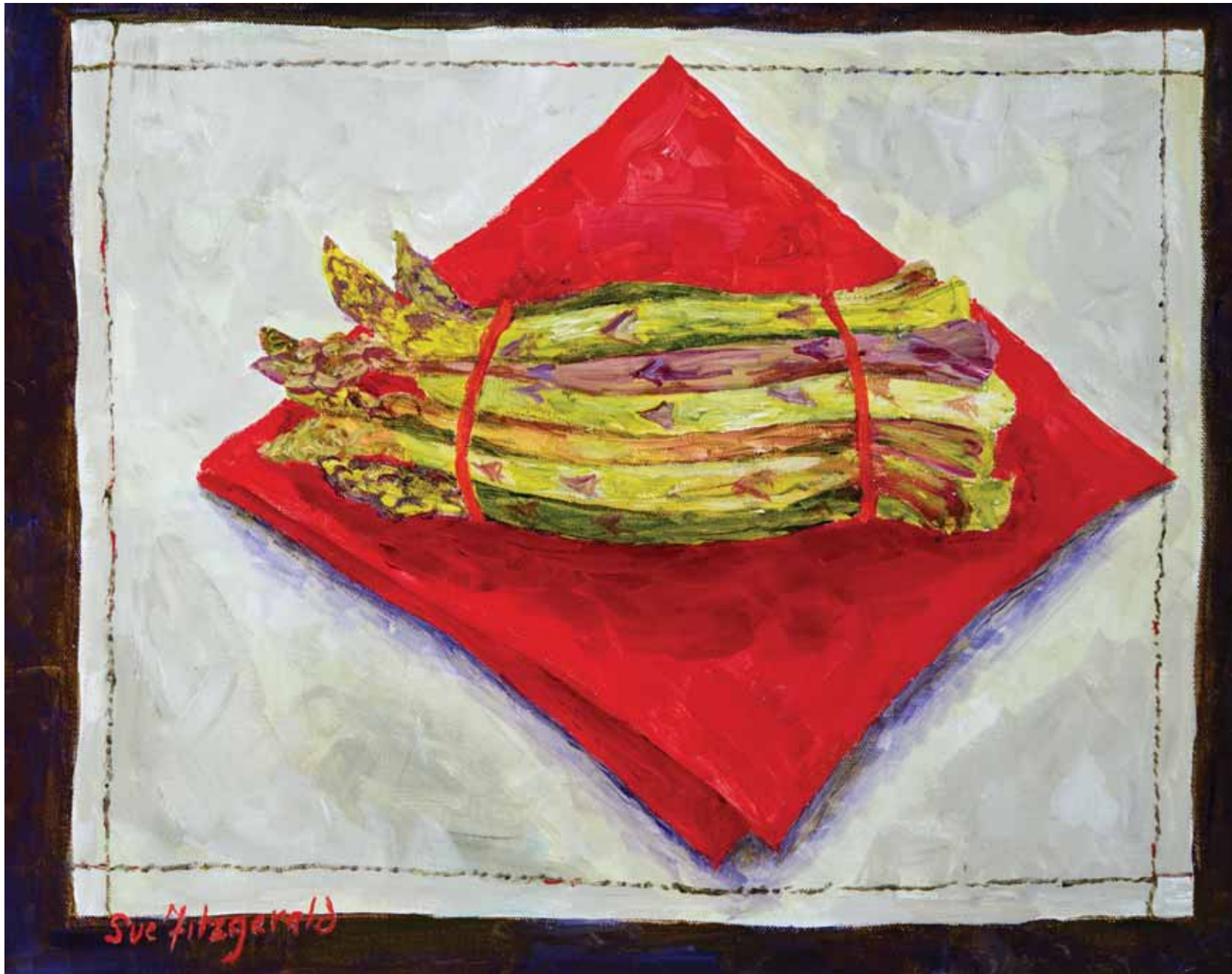
ASPARAGUS I: AFTER MANET 36 X 46 cm Mixed media on canvas