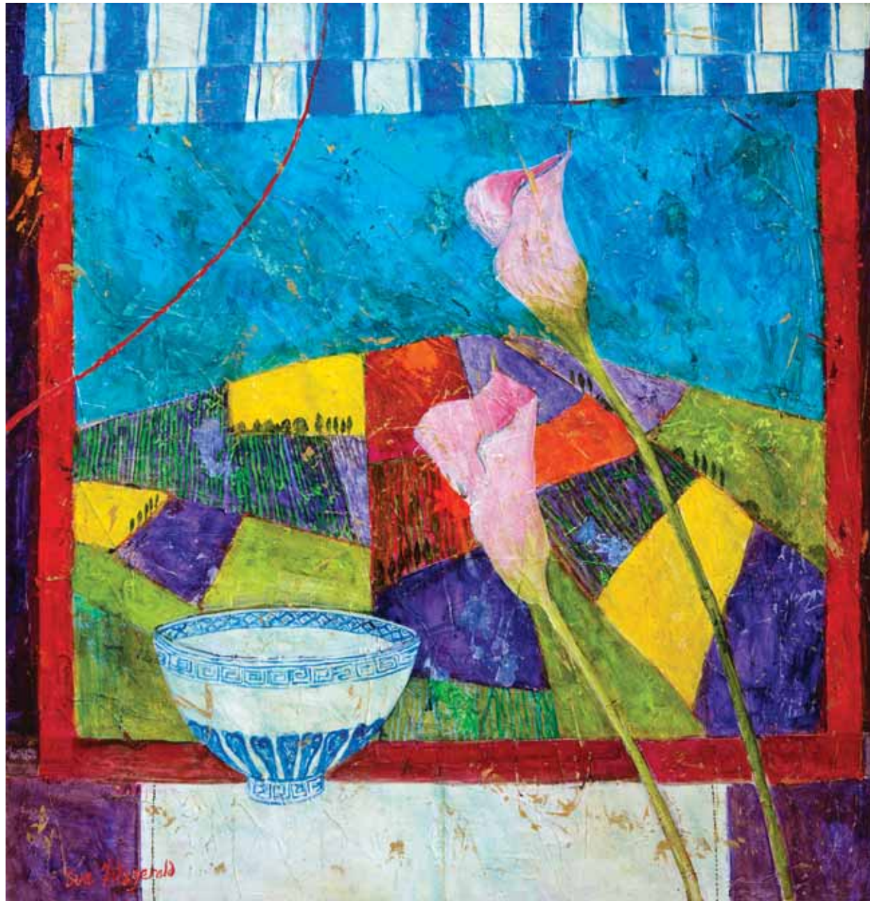
LAVENDER FIELDS AND LILLIES 69 X 69 cm Mixed media on canvas