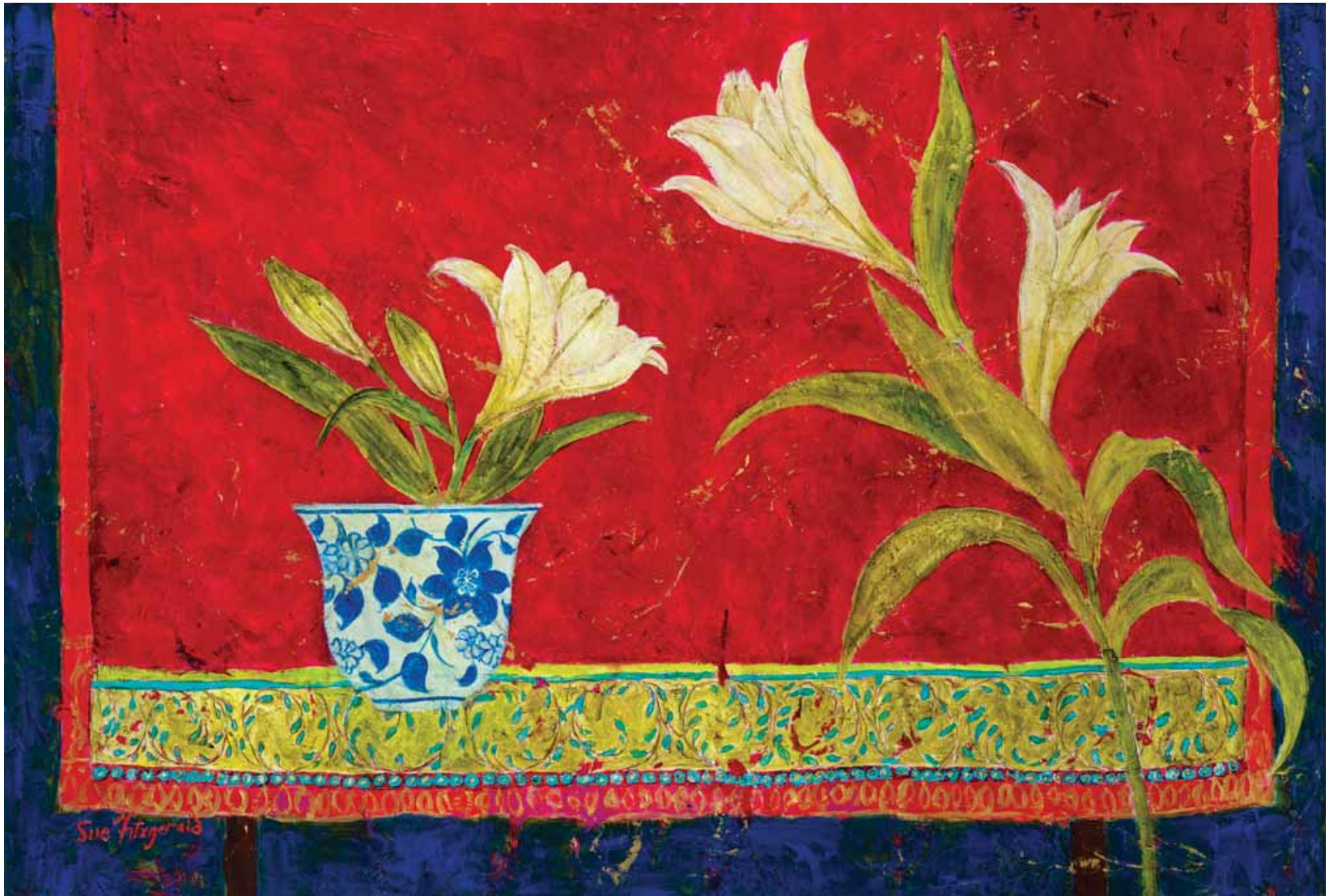
LILLIES AND RED SILK 61 X 89 cm Mixed media on canvas