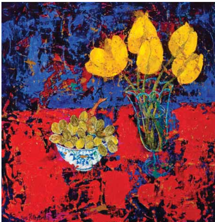
GRAPES AND RED CLOTH 38 X 38 cm Mixed media on canvas