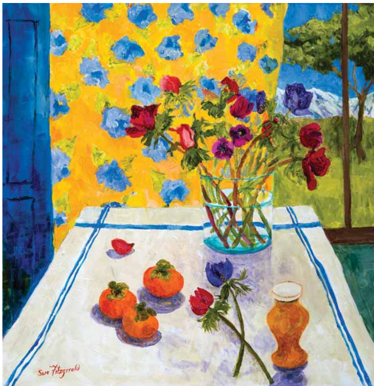
HONEY JAR AND PYRENNES 59 X 59 cm Mixed media on canvas