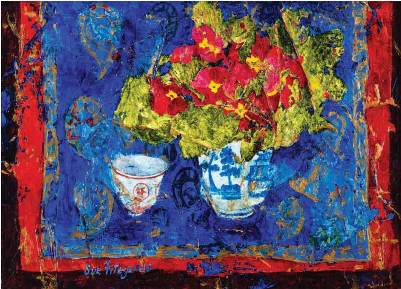
JASMINTEA 26 X 36 cm Mixed media on canvas

OPPOSITE PAGE: DRAGON & SILKEN STRANDS 100 X 100 cm Mixed media on canvas