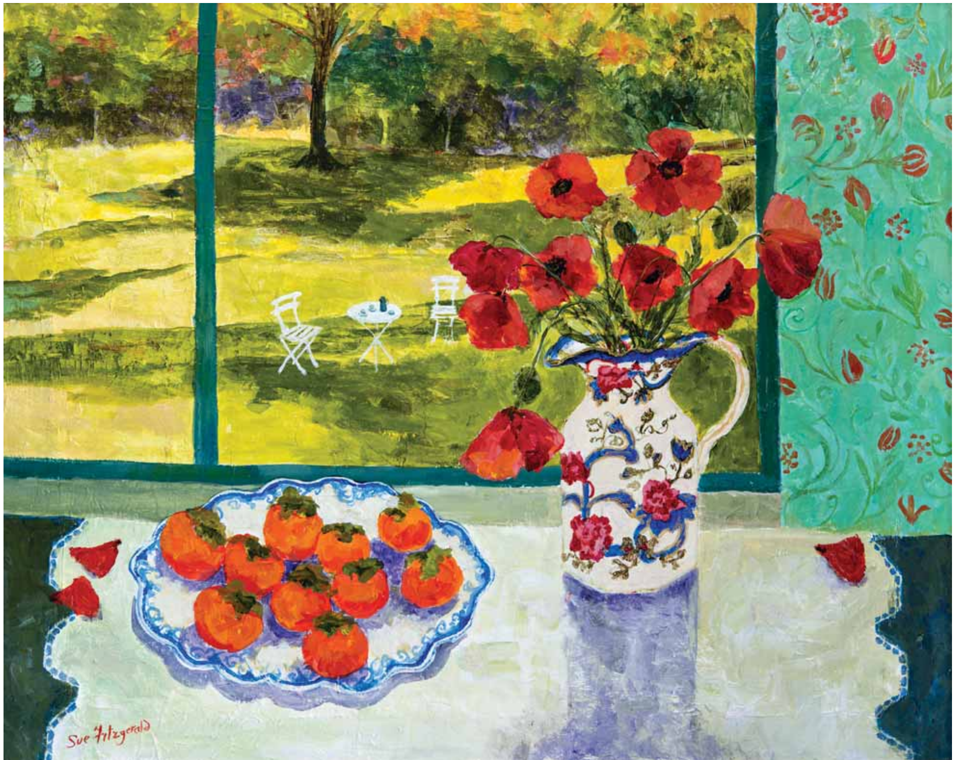
THE MANDALAY JUG 69 X 89 cm Mixed media on canvas