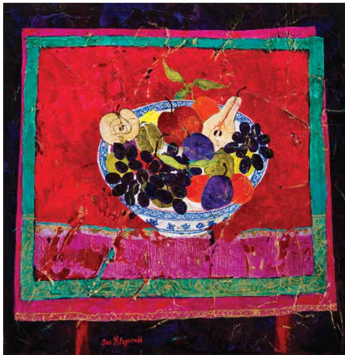
ANTIQUÉ SILK AND VELVET 59 X 59 cm Mixed media on canvas