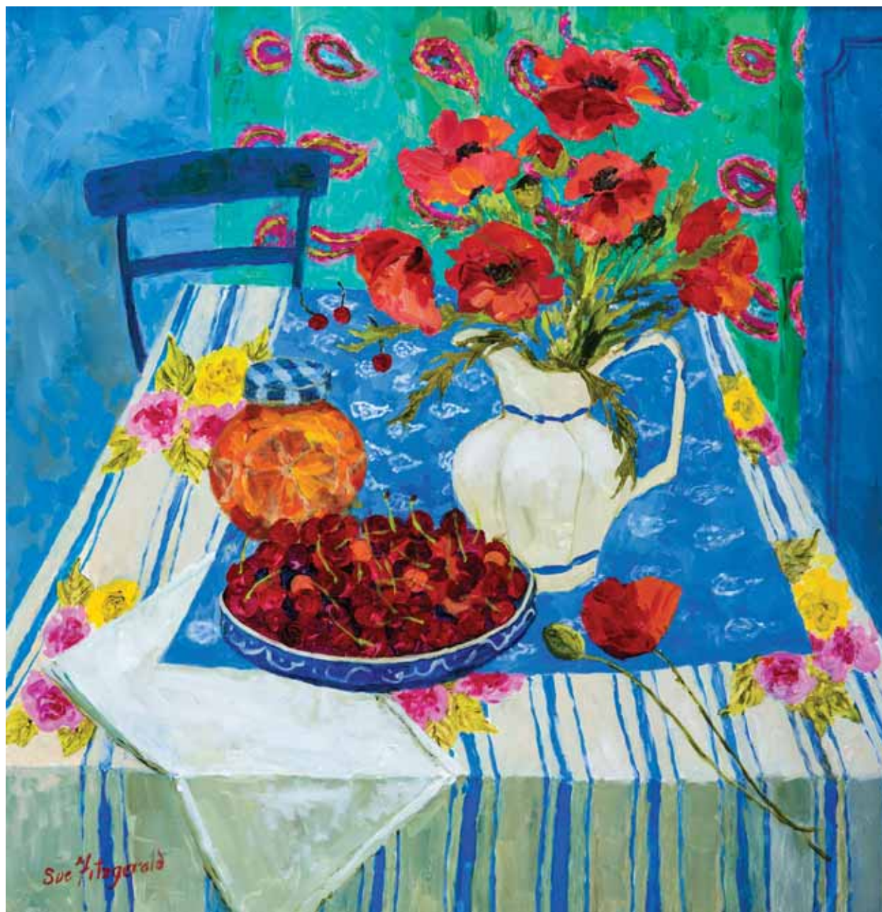
FARMHOUSE KITCHEN: ST BAUZILLE DE LA SYLVE 59 X 59 cm Mixed media on canvas