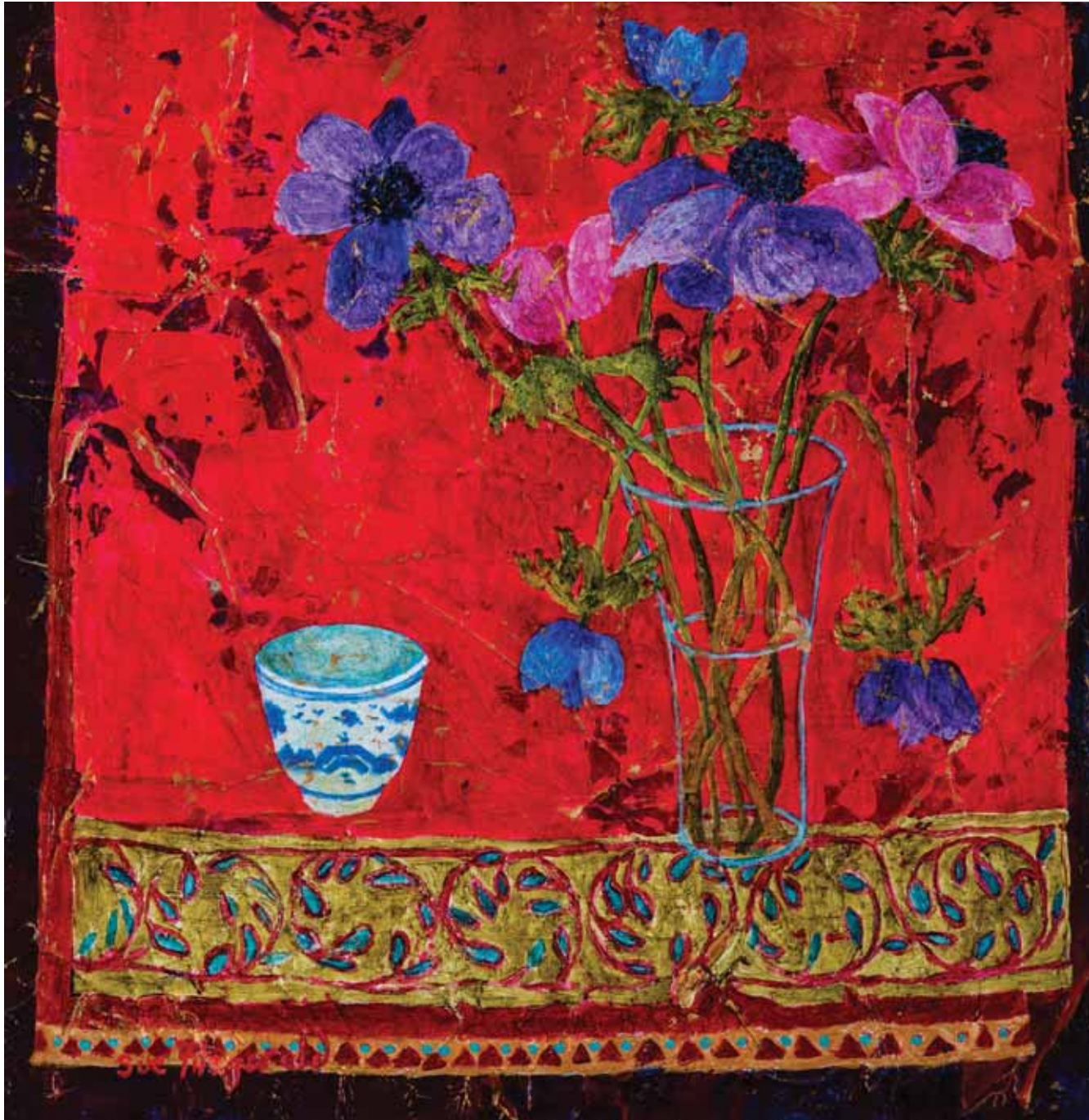
EMBROIDERED CLOTH FROM UDAIPUR 41 X 41 cm Mixed media on canvas