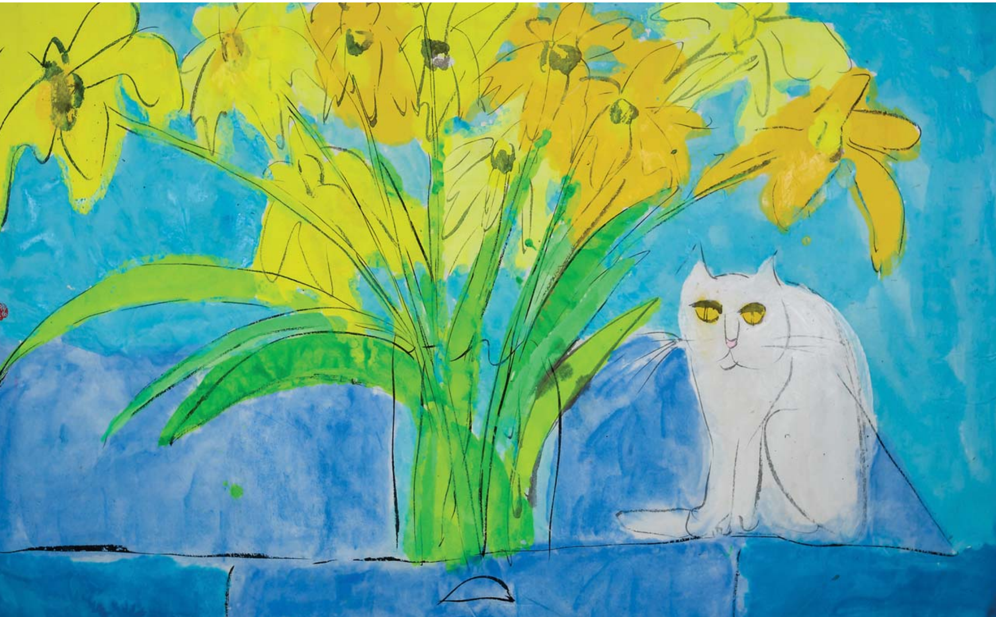
Mischievous Cat and Yellow Flowers, 96 x 150cm