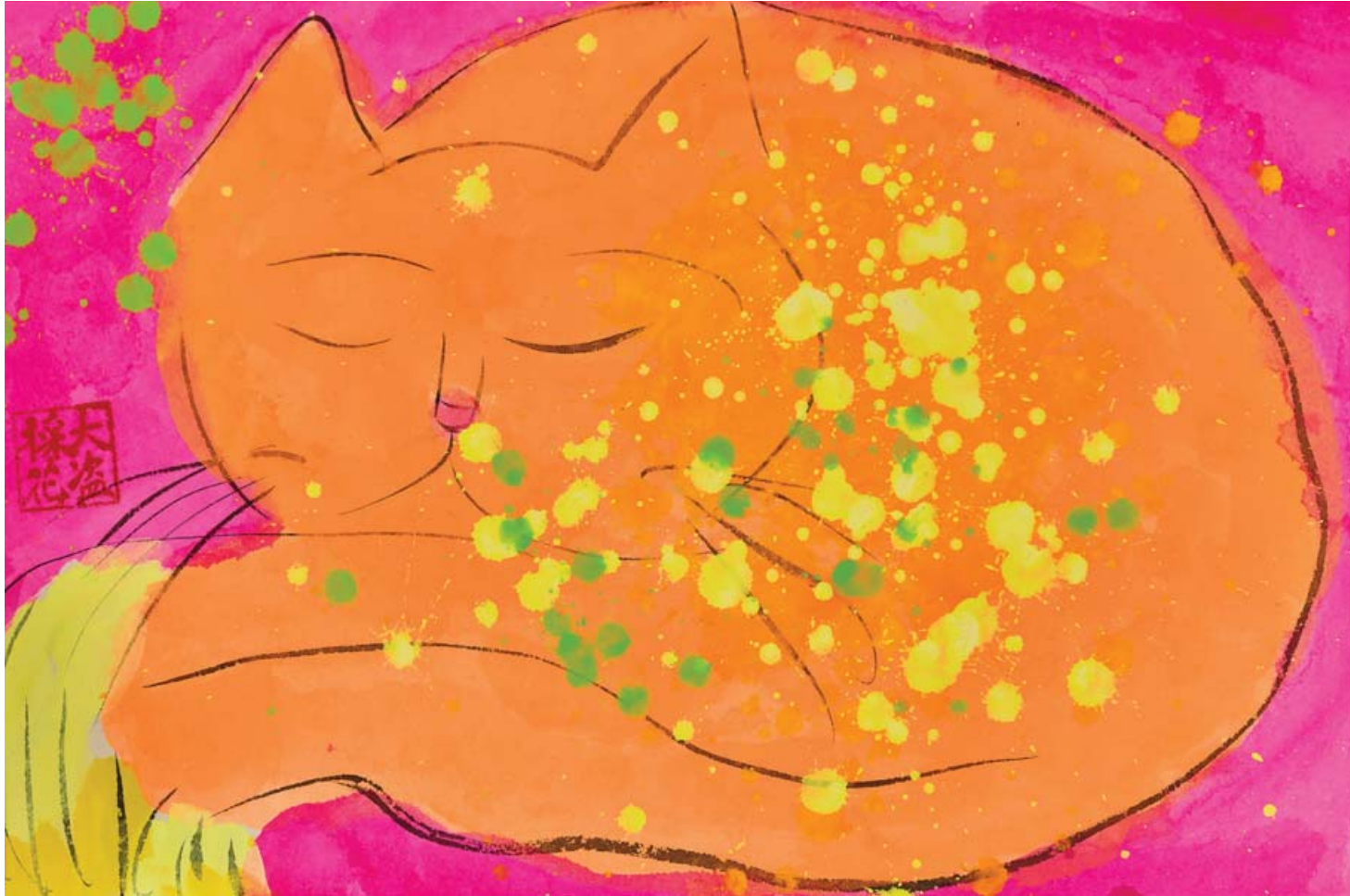
Sleeping Orange Cat, 32 x 48cm