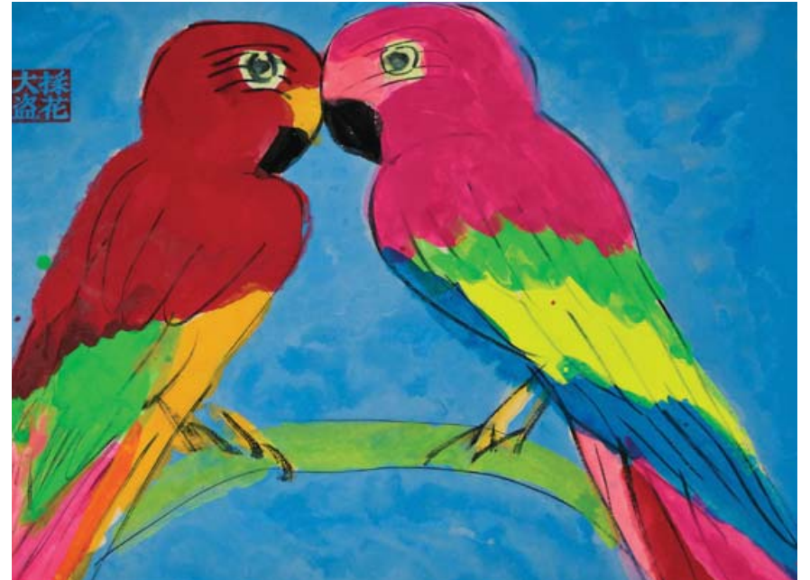
Love Birds on Green Branch, 37 x 50cm