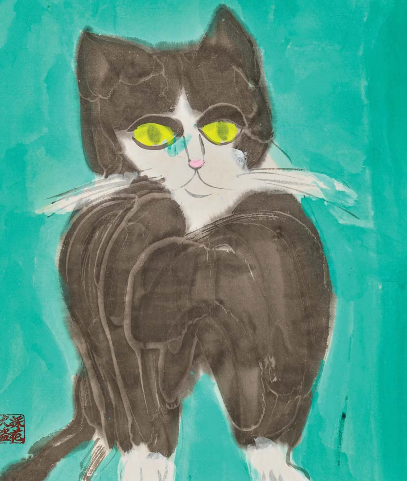
Bright Eyes, 46 x 40cm