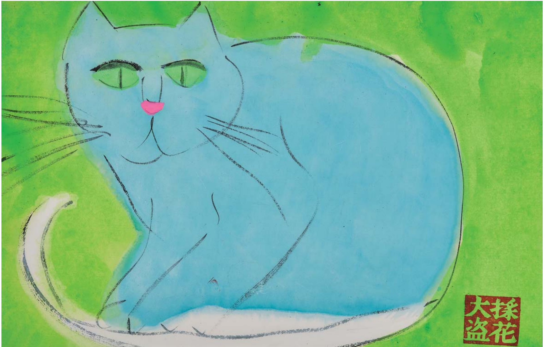
Mr Pink Nose, 24 x 38cm