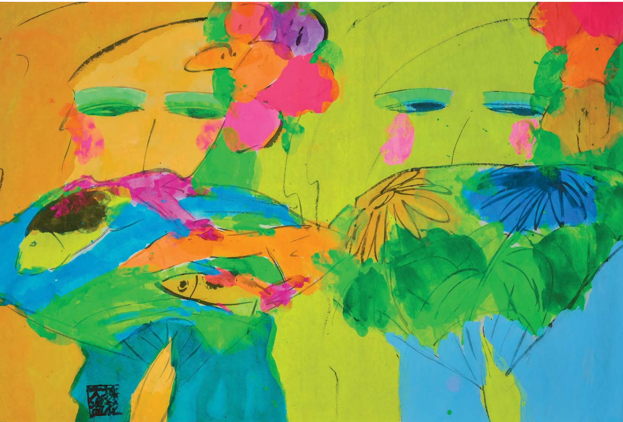
Fish Fan, Flower Fan, 61 x 91cm