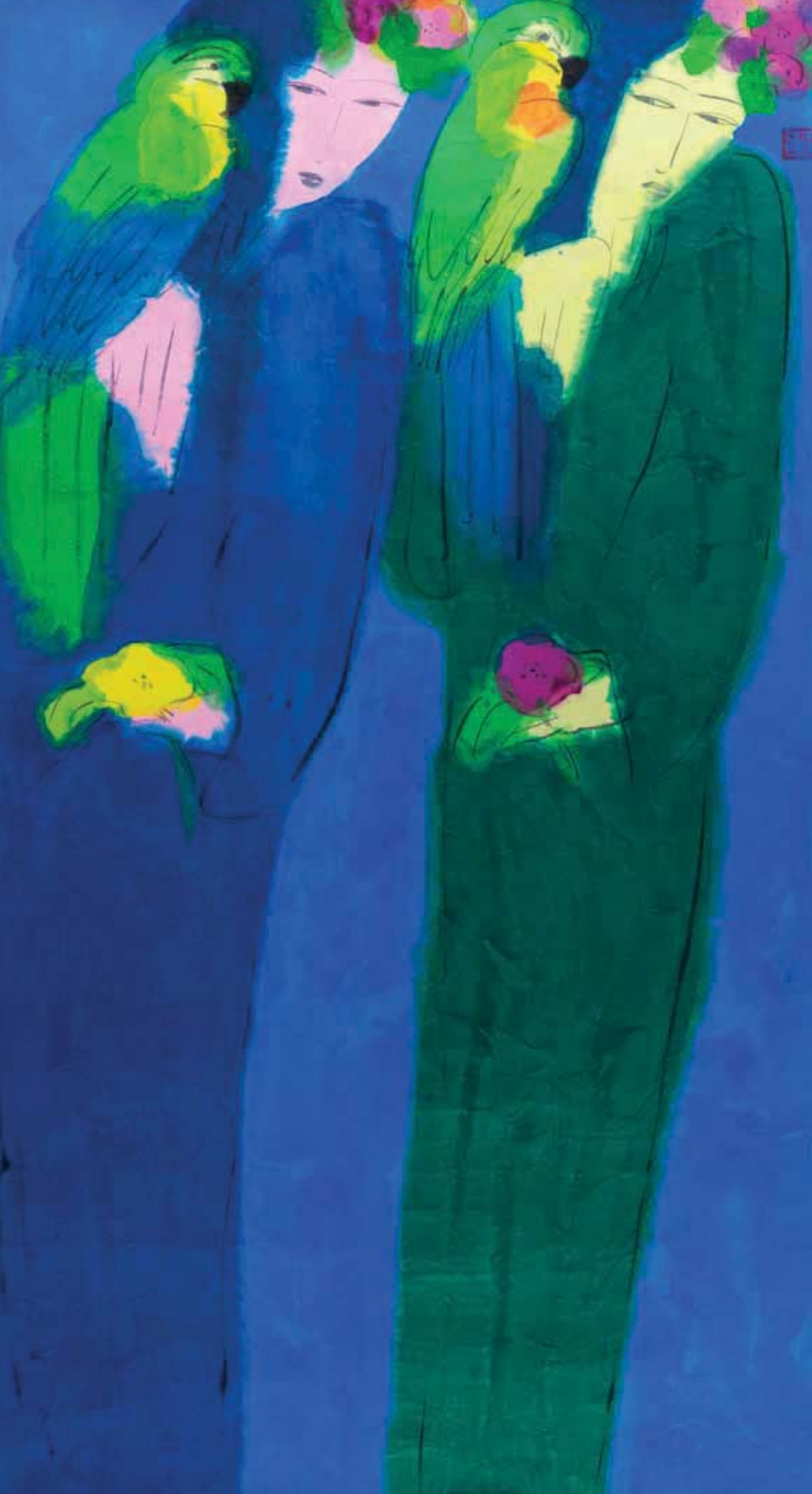
Two Green Parrots and Two Ladies, 178 x 97cm