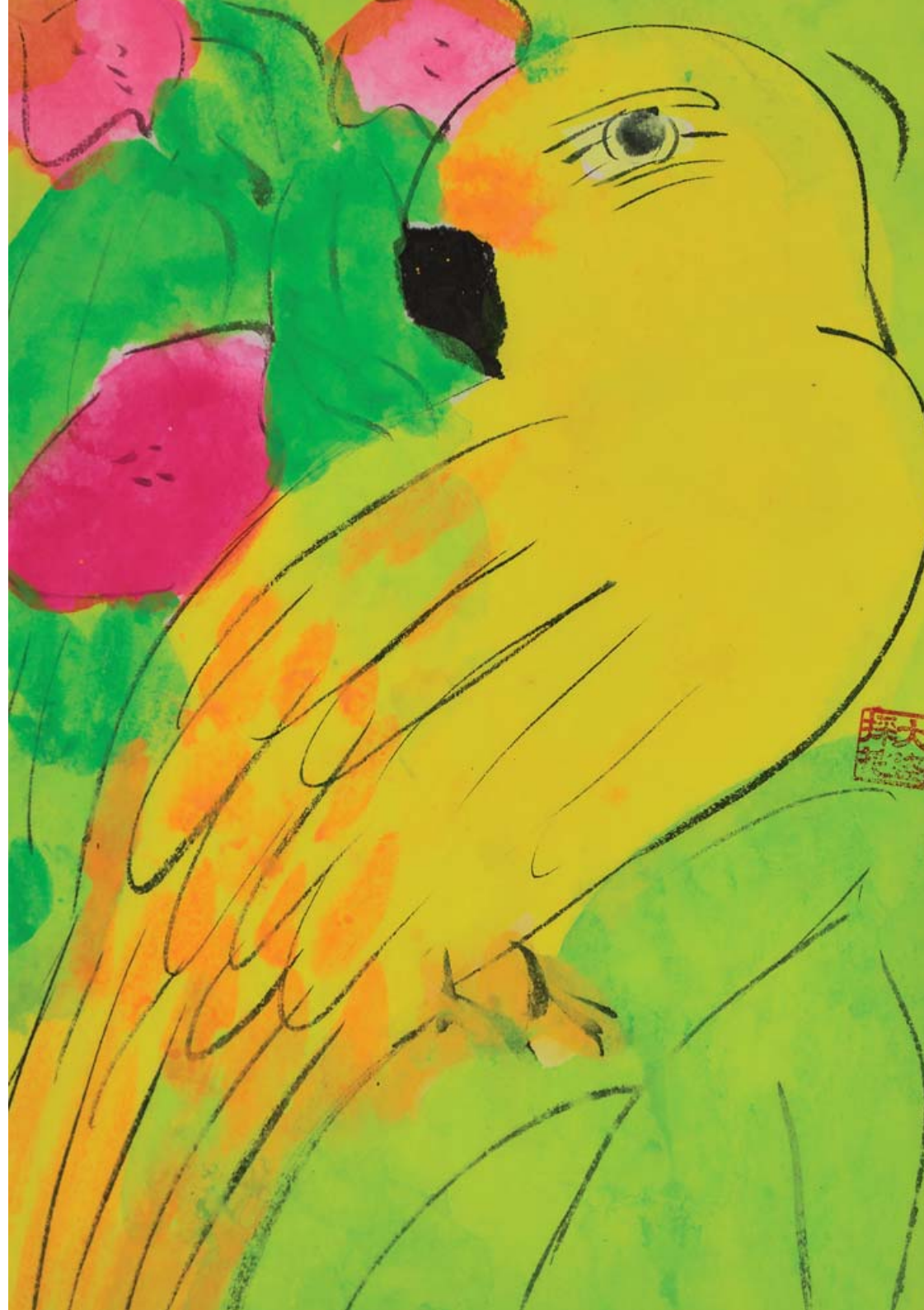
Back Cover: Four Brightly Coloured Parrots, 48 x 61cm