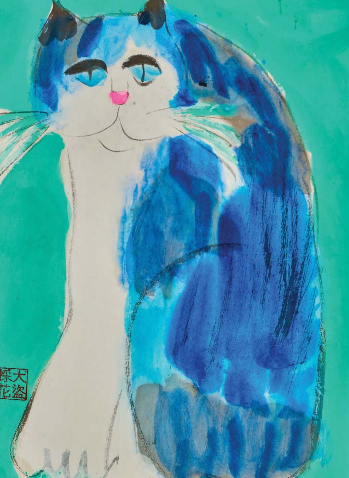
Blue Cat, Pink Nose, 47 x 34cm