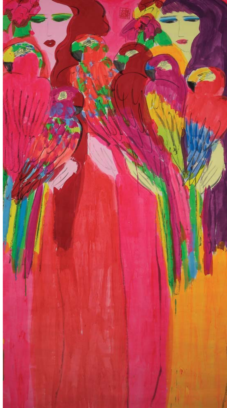
Six Colourful Parrots and Two Ladies 178 x 97cm