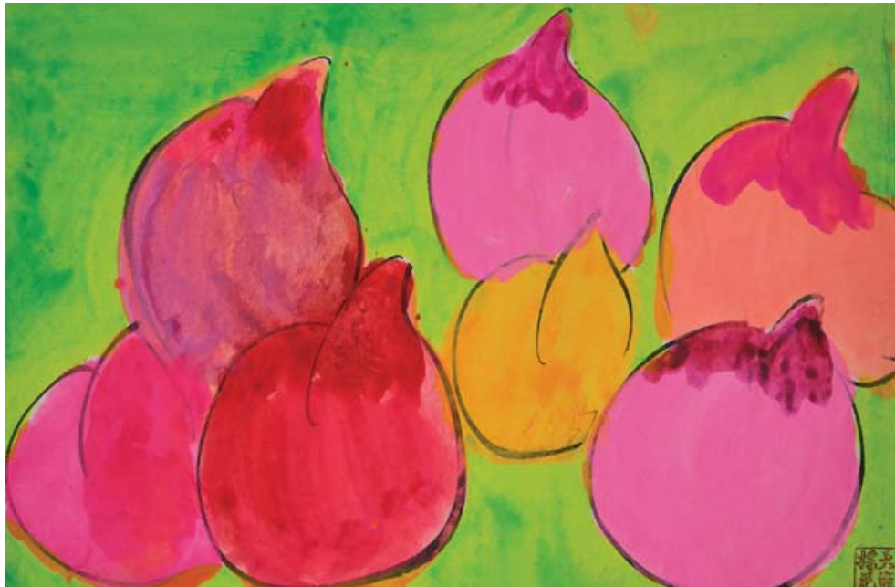
Fruity Fruits, 23 x 35cm