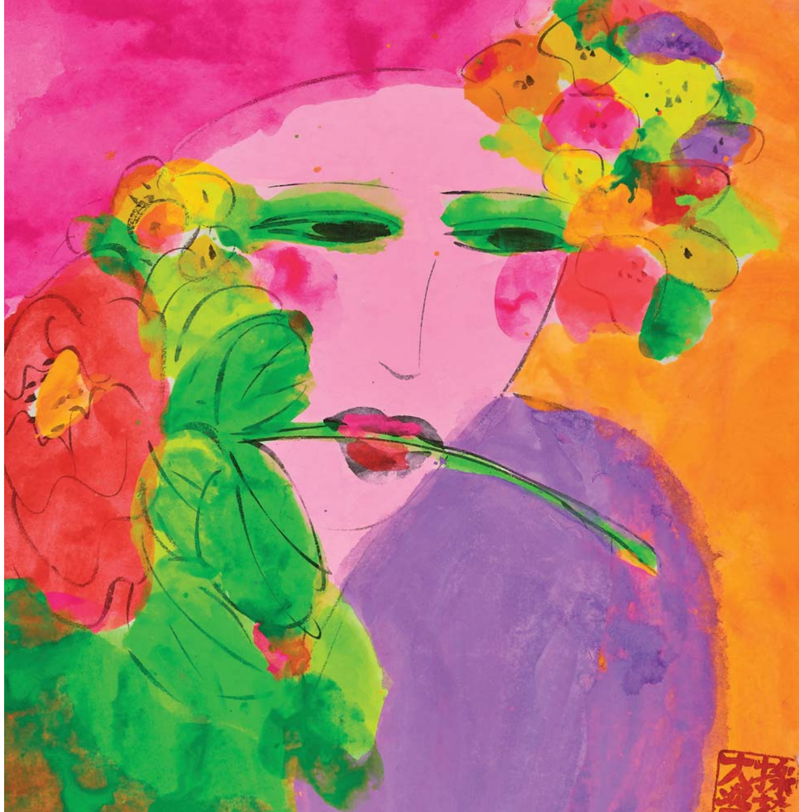
Elegant Lady with Bright Red Flower, 47 x 50cm