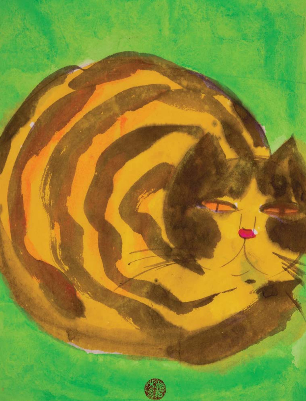
Orange Cat on Green, 46 x 35cm