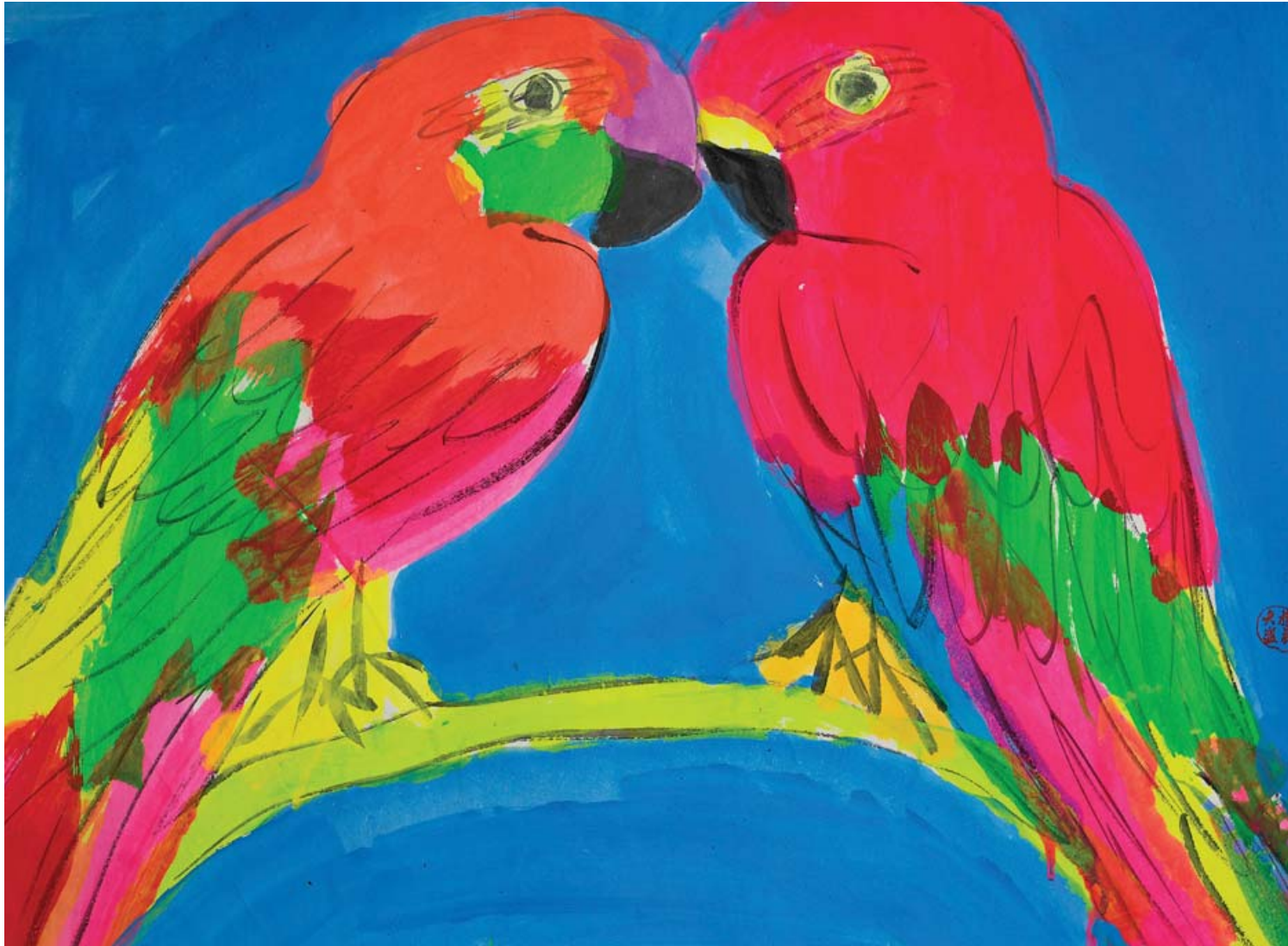
Love Birds on Blue, 48 x 66cm