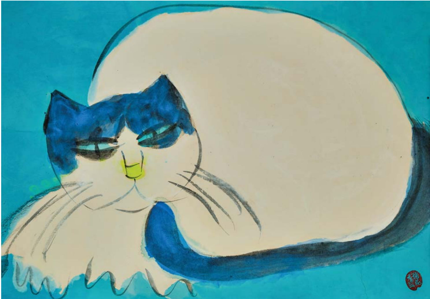
Sleeping White Cat, 40 x 57cm