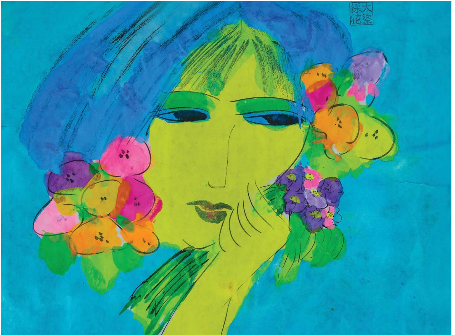
Beautiful Blue Lady, 51 x 58cm