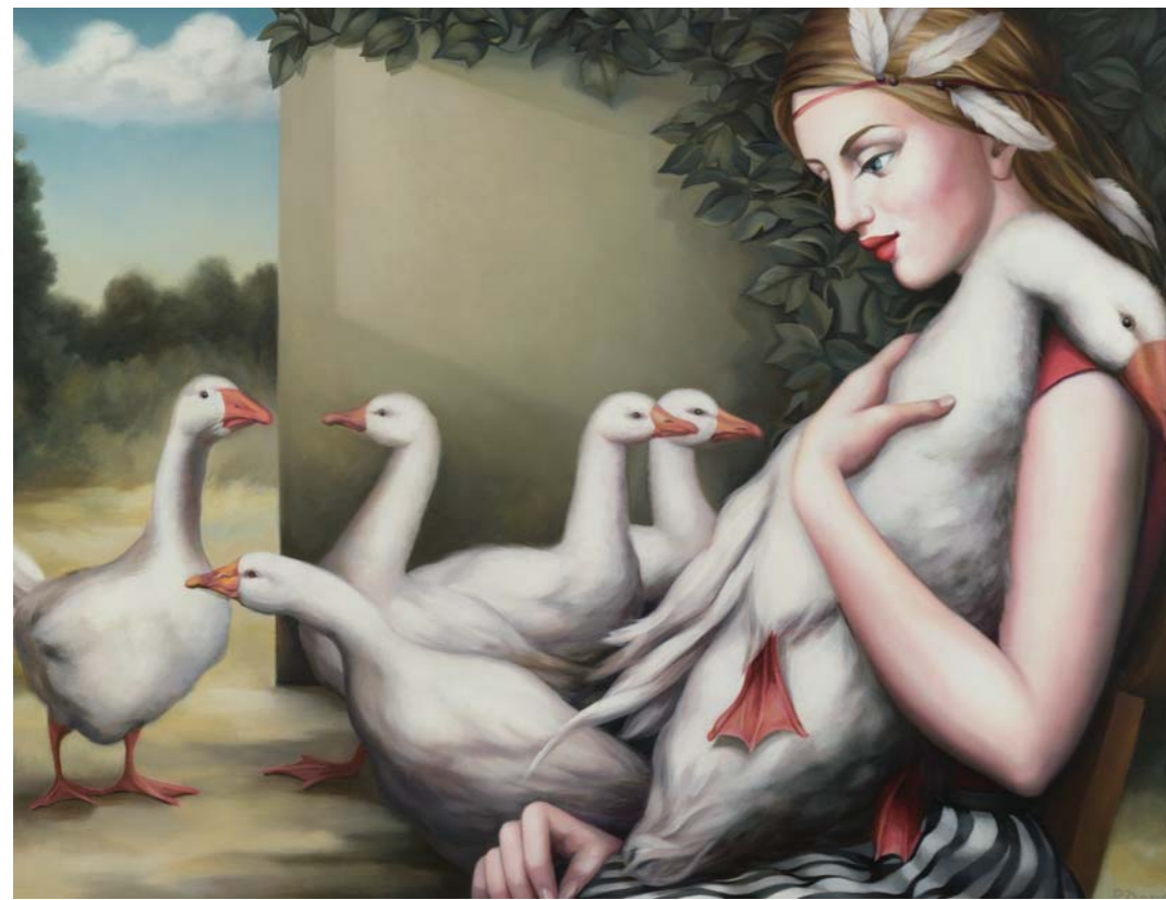
The Captured Heart 77 x 102cm, Oil on linen