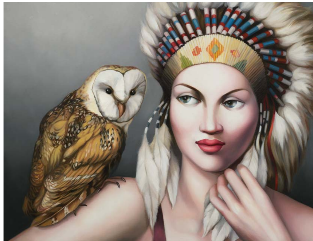
Wild Reverence 61 x 76cm, Oil on linen