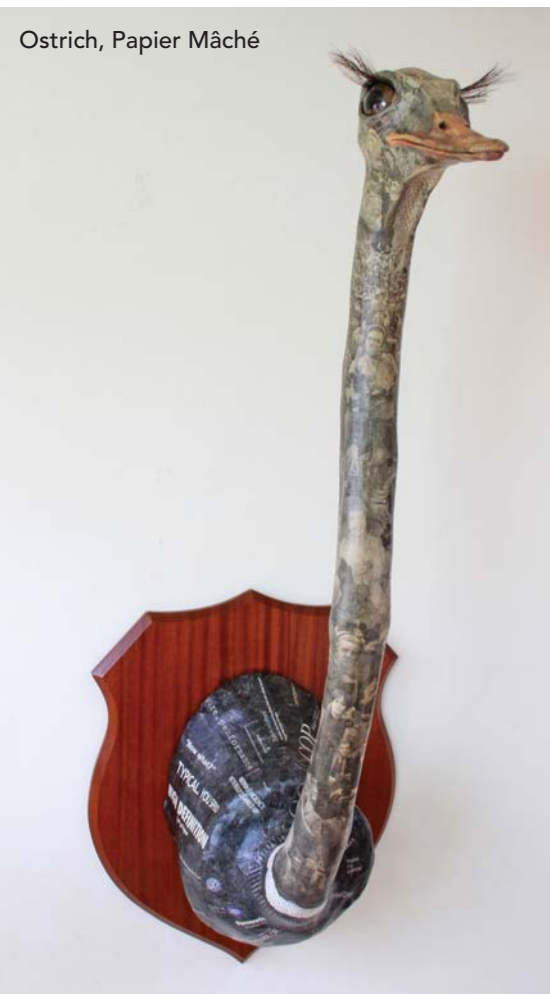
Ostrich, Papier Mâché