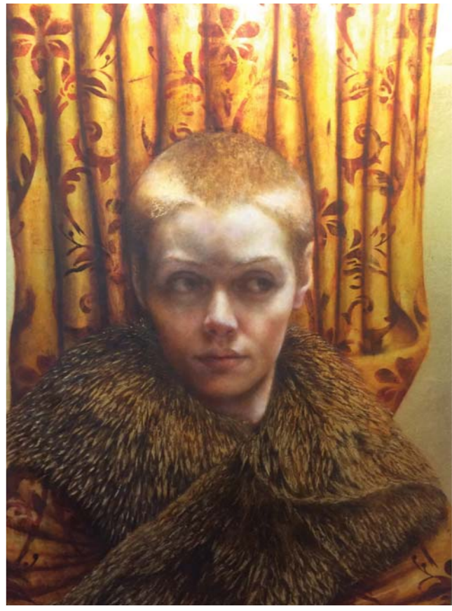
Beloved 100 x 64cm, Oil on metal leaf on board