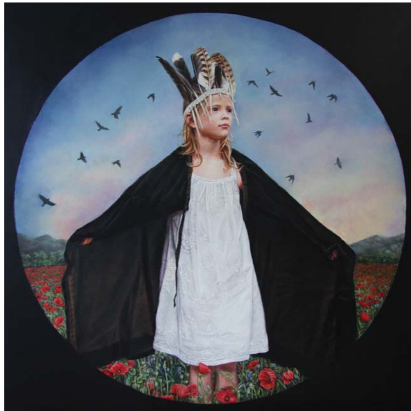
The Queen of Rome 58 x 58cm, Oil on board