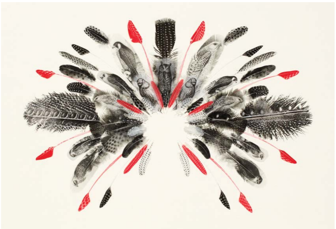
Bird of Prey Headdress 64 x 84cm, Hand printed dove, goose & turkey feathers collaged onto archival mountboard