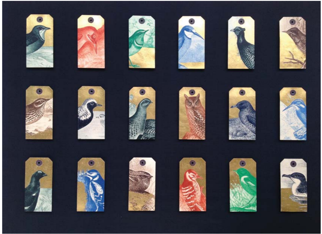
British Birds 63 x 86cm, Hand printed and gilded labels mounted on black silk