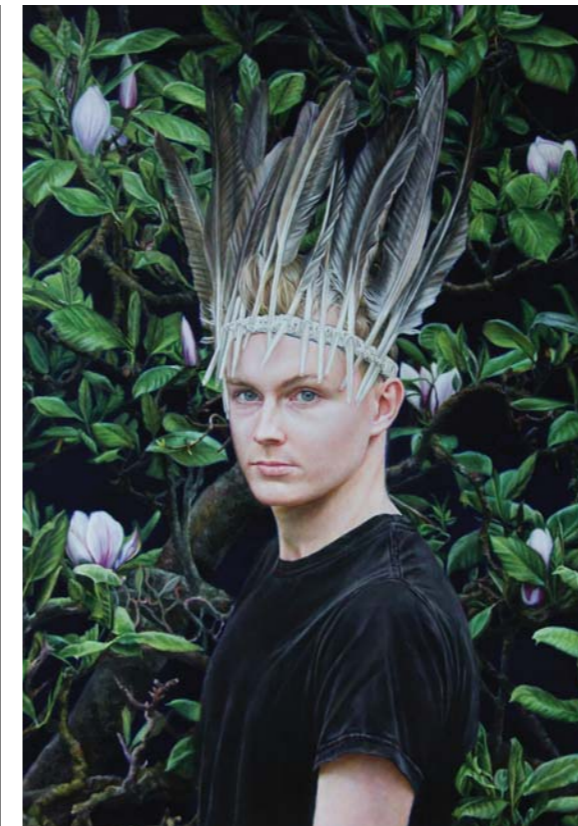
The Lookout 30 x 41cm, Oil on clayboard