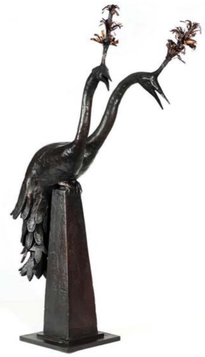
Two Headed Peacock, Height 120 cm, Edition 9, Bronze