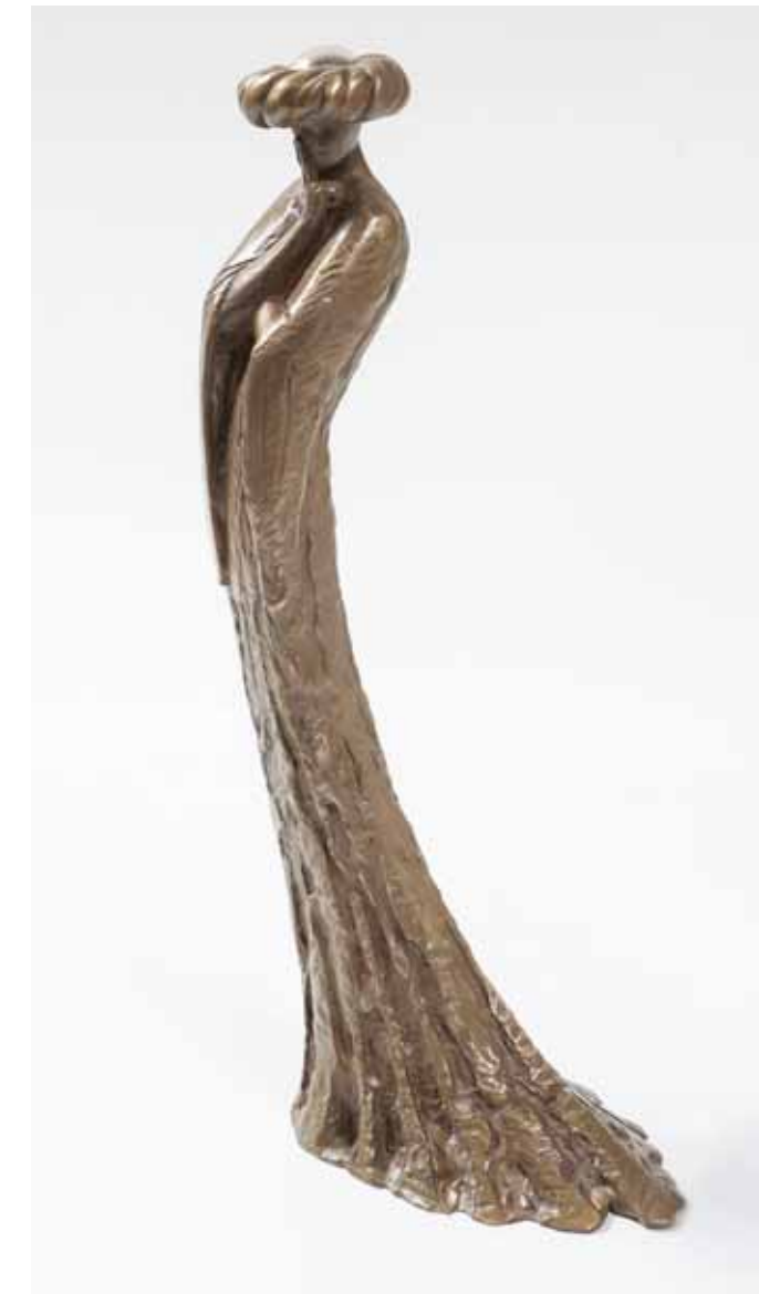
THE AMBASSADOR, BRONZE EDITION 8 Height 34 cm