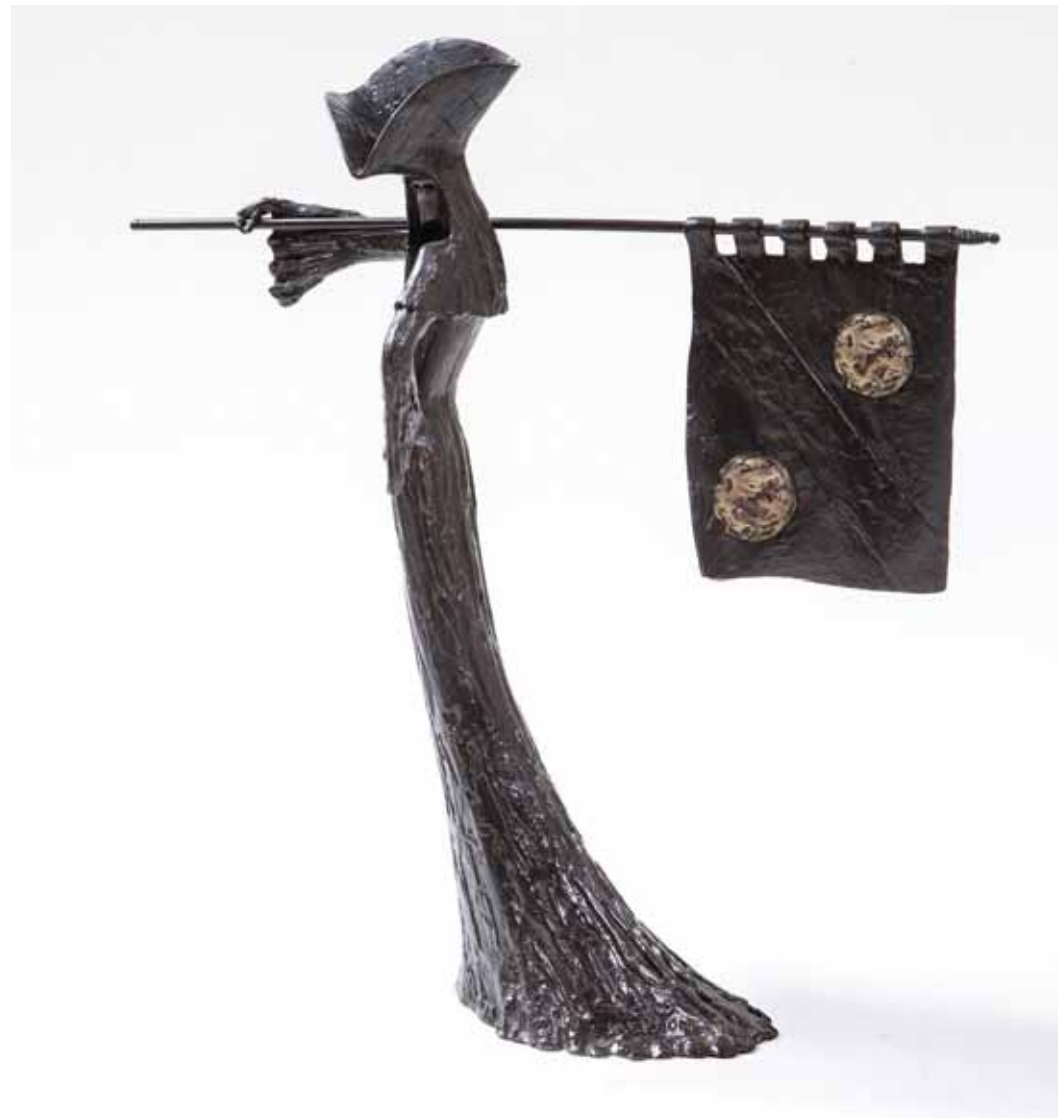
THE STANDARD BEARER, BRONZE EDITION 8 Height 38 cm