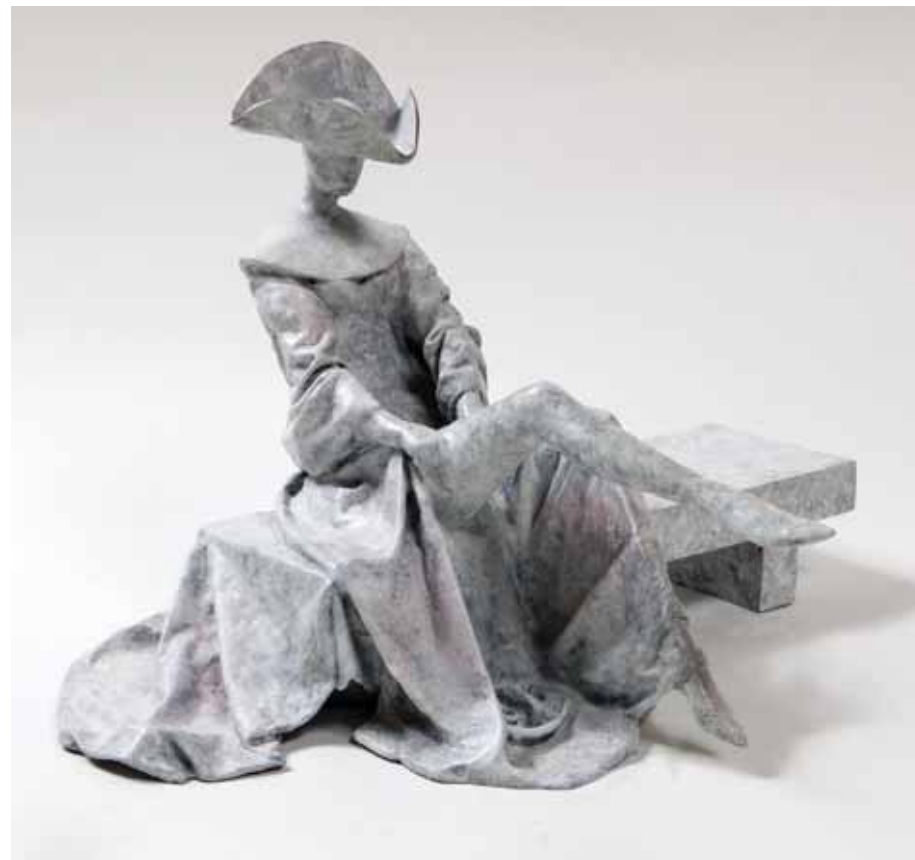
SILK STOCKINGS, BRONZE EDITION 8 Height 25 cm