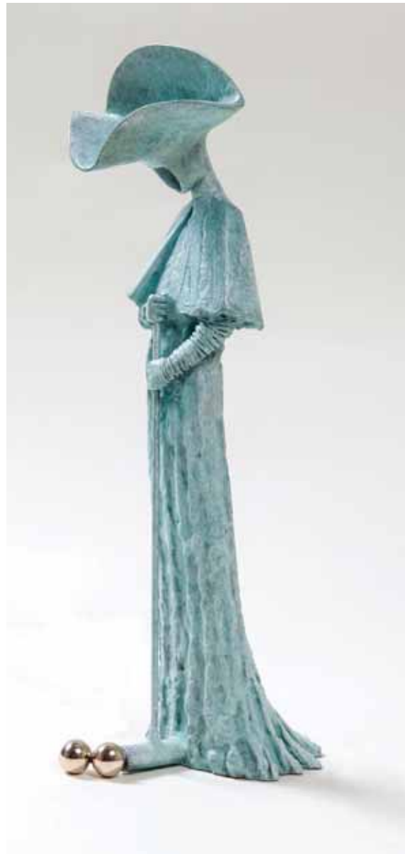
THE CROQUET PLAYER, BRONZE EDITION 8 Height 36 cm