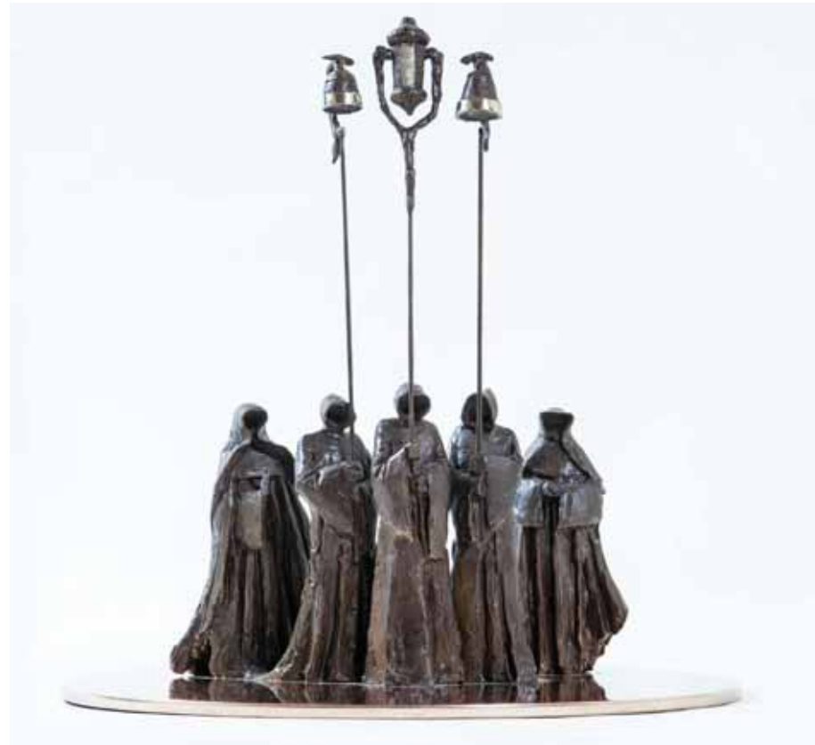
CANDLEMAS, BRONZE EDITION 8 Height 28 cm