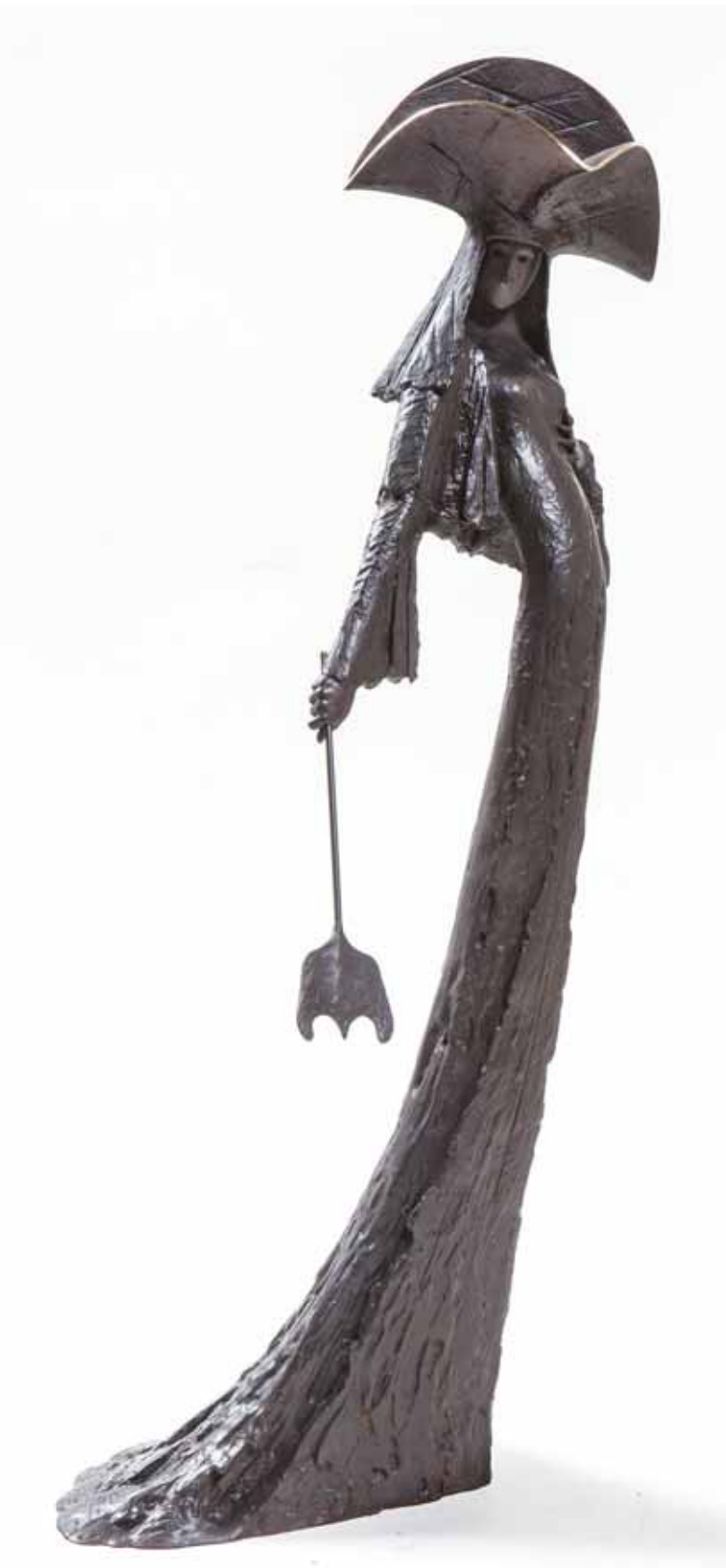
SALIERI'S FAN, BRONZE EDITION 8 Height 64 cm