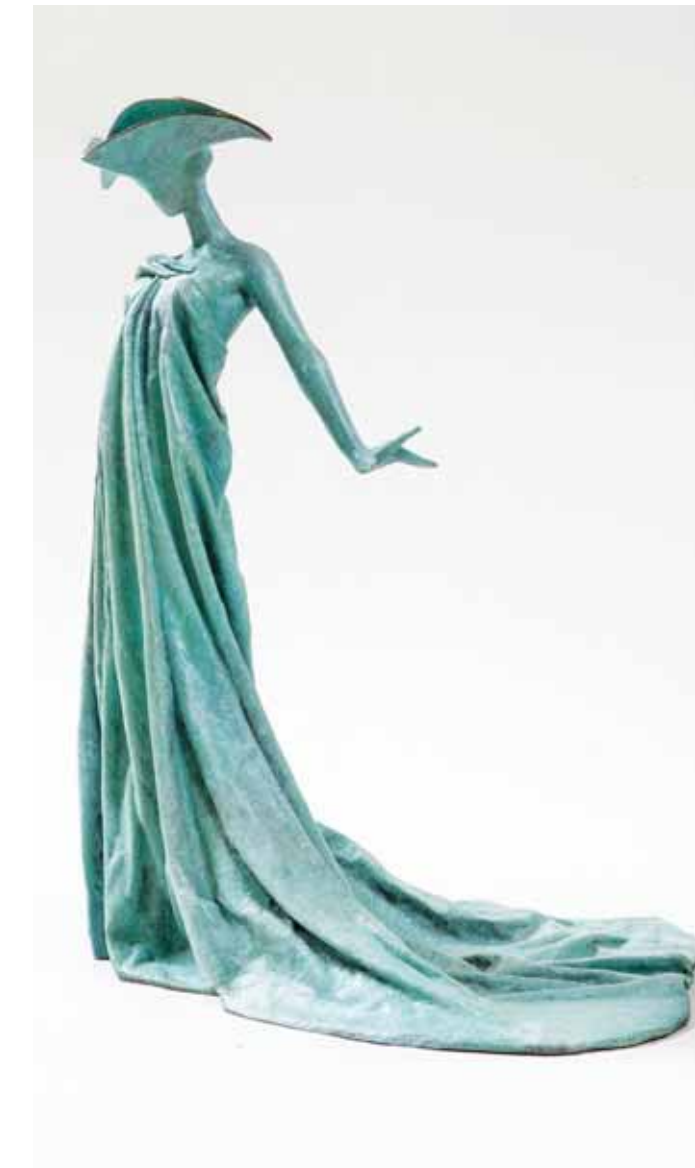
BATHING BELLE, BRONZE EDITION 8 Height 34 cm